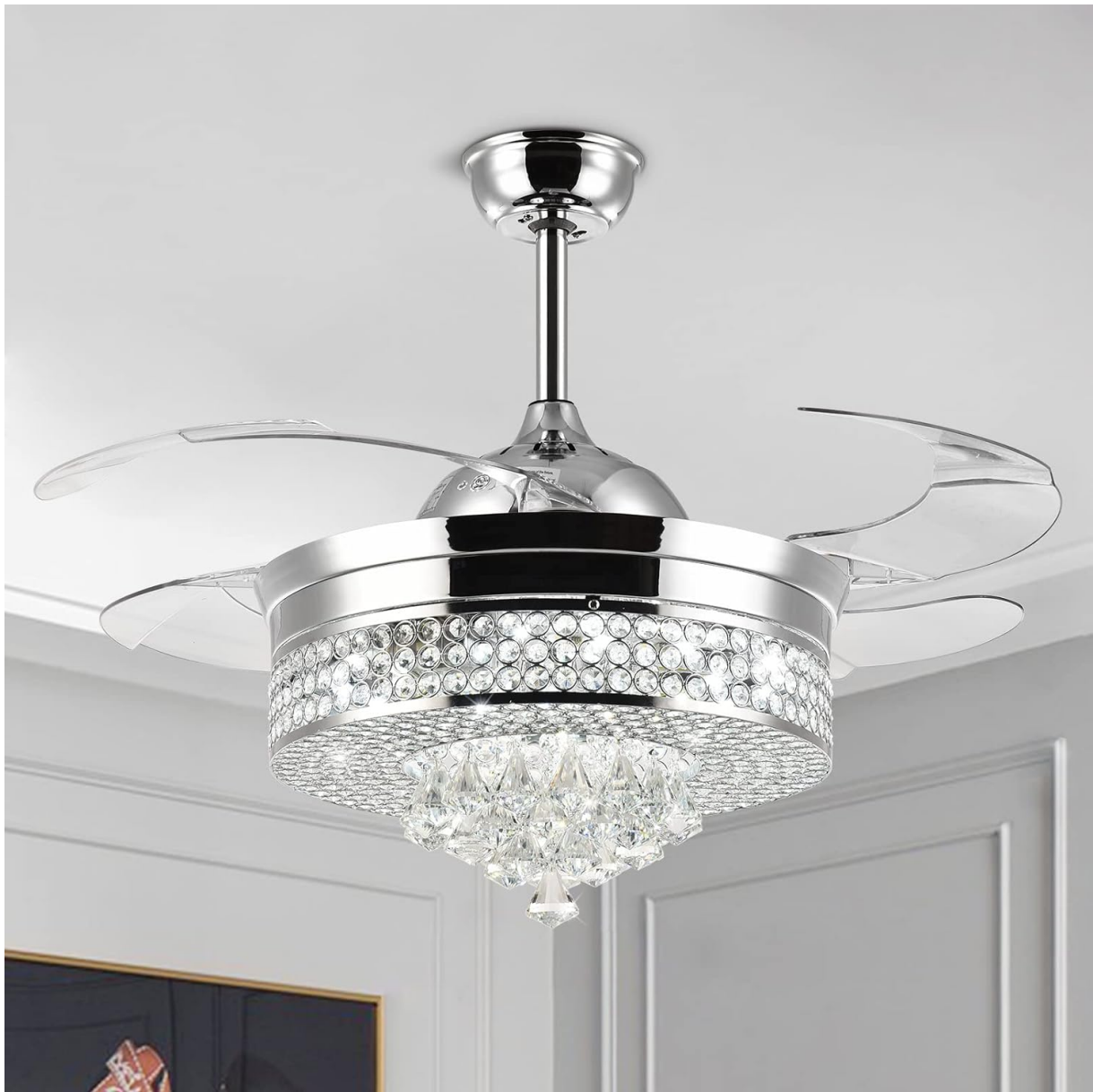
Figure 1.1: The NOXARTE 42 Inch Crystal Chandelier Fan, showcasing its elegant design and retractable blades.