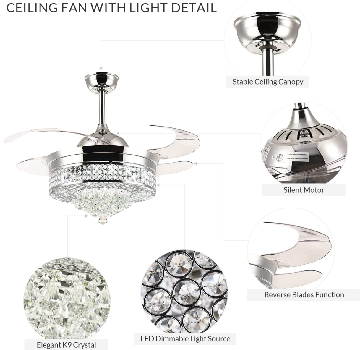
Figure 3.1: Key components and features of the ceiling fan with light.