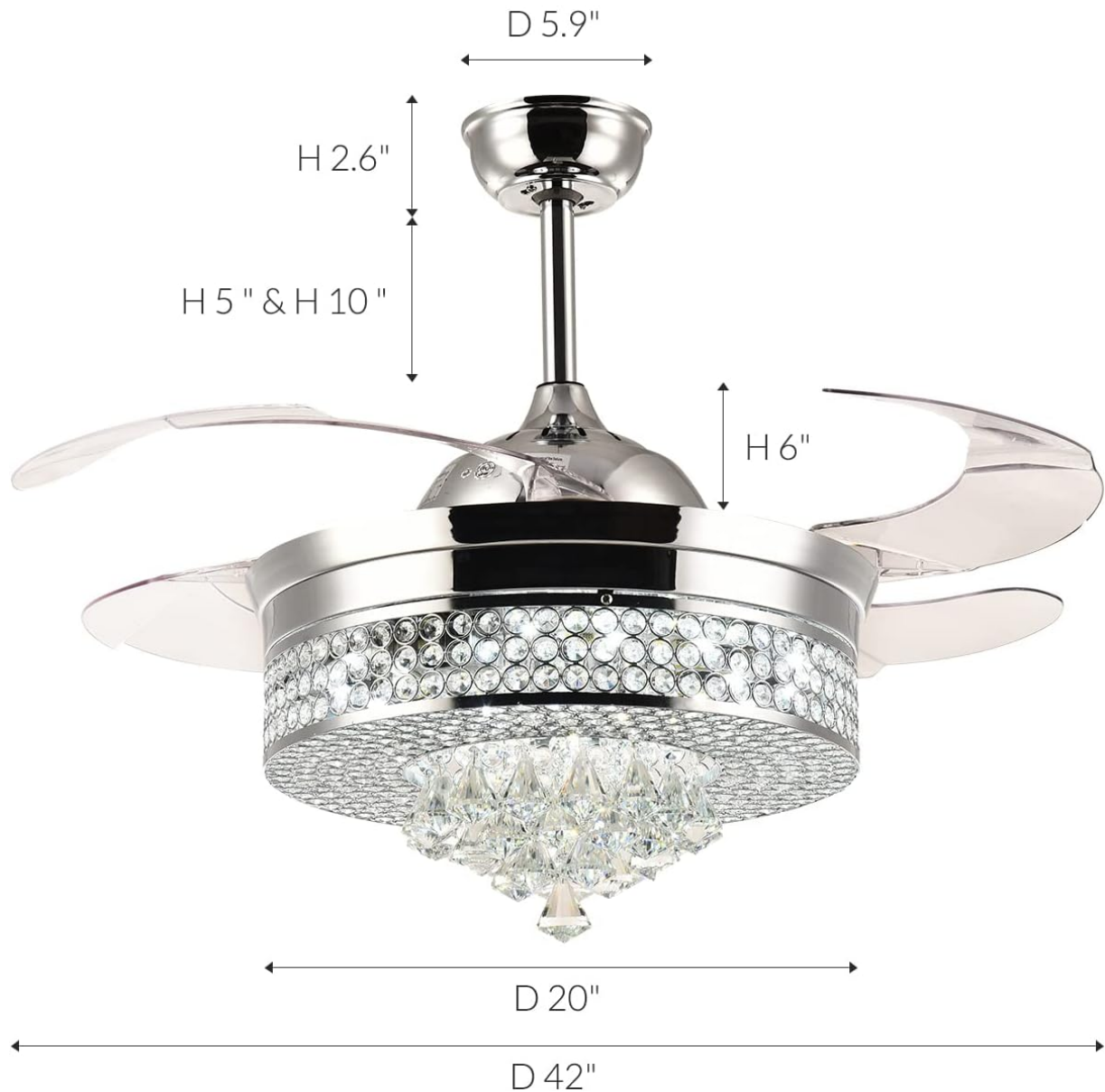
Figure 4.1: Product dimensions for installation planning.