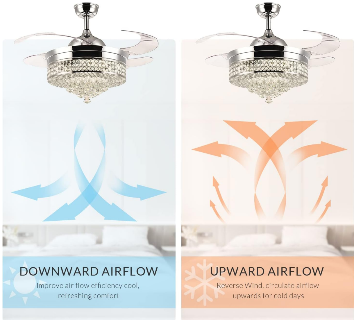
Figure 3.3: Forward and reverse function for year-round comfort.