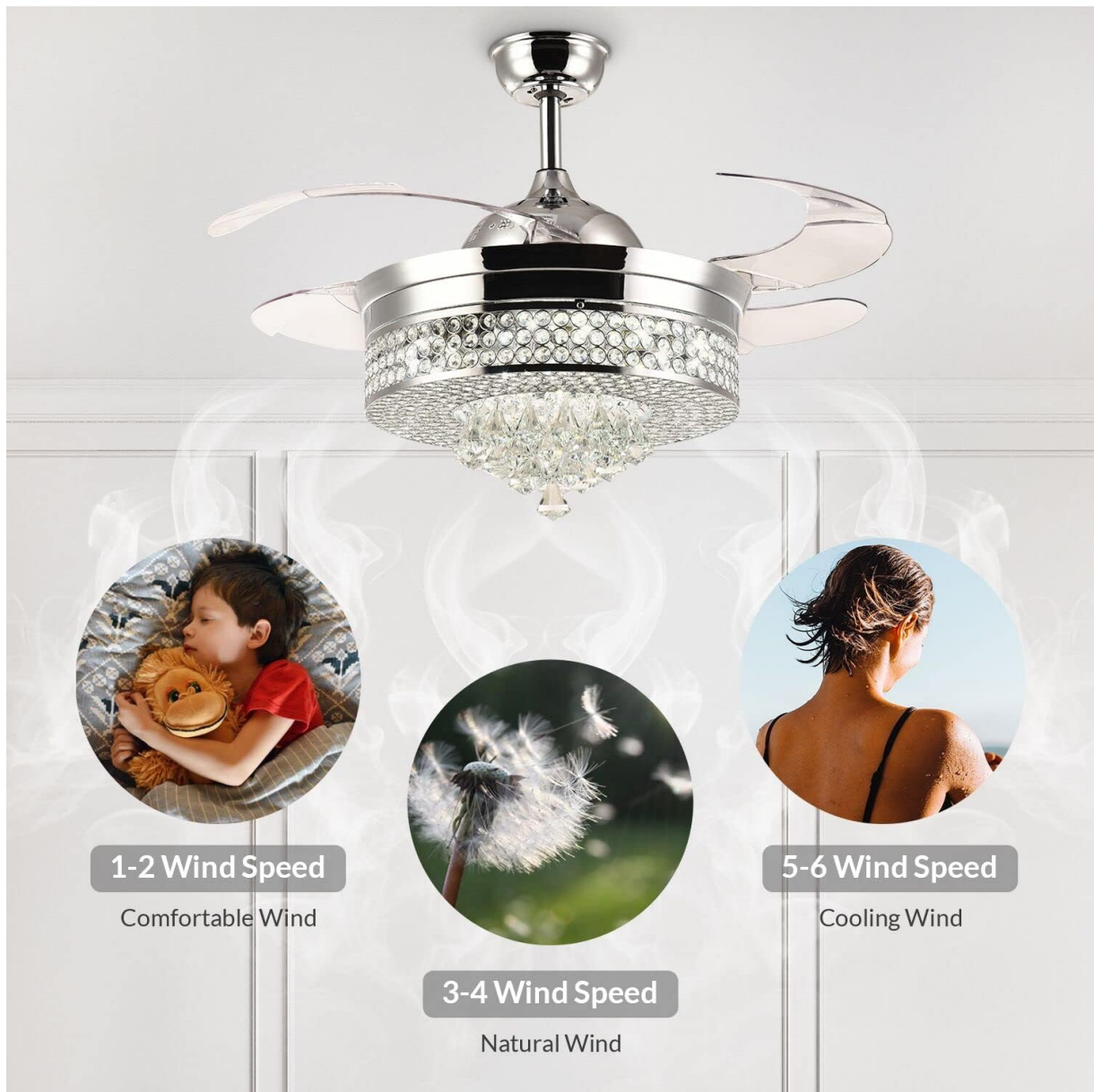
Figure 3.4: Fan speed settings for various comfort levels.