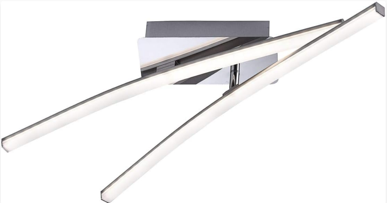
Image: The LeuchtenDirekt LED Ceiling Light, showcasing its two adjustable light arms positioned in a V-shape, highlighting its modern design.

Thank you for choosing the LeuchtenDirekt LED Ceiling Light. This modern and functional lighting fixture is designed to enhance your living space with its warm white illumination and adjustable arms. Its robust steel construction ensures durability and a contemporary aesthetic.