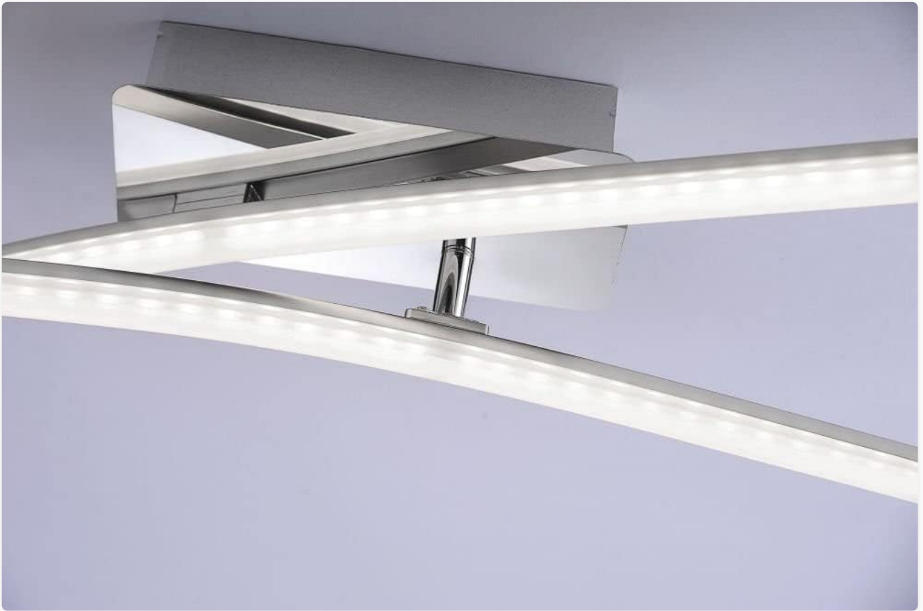
Image: A close-up view of the light's central base and the pivot mechanism for one of the adjustable arms, illustrating the connection point.