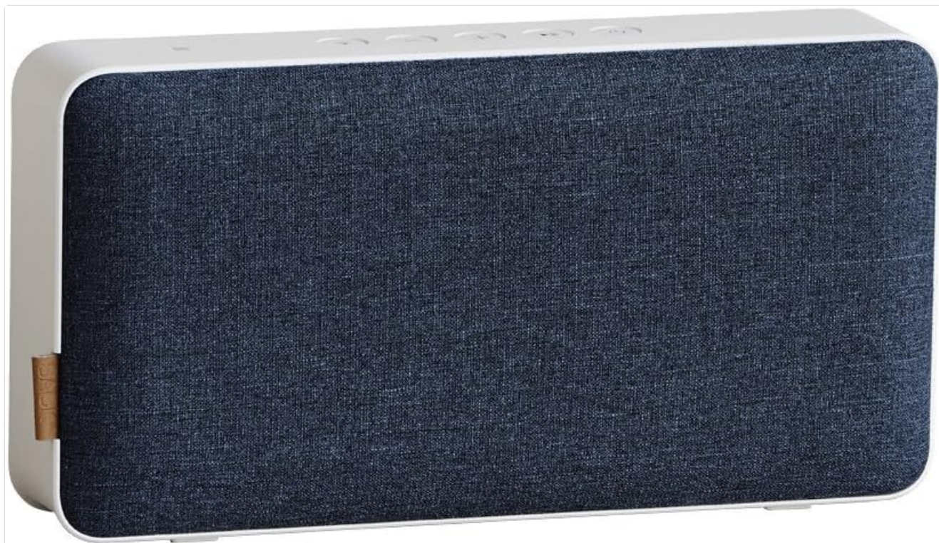
Figure 1: Front view of the SACKit Touch 300 Multiroom Speaker. This image displays the speaker's design, featuring a dark fabric grille covering the front, a white frame, and rounded edges.

The SACKit Touch 300 is a versatile multiroom speaker designed to deliver high-quality audio throughout your home. Its