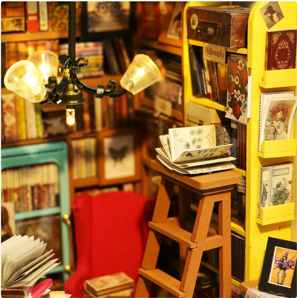
Image 5.3: Close-up of the installed LED lighting and interior details.