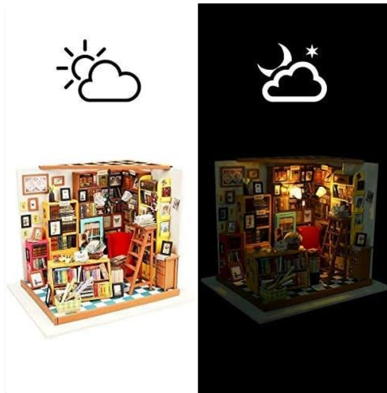
Image 6.1: Day and night view of the Sam's Study kit, showcasing the LED illumination.