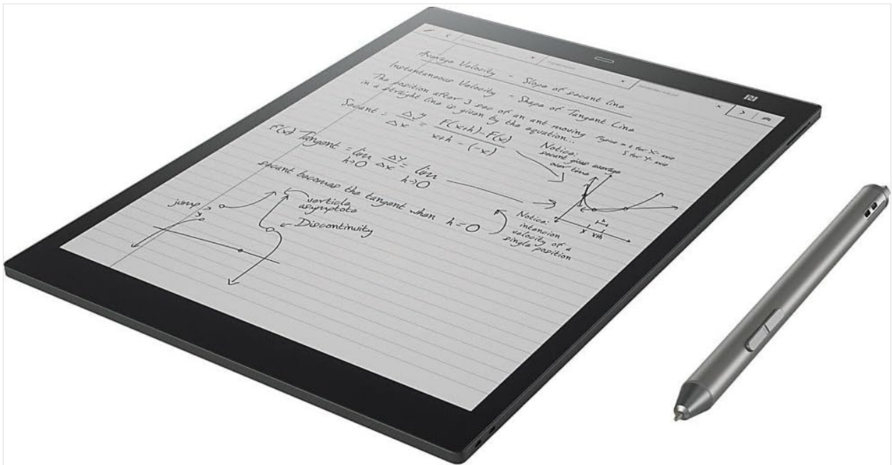
Image: The Sony DPT-CP1/B Digital Paper device shown with its accompanying stylus.