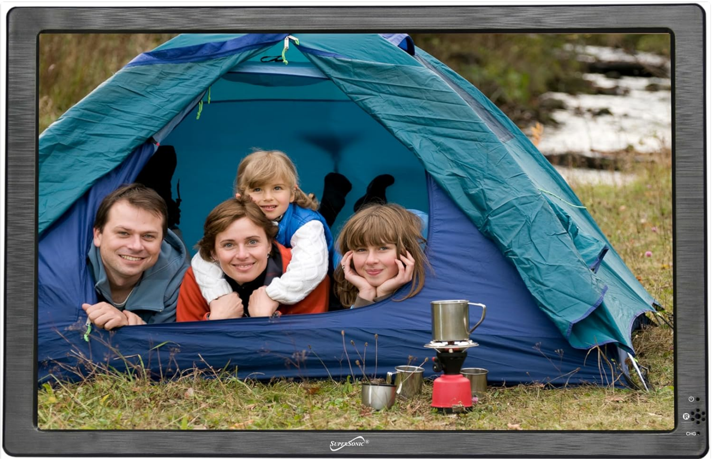
Image: Front view of the Supersonic SC-2812 Portable LED TV, showcasing its 12-inch screen with a vibrant image.