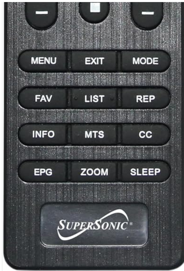
Image: Detailed view of the Supersonic SC-2812 remote control, showing buttons for power, mute, numbers, navigation, volume, channel, menu, exit, mode, and other functions.

The full-function remote control allows for convenient operation of all TV features from a distance. Insert 2 AAA batteries (included) into the remote control before first use.