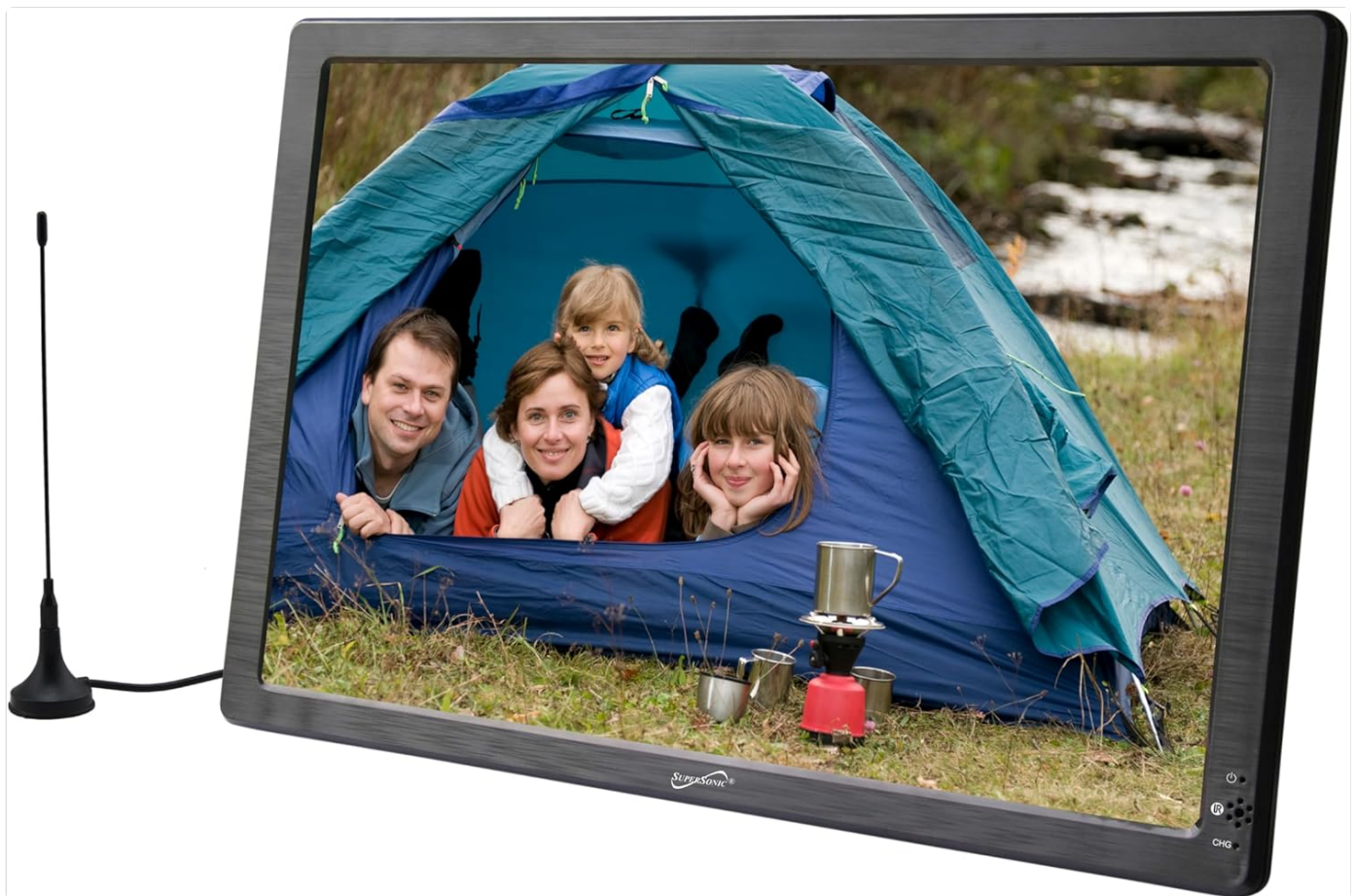
Image: Supersonic SC-2812 Portable LED TV with a connected external antenna, ready for receiving broadcast signals.