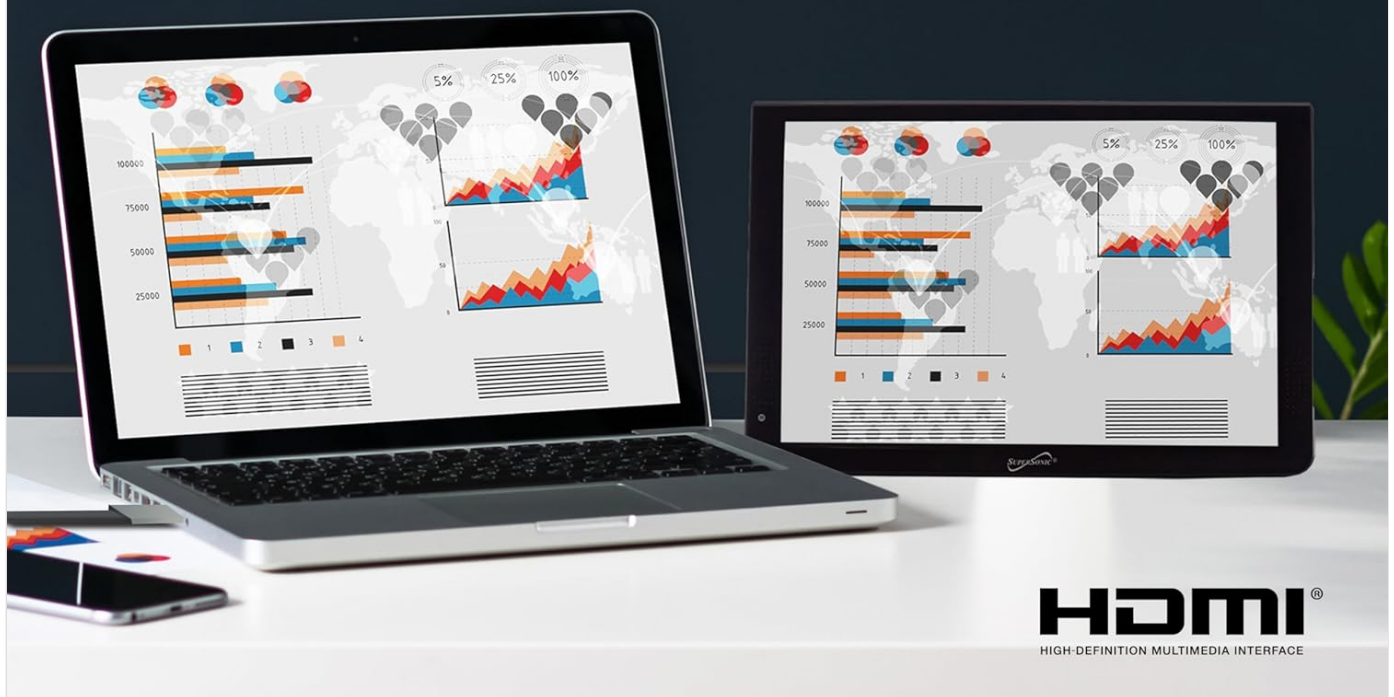
Image: The Supersonic SC-2812 Portable LED TV functioning as a computer monitor, connected to a laptop via its Mini VGA or HDMI input.