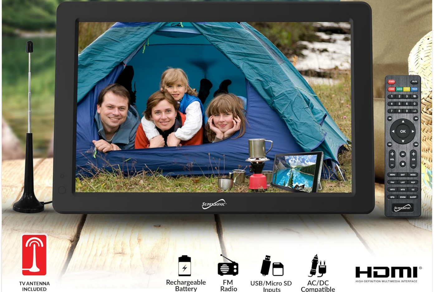
Image: Supersonic SC-2812 Portable LED TV shown with its remote control, antenna, and other accessories, highlighting its features.

WATCH TV & LISTEN TO THE RADIO ON THE GO!