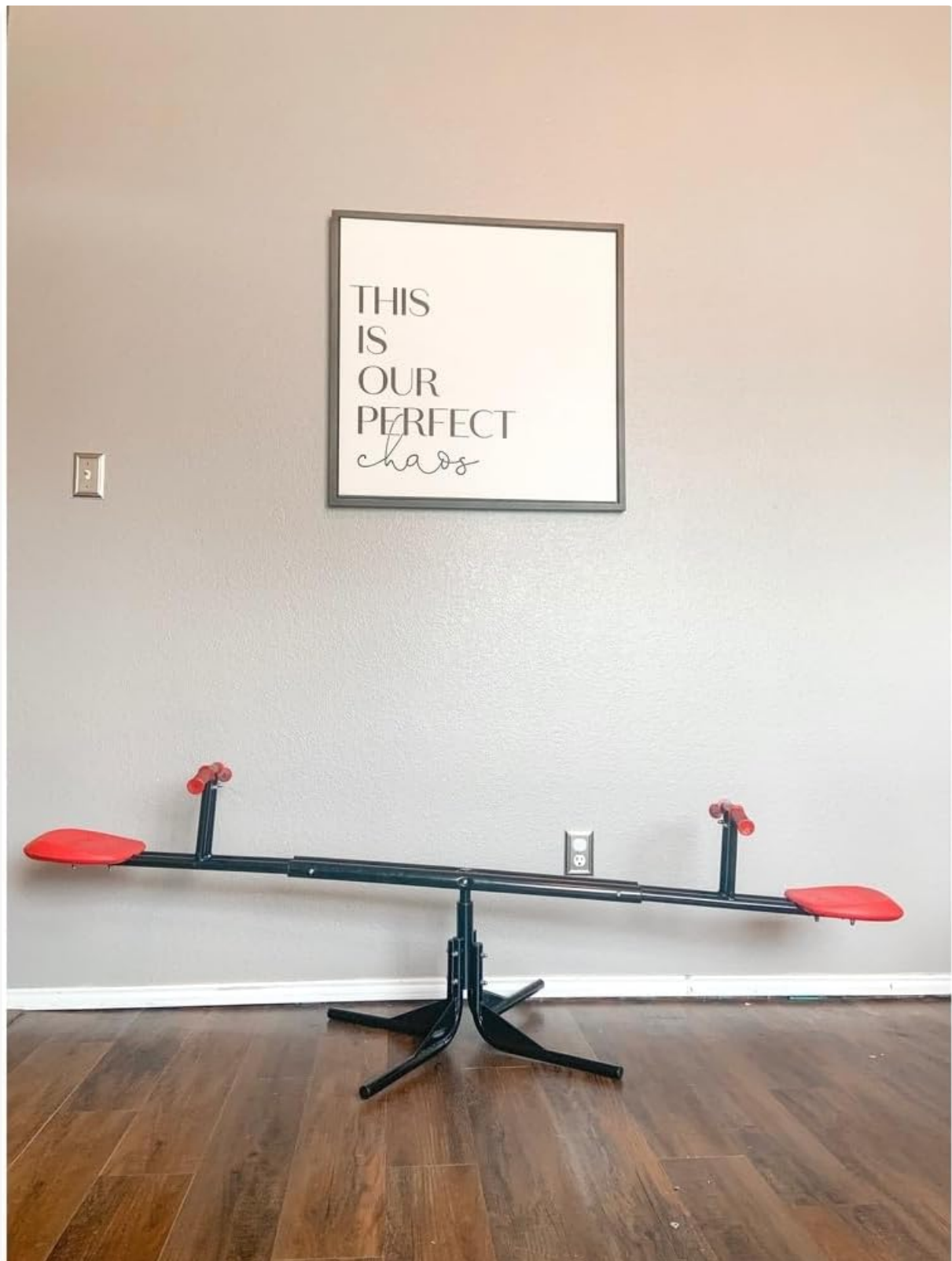
Image: The Gener8 Teeter Totter fully assembled and ready for use, positioned indoors.

Assembled Dimensions: Approximately 78 inches (L) x 30 inches (W) x 22 inches (H).