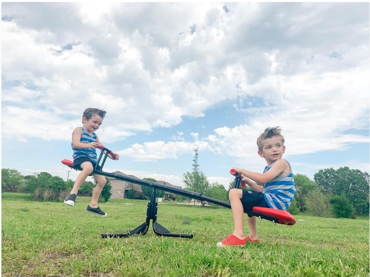
Image: Two young boys playing on the Gener8 Teeter Totter outdoors in a grassy field, showcasing its use in an open environment.