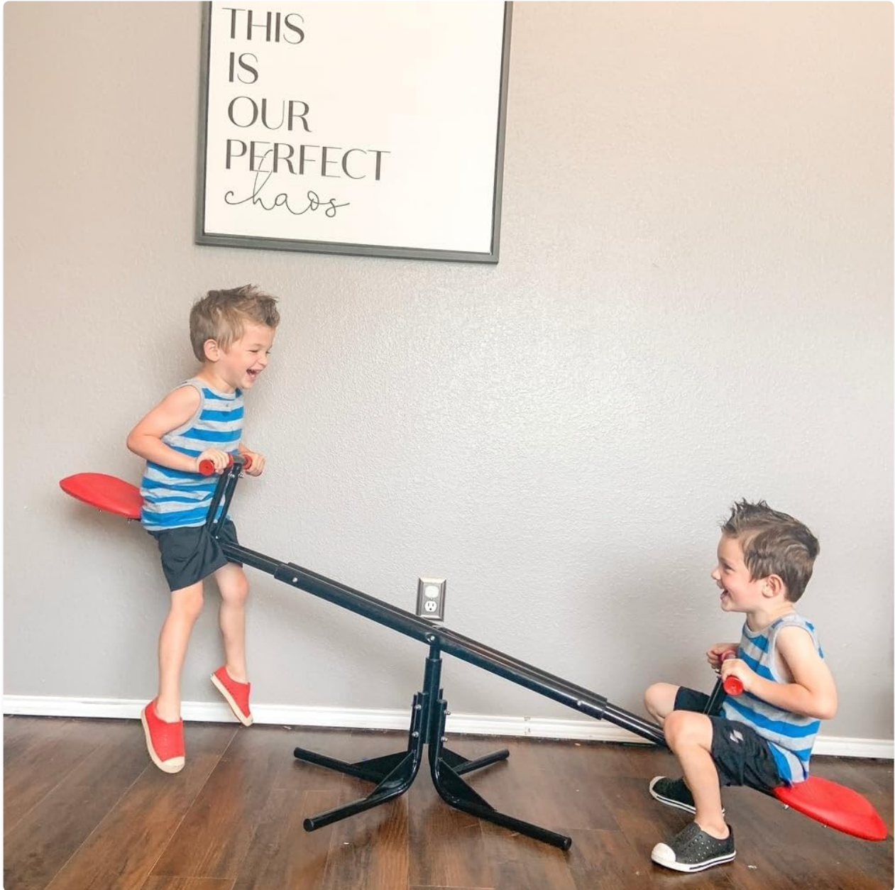
Image: Two young boys enjoying the Gener8 Teeter Totter indoors, demonstrating its up-and-down movement.

Weight Limit: Maximum 95 lbs (approximately 43 kg) per seat.