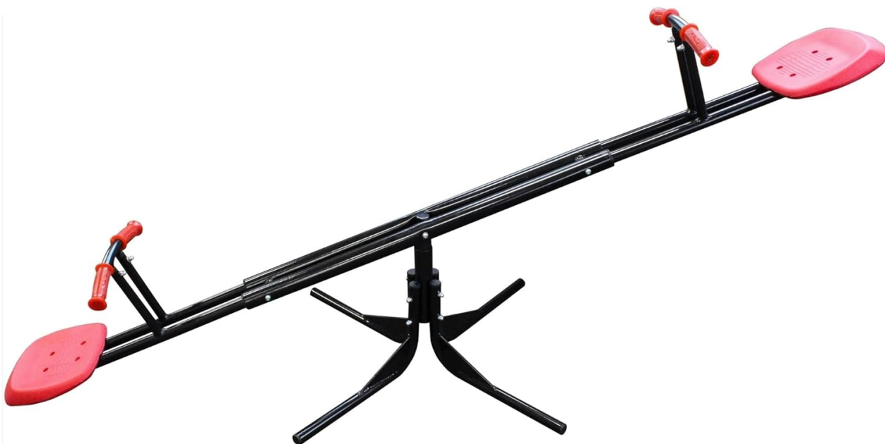
Image: The Gener8 Teeter Totter fully assembled, featuring a black metal frame, red seats, and red soft-grip handles.

Welcome to your new Gener8 Teeter Totter. This manual provides essential information for the safe assembly, operation, and maintenance of your product. Please read all instructions carefully before use to ensure a safe and enjoyable experience.