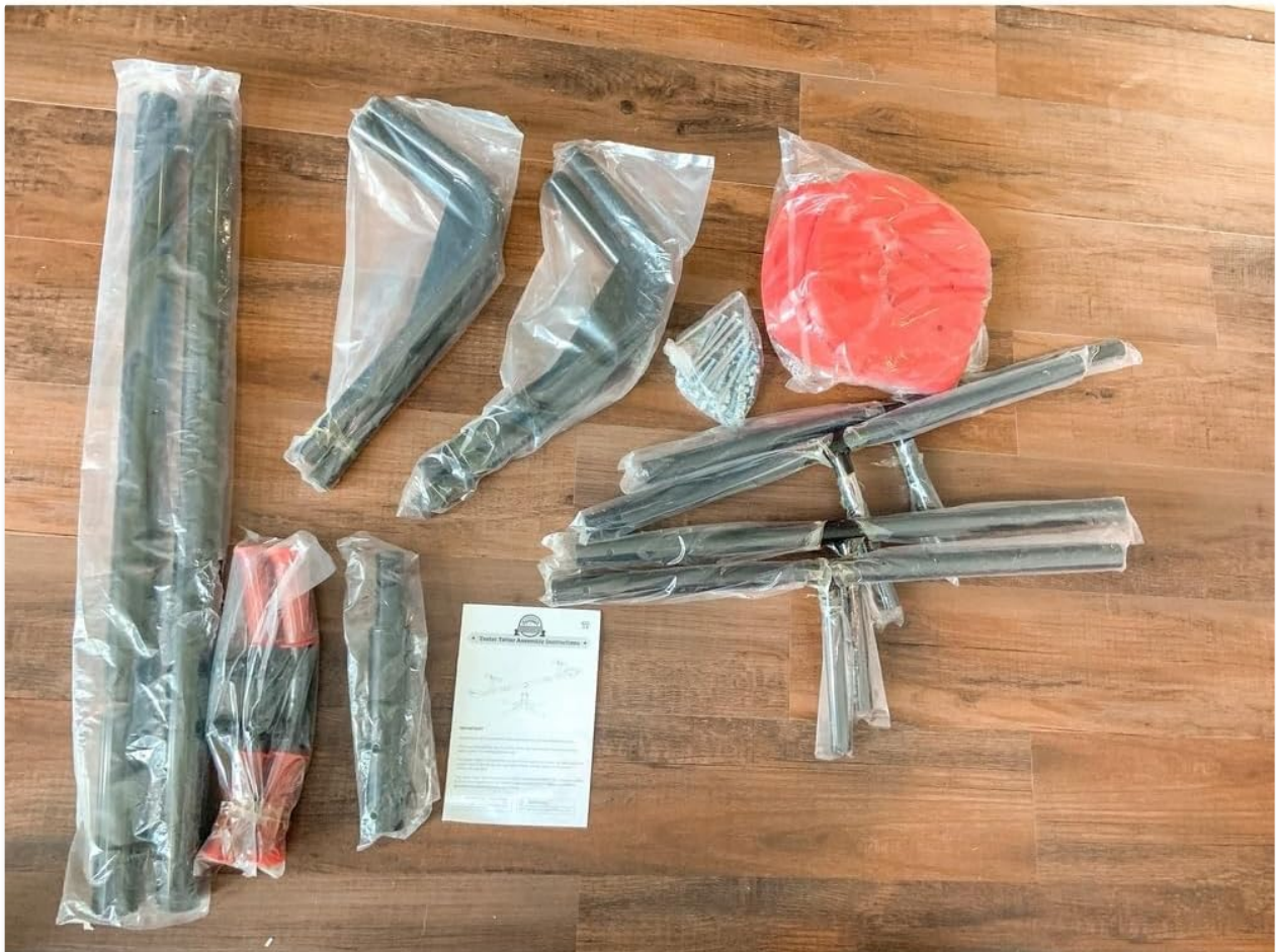
Image: All components of the Gener8 Teeter Totter, including the main beam, base parts, seats, handles, and hardware, laid out for assembly.