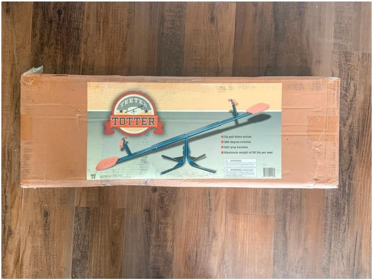
Image: The Gener8 Teeter Totter product packaging box.