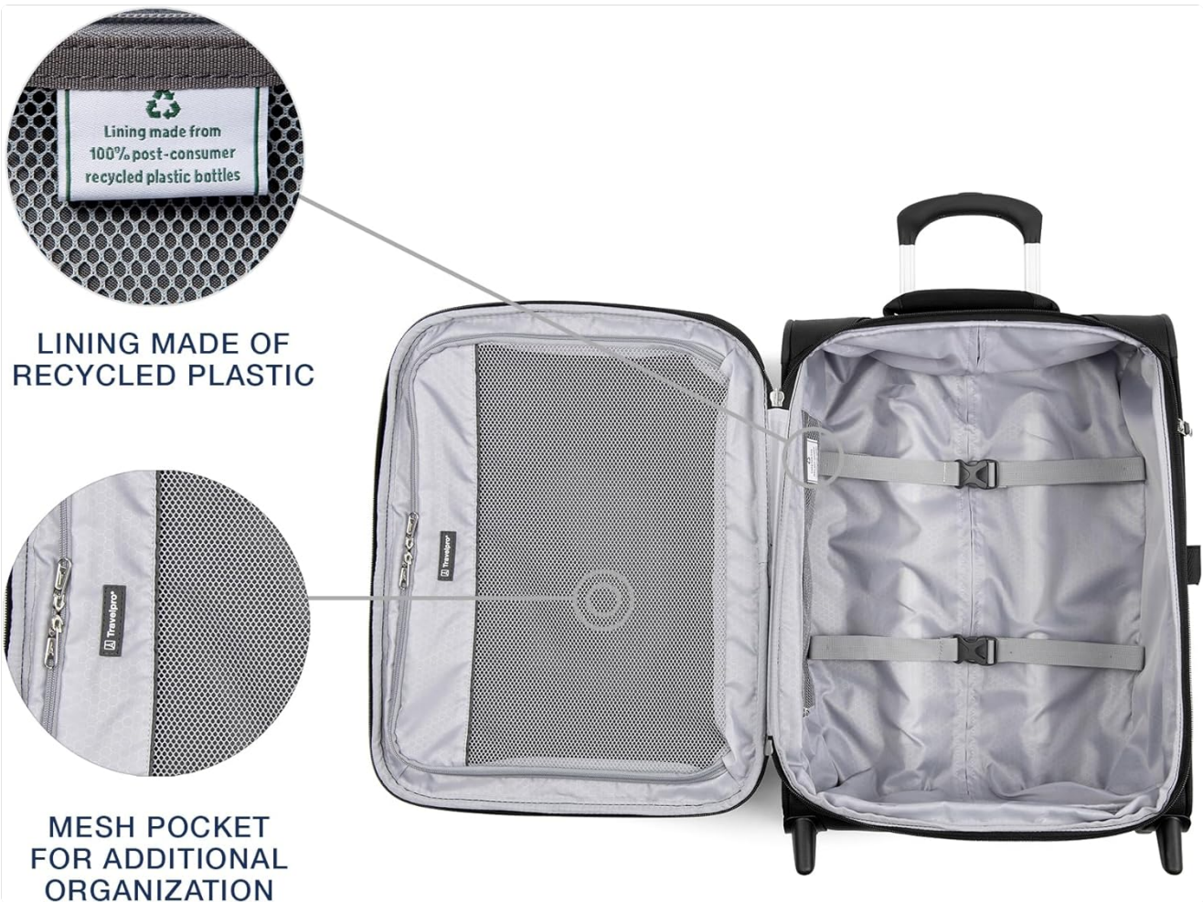
Figure 2.3: Interior view with lining made from recycled plastic, a mesh pocket for organization, and adjustable hold-down straps.