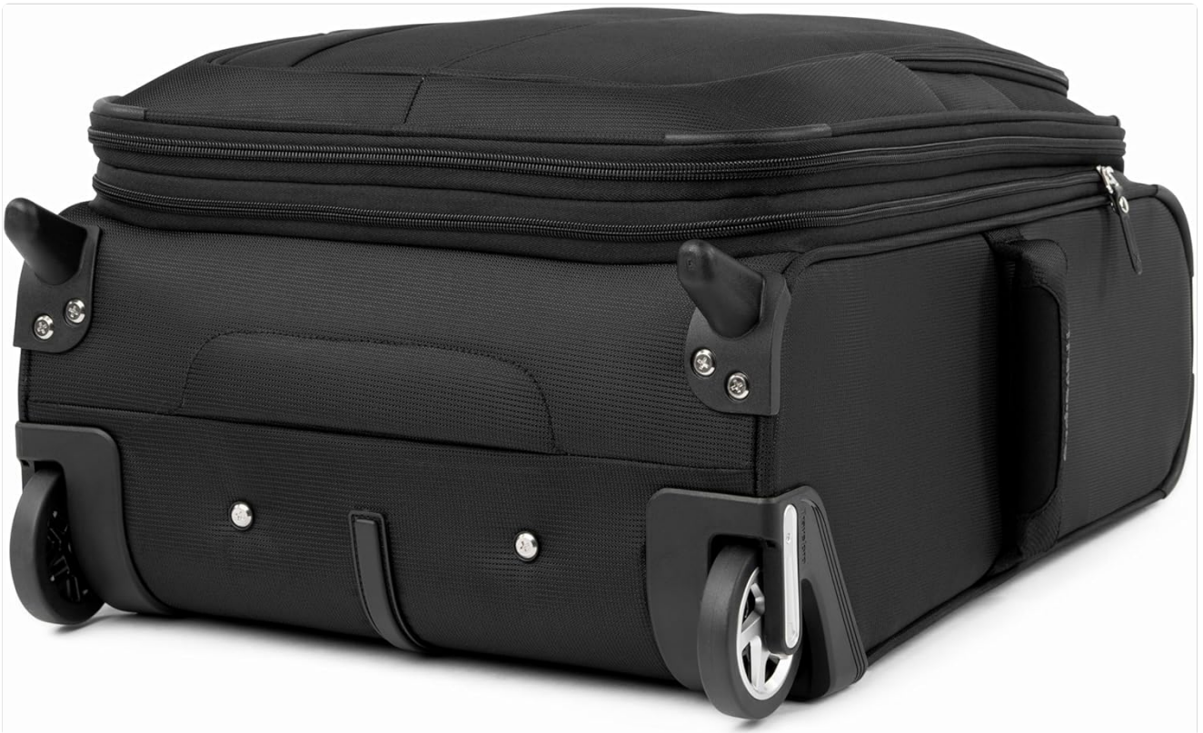
Figure 4.1: Bottom view of the luggage, showing the durable inline skate wheels and protective feet.

Use the padded top, side, or bottom handles to lift and carry the luggage. These handles provide comfortable grip and make it easy to maneuver the bag into overhead compartments, car trunks, or onto luggage racks.