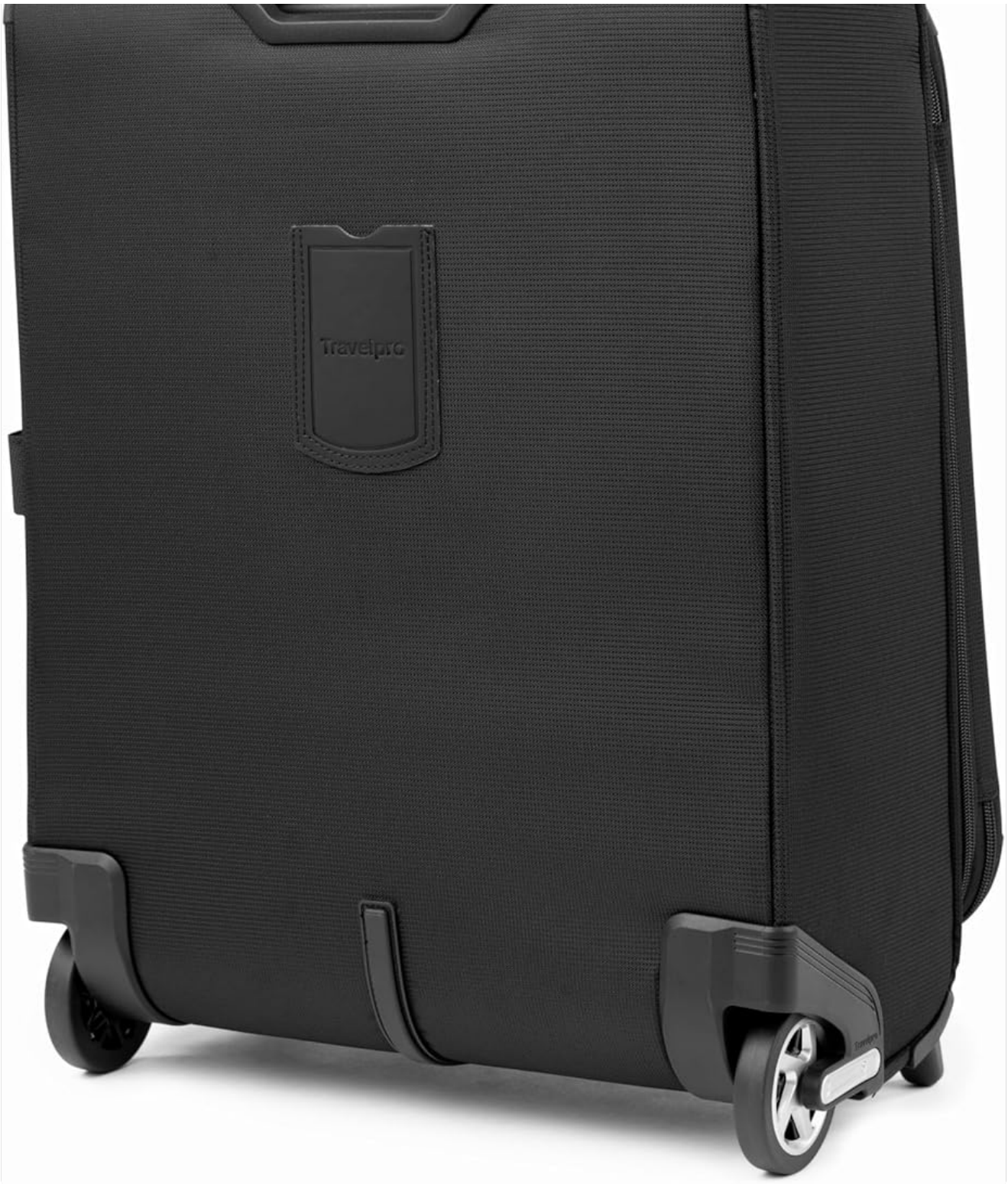
Figure 4.2: Back view of the luggage, illustrating the PowerScope Lite handle in its extended position.