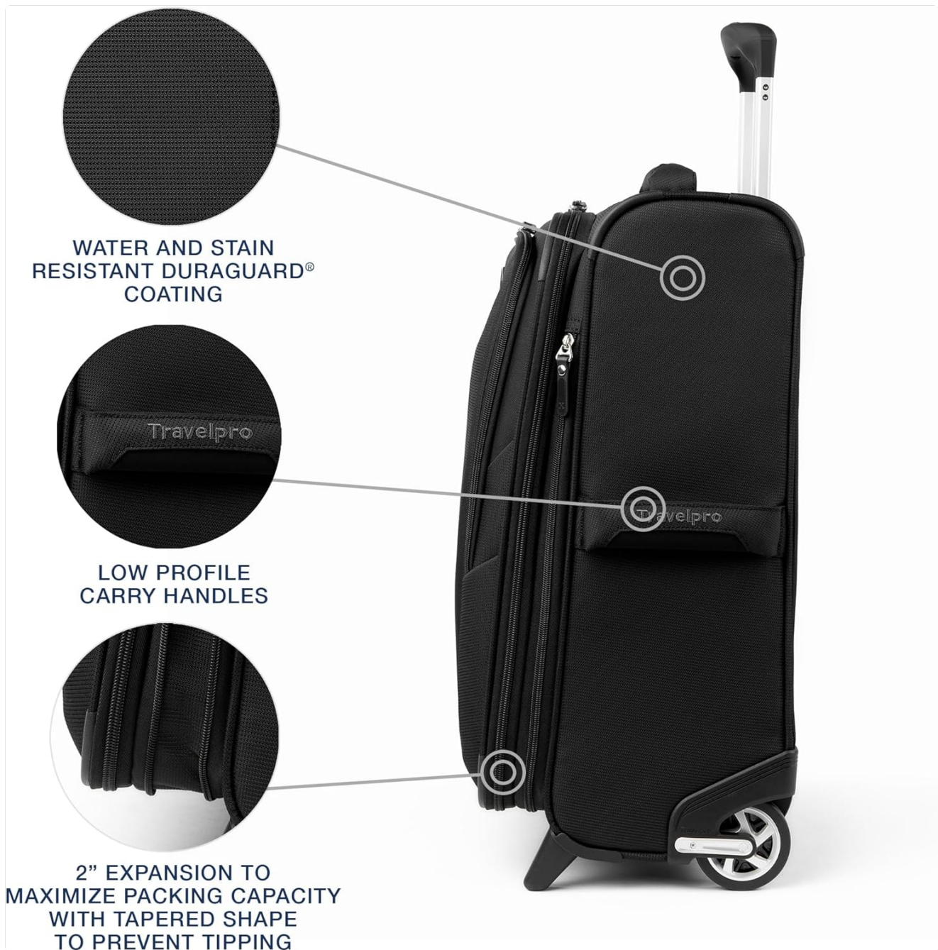
Figure 2.2: Side view highlighting the water and stain resistant DuraGuard coating, low profile carry handles, and the 2-inch expansion zipper.