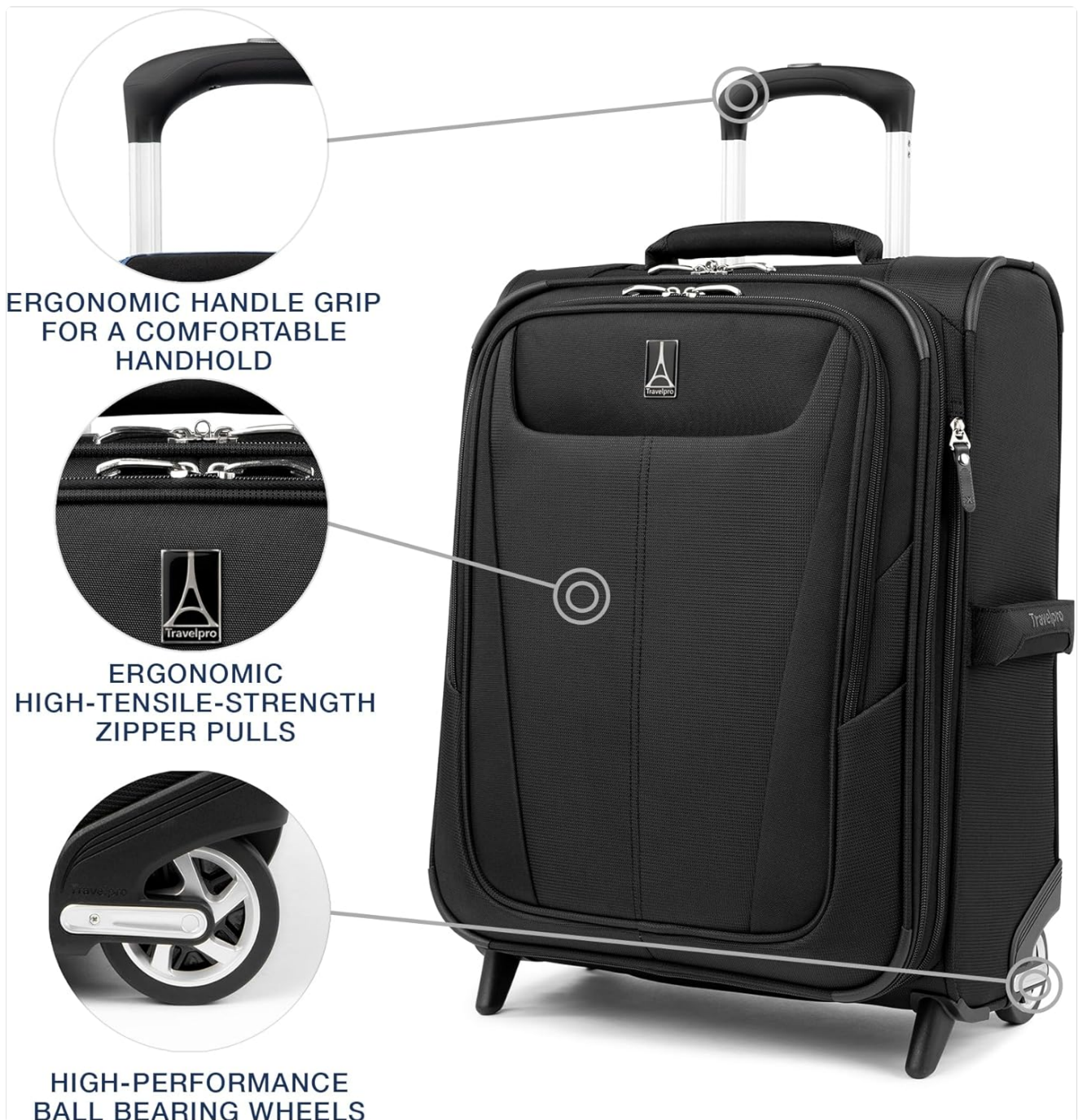
Figure 2.1: Ergonomic handle grip, high-tensile-strength zipper pulls, and high-performance ball bearing wheels for smooth operation.