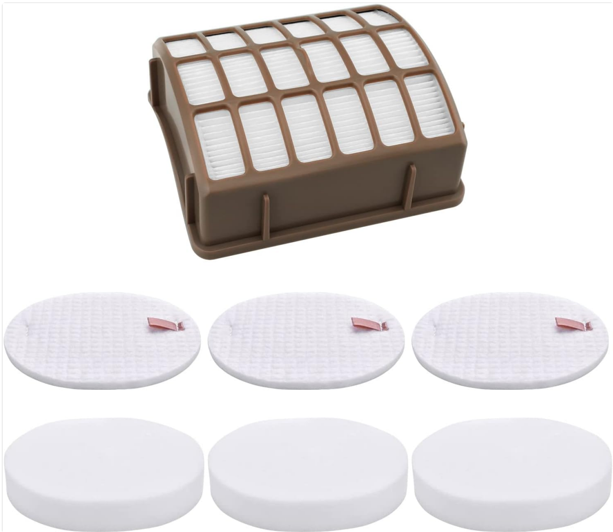
This image displays the complete set of Artraise replacement filters: one HEPA filter, three felt filters, and three foam filters.