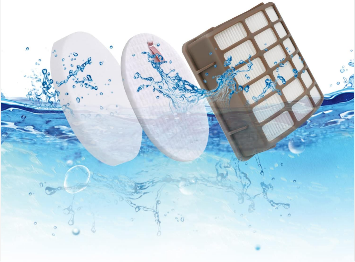
This image demonstrates the process of washing the reusable foam and felt filters.