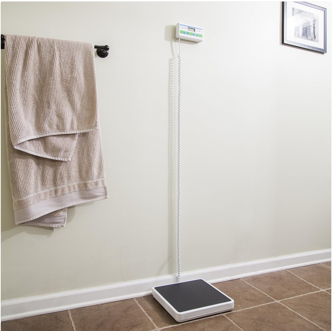
Image: The Patient Aid PA-550XL Digital Floor Scale with its display unit mounted on a wall, connected by a coiled cable to the floor platform.