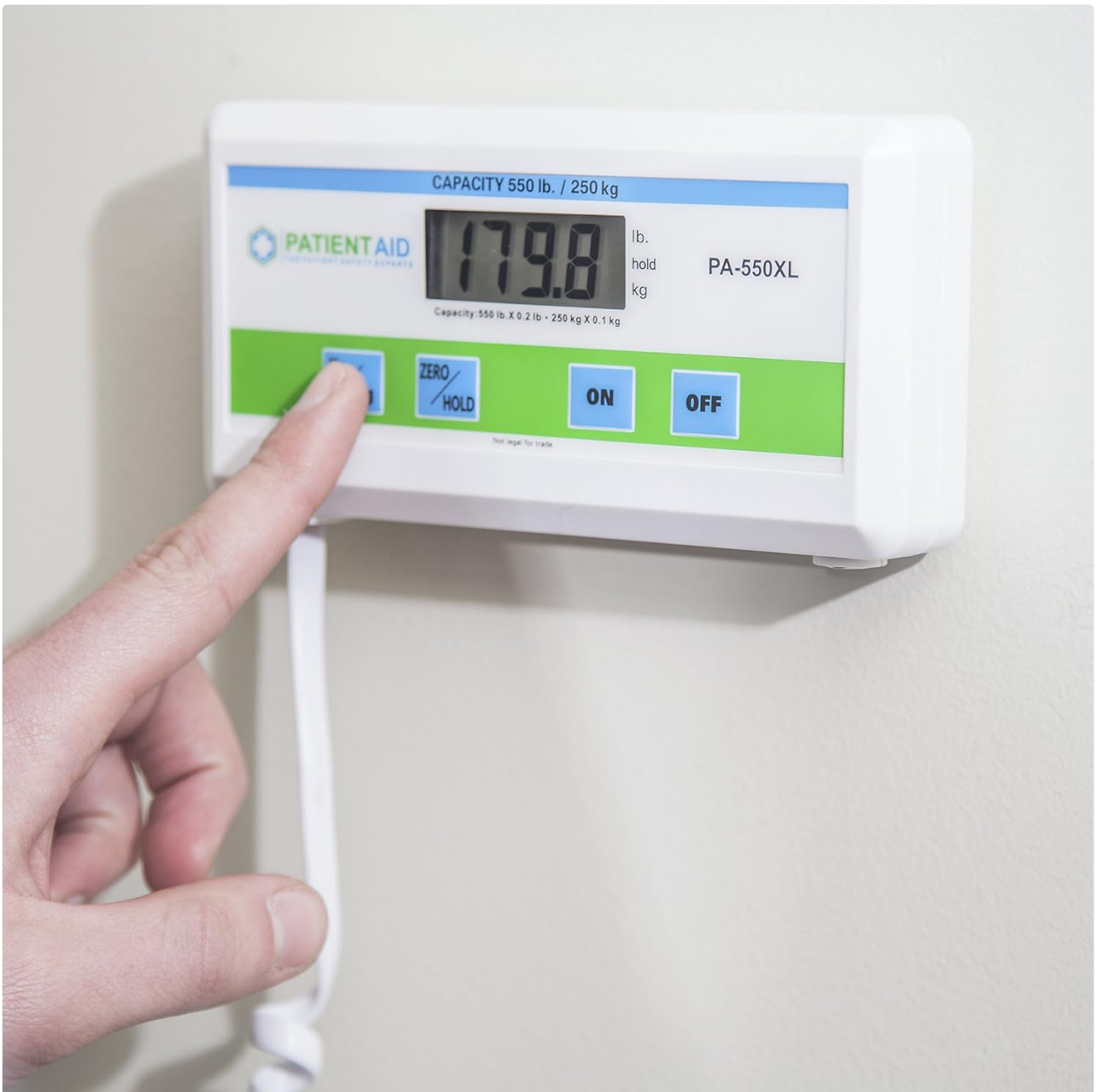
Image: A close-up of the Patient Aid PA-550XL Digital Floor Scale display unit, showing a finger pressing the 'ZERO/HOLD' button.