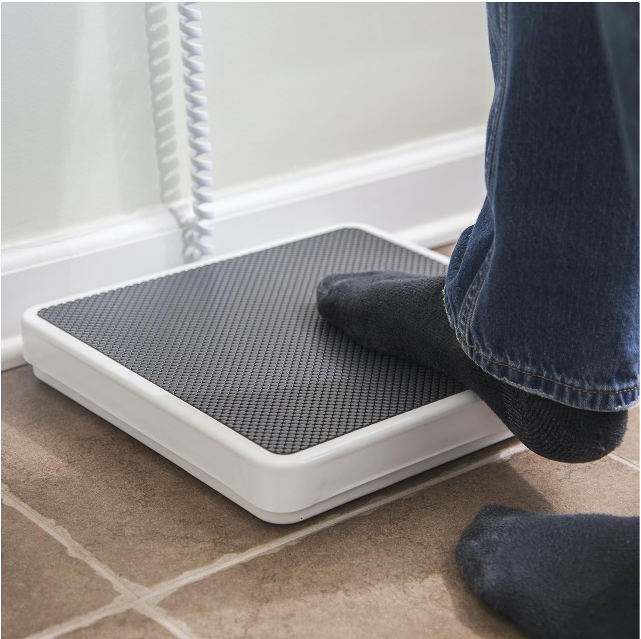
Image: A person's foot stepping onto the textured, anti-slip surface of the Patient Aid PA-550XL Digital Floor Scale platform.