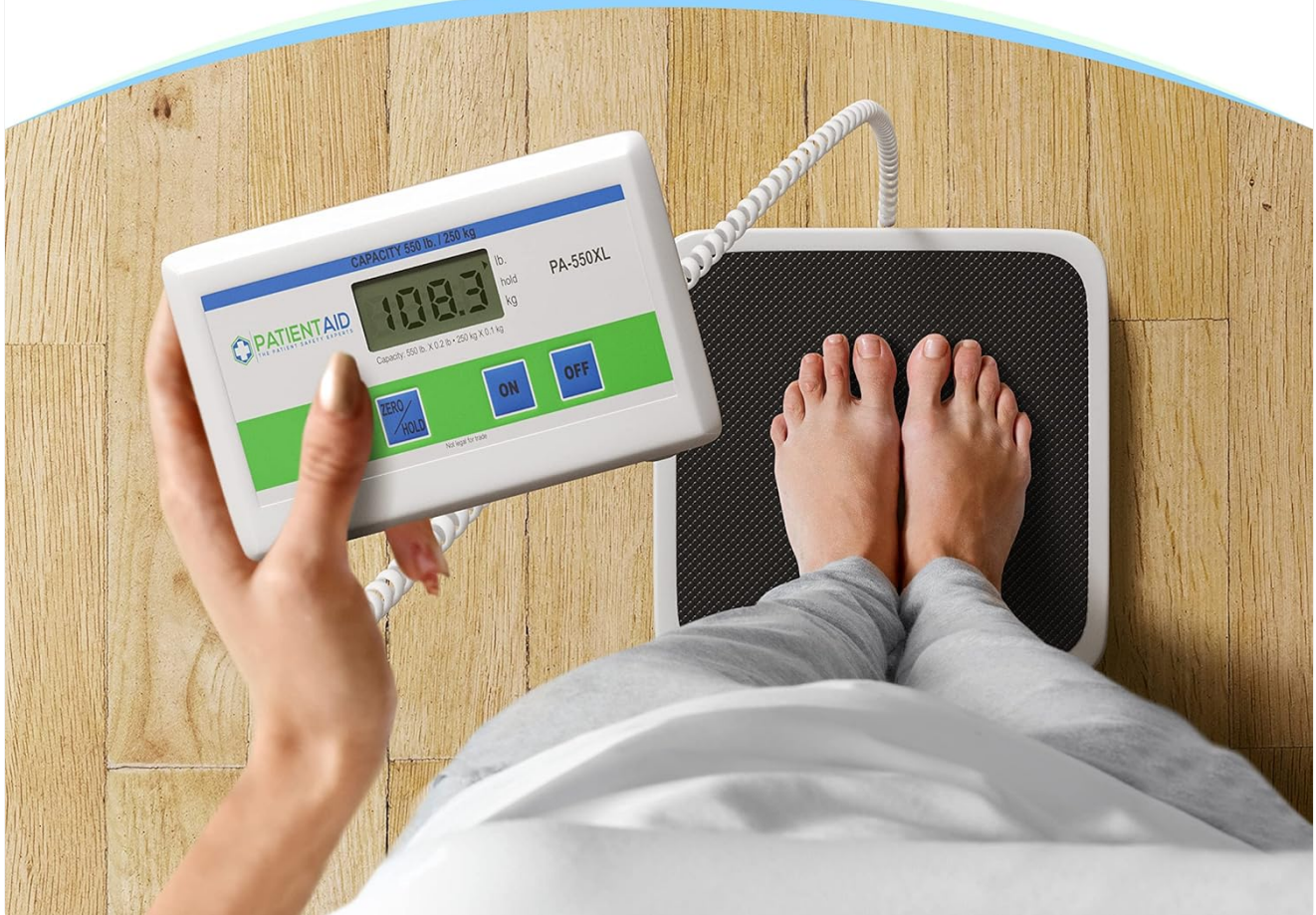
Image: The Patient Aid PA-550XL Digital Floor Scale, showing the main platform and the remote digital display unit held in hand, with feet positioned on the scale platform.