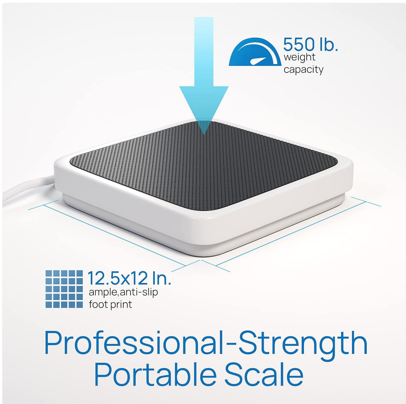
Image: The Patient Aid PA-550XL scale platform, highlighting its 12.5 x 12 inch ample, anti-slip footprint and 550 lb weight capacity.