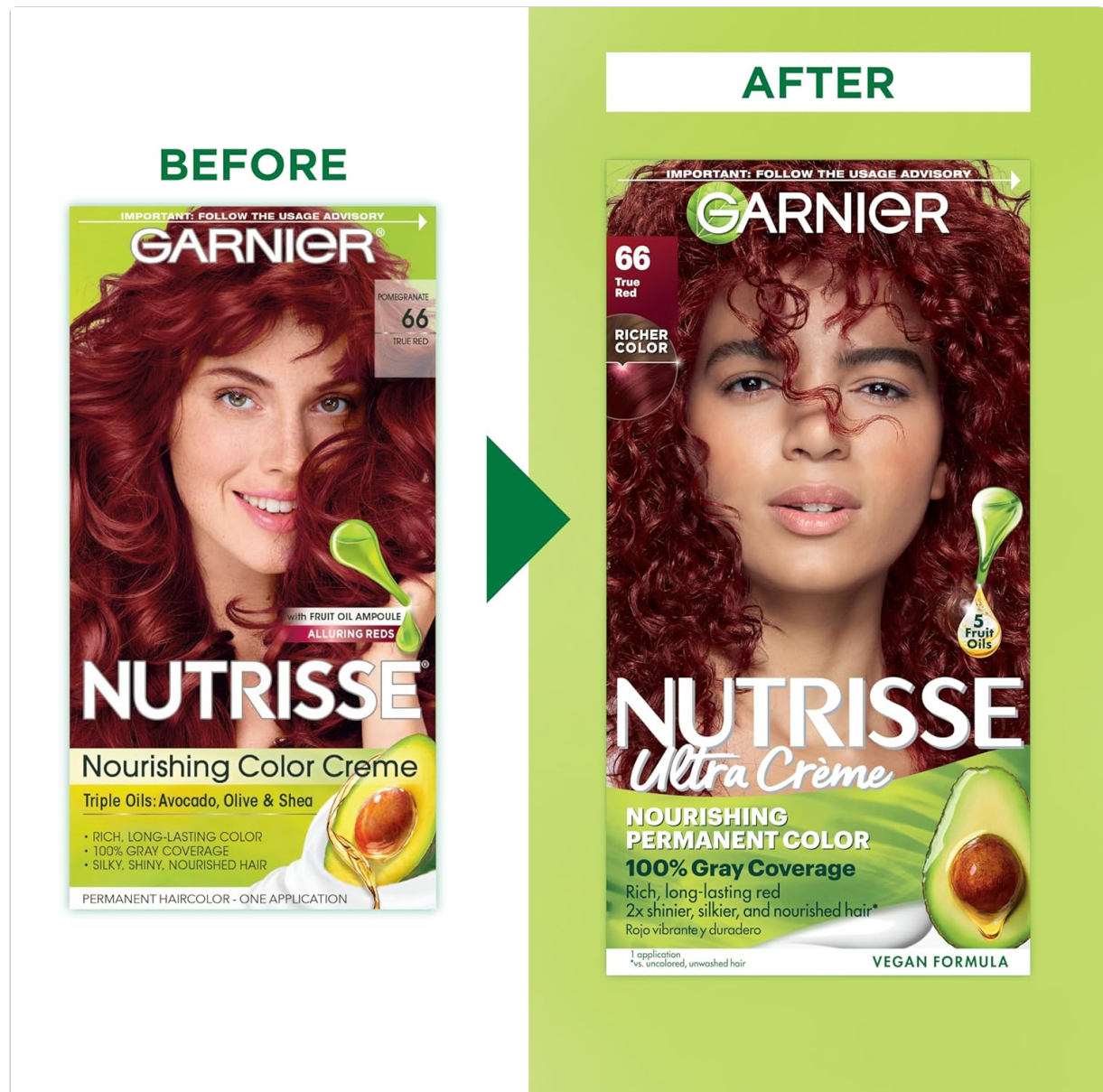
Image: Before and after coloring with Garnier Nutrisse 66 True Red.