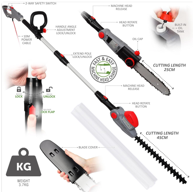
Figure 2: Detailed view of the tool's components, including the 2-way safety switch, 10m power cable, extendable pole, machine head release, head rotate button, oil tank (for chainsaw), and blade cover.