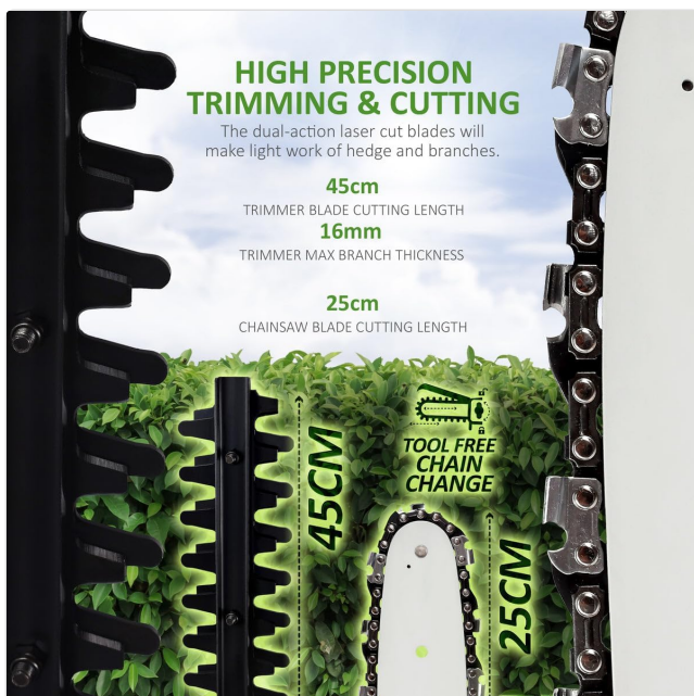
Figure 6: Shows the 45cm trimmer blade cutting length and 16mm maximum branch thickness for the hedge trimmer.