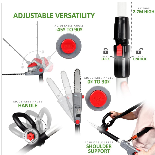
Figure 4: Details the extension pole mechanism, showing the quick lock and unlock functions for adjusting the tool's length.