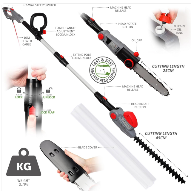
Figure 3: Illustrates the "Machine Head Release" button and the process of attaching either the hedge trimmer or chainsaw head.