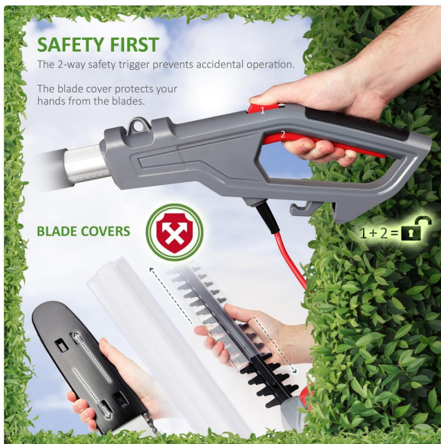
Figure 5: Illustrates the 2-way safety trigger (1+2) which must be pressed simultaneously to operate the tool, preventing accidental starts.