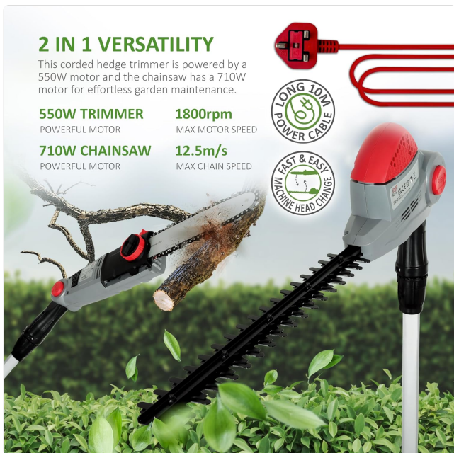
Figure 1: The NETTA 2-in-1 tool, illustrating its hedge trimmer and chainsaw attachments, along with the 10m power cable and quick head change mechanism.