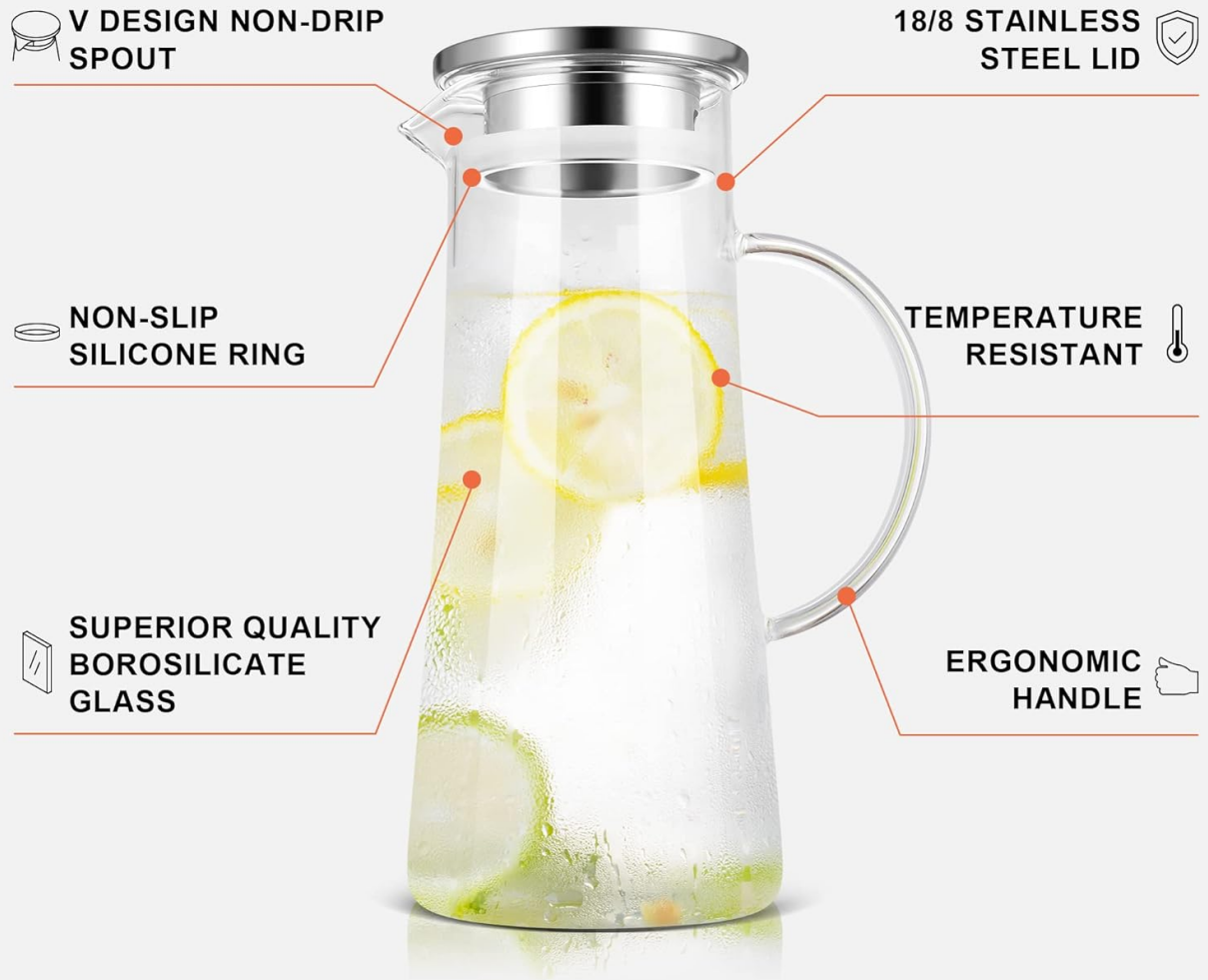
Image: An exploded view of the pitcher, detailing its V-design non-drip spout, non-slip silicone ring, superior quality borosilicate glass, temperature resistance, and ergonomic handle.