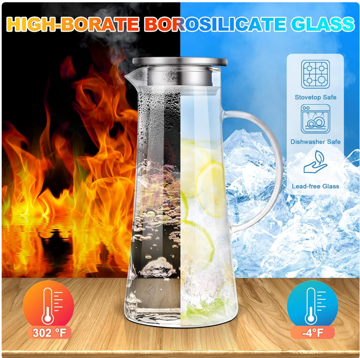
Image: The pitcher's borosilicate glass construction allows it to safely handle both hot and cold liquids, from 302°F to -4°F.