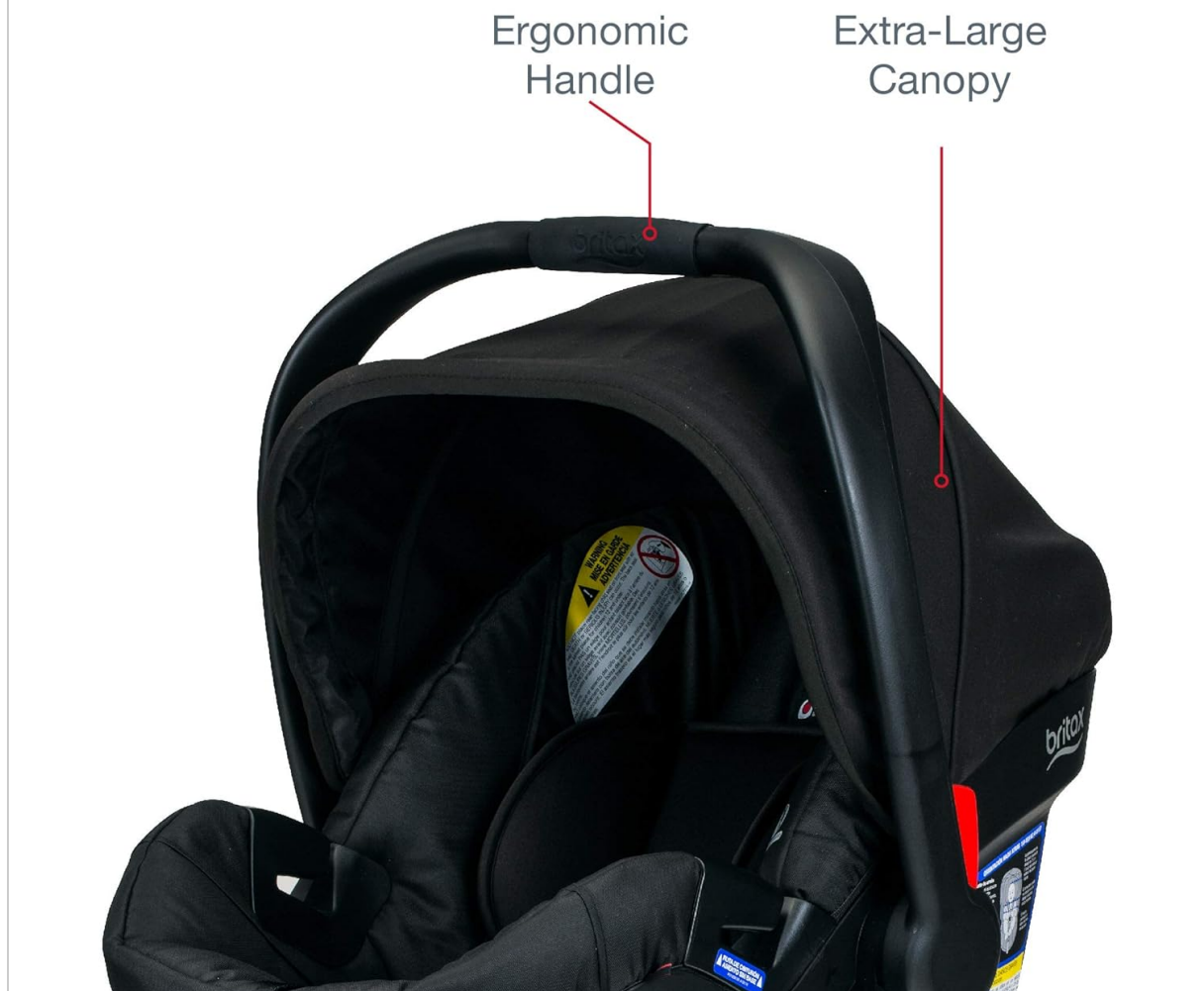
Image: Top view of the car seat showing the ergonomic handle and extra-large canopy.