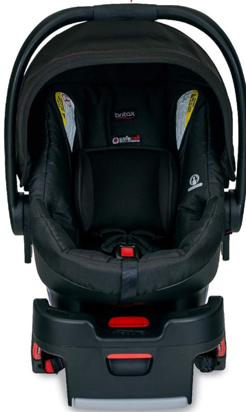
Image: The BRITAX B-Safe 35 Infant Car Seat, designed for rear-facing use for infants weighing 4 to 35 pounds.