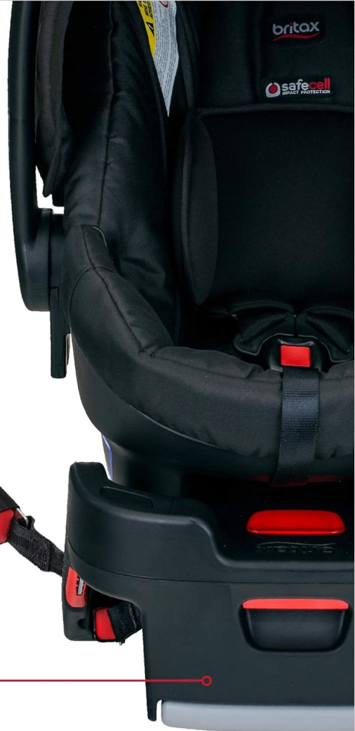
Image: Close-up view of the car seat base showing the SafeCenter LATCH system and steel frame.