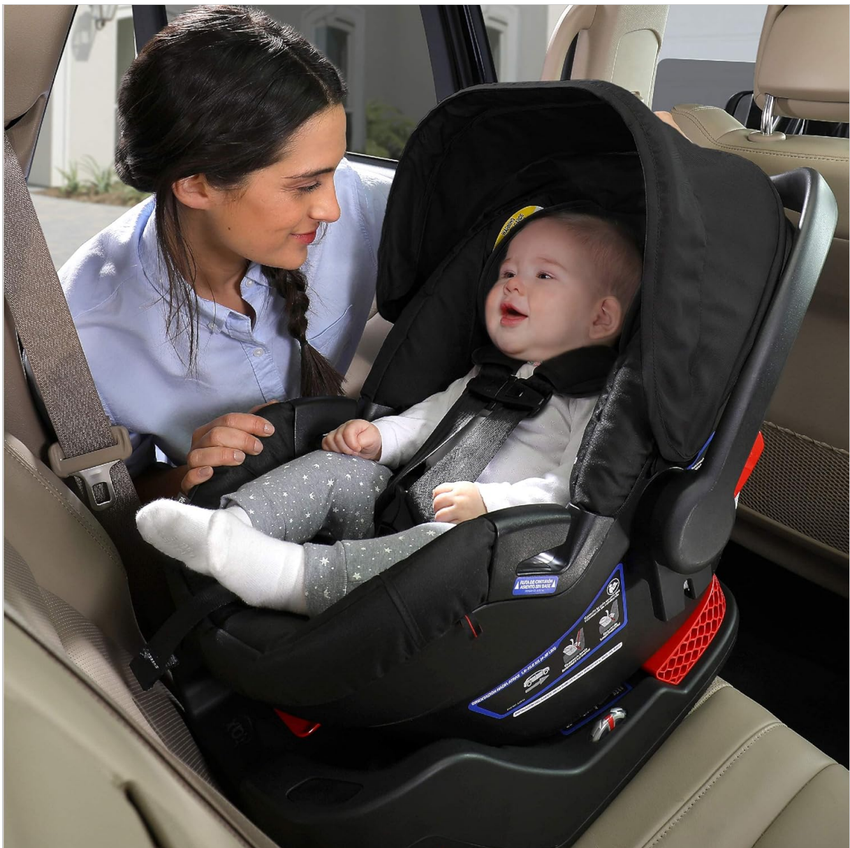
Image: An infant correctly secured in the BRITAX B-Safe 35 Infant Car Seat.

Always place your child rear-facing in the car seat. Ensure the 5-point harness straps are snug against your child's body, with the chest clip positioned at armpit level. The harness straps should be at or below your child's shoulders when rear-facing. The removable infant head pad provides additional support for smaller infants.