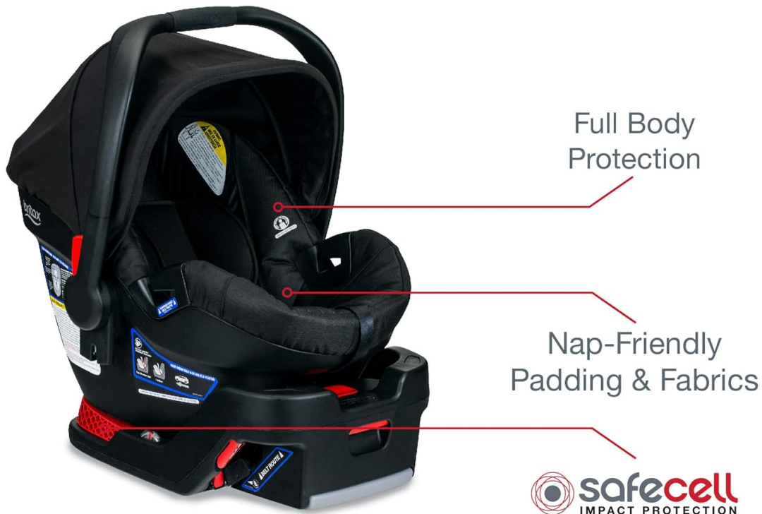
Image: Side view of the car seat highlighting full body protection, nap-friendly padding, and SafeCell Impact Protection.