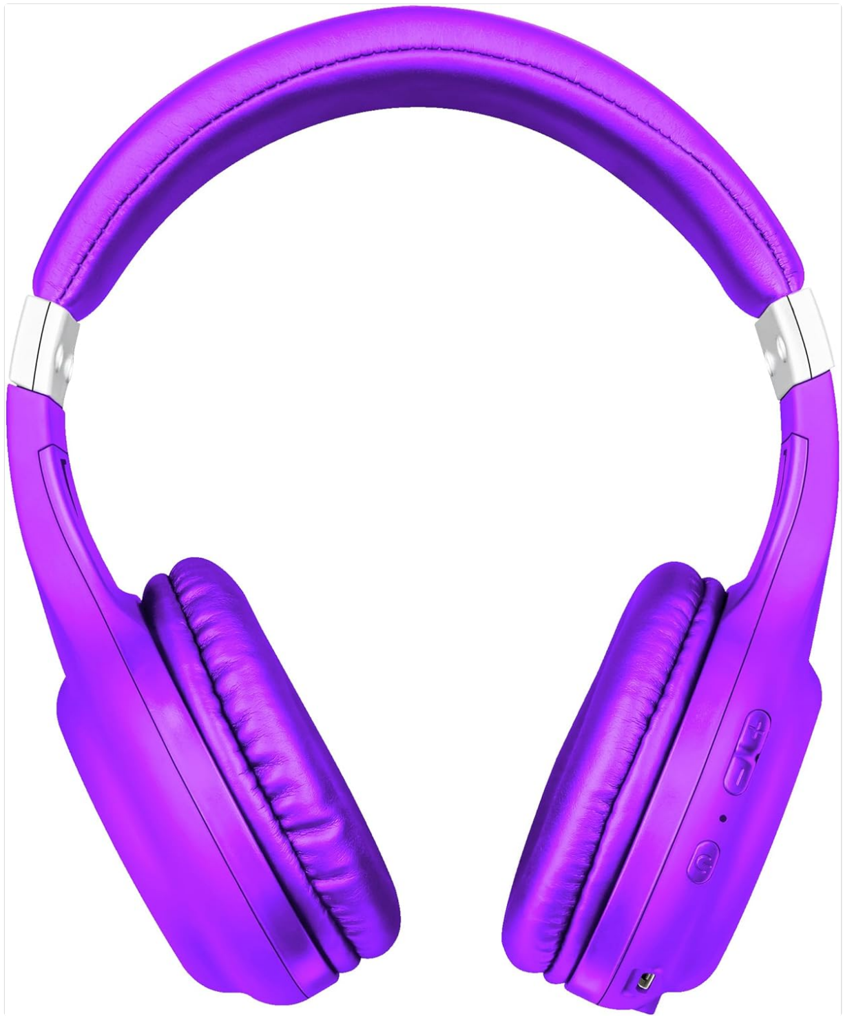
Image: Front view of the Trust Urban Bluetooth Wireless Headphones in purple.