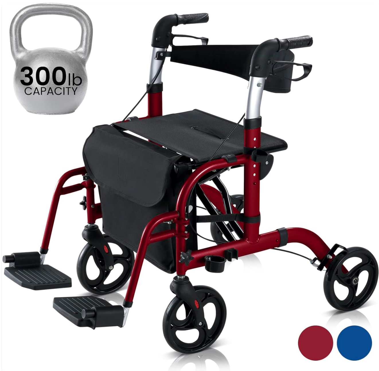
Image: The Vive Mobility 2 in 1 Walker Wheelchair Combo in Ruby Red, showcasing its dual functionality and 300lb capacity.