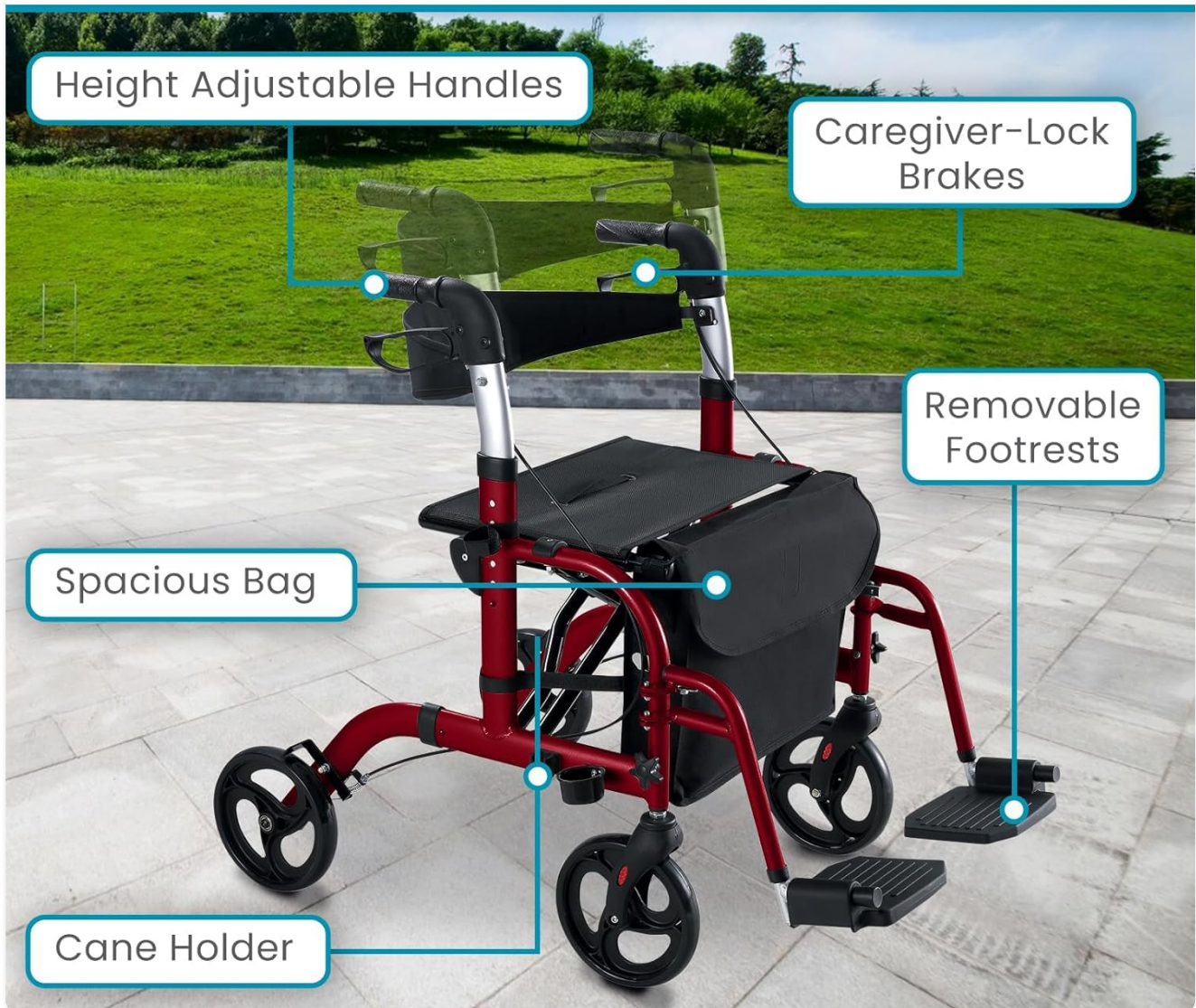
Image: A detailed diagram illustrating the various features of the combo unit, including adjustable handles, removable footrests, spacious bag, and cane holder.