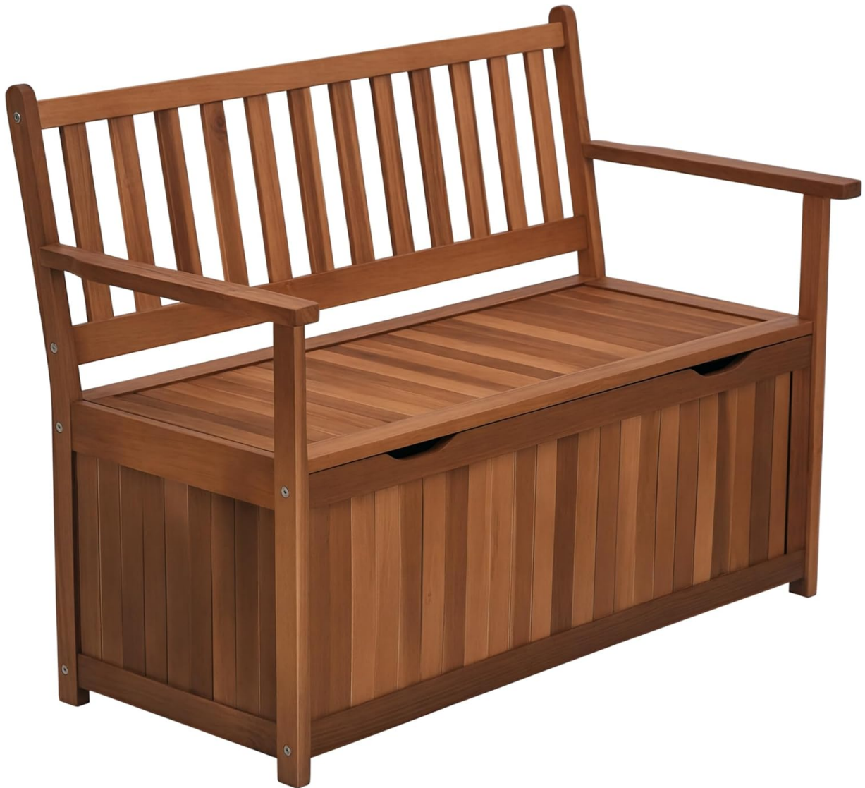
Image: The Outsunny 41 Gallon Outdoor Storage Bench, showcasing its teak finish and dual functionality as a bench and storage unit.