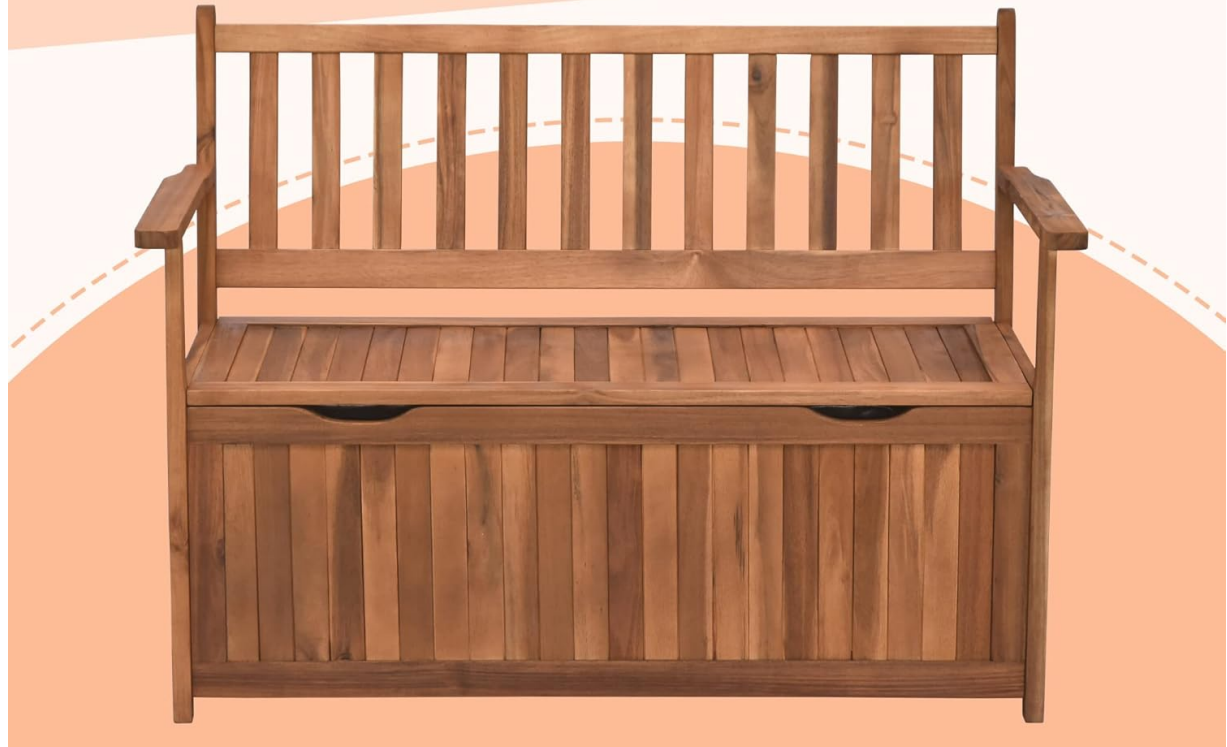
Image: The removable waterproof PE lining, designed to keep stored items dry and protected.