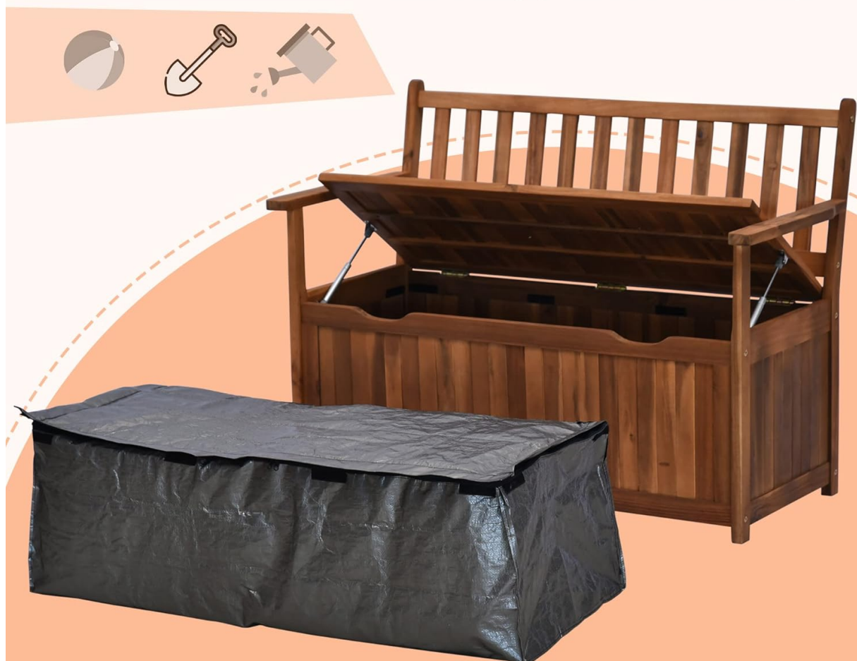
Image: Detail of the safety pneumatic rod, which prevents the lid from slamming shut. Proper installation is crucial for its function.

The removable storage bag is perfect for storing garden tools and toys.