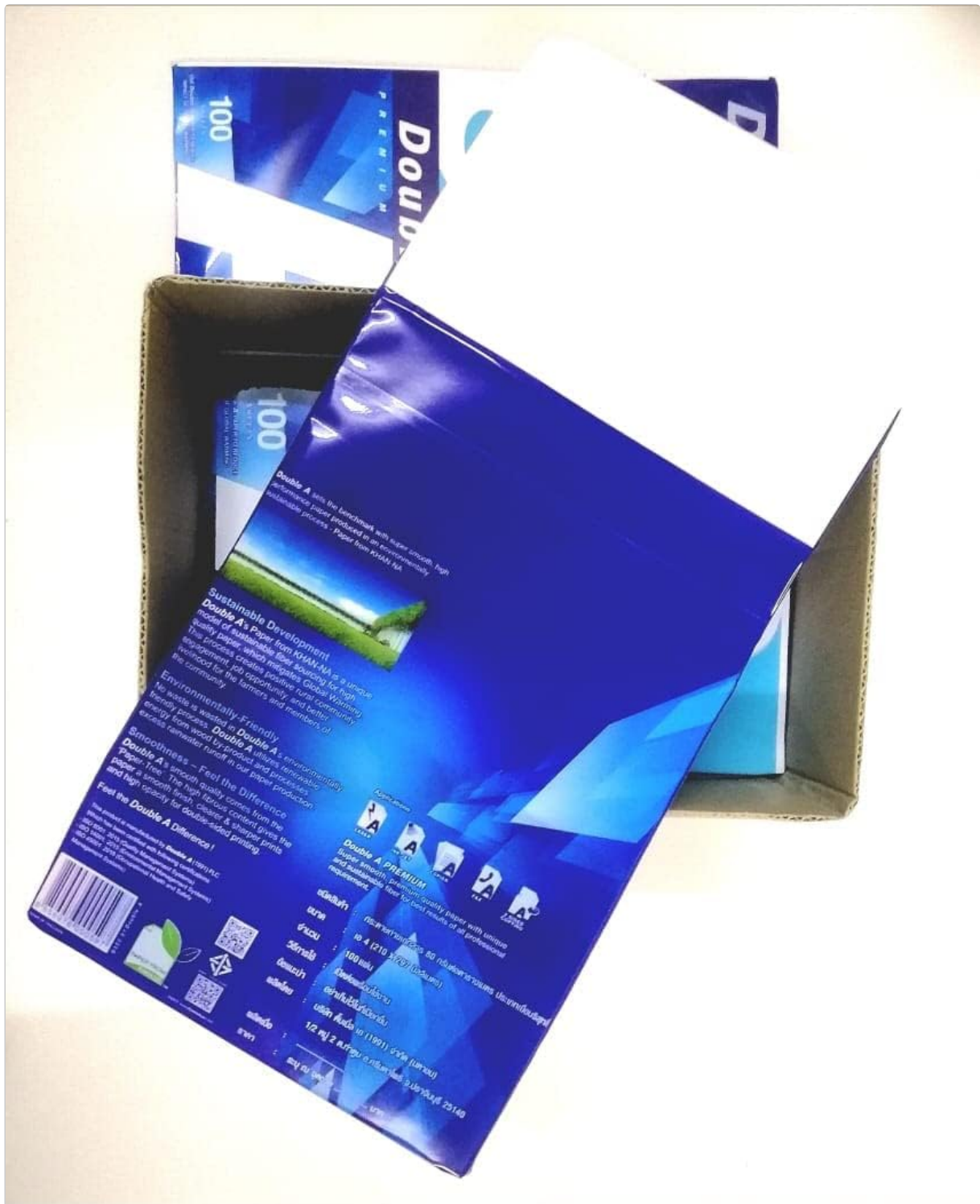
Image 3.1: A single ream of Double A A4 Premium Printer Paper, showing the packaging details and the paper's white surface.