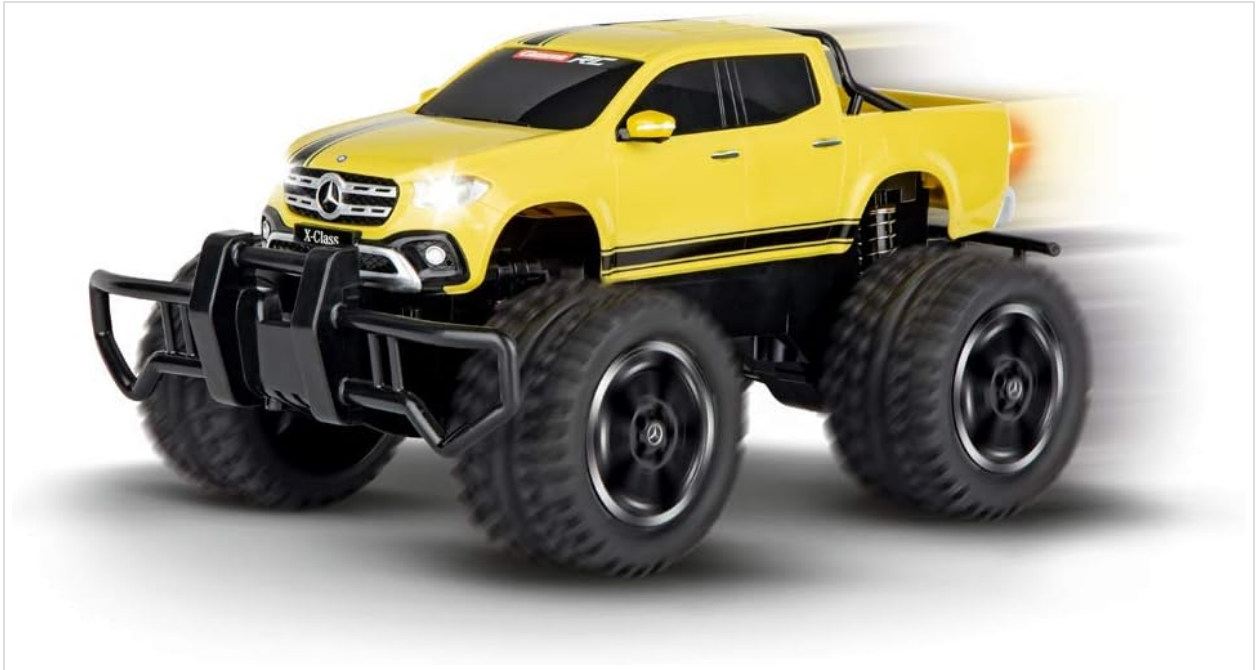
Image: The Carrera R/C Mercedes X Class 1:16 Toy Car in motion, demonstrating its speed and maneuverability with blurred background elements.