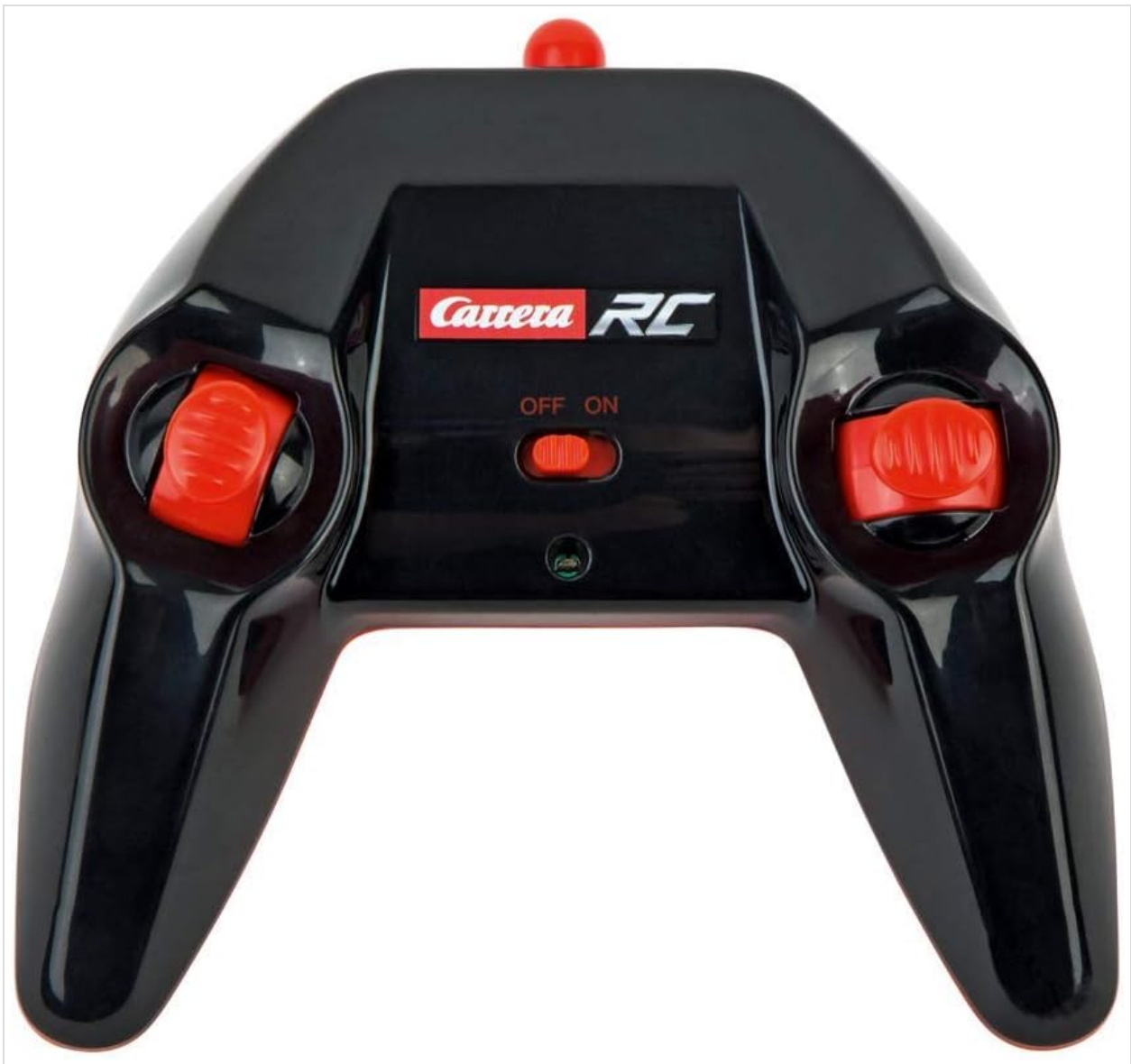
Image: The black remote control unit for the Carrera R/C car, featuring red joysticks for control and an 'OFF ON' switch.