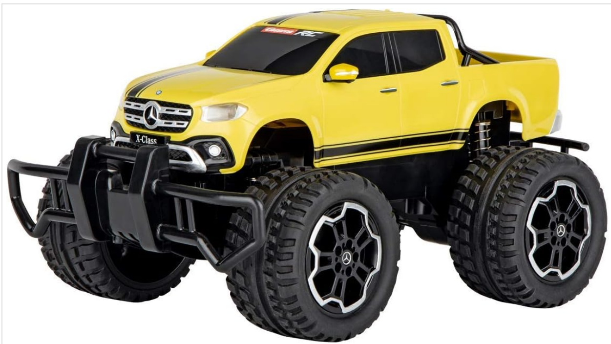
Image: The Carrera R/C Mercedes X Class 1:16 Toy Car, a yellow remote-controlled pickup truck with large wheels and a robust front bumper.