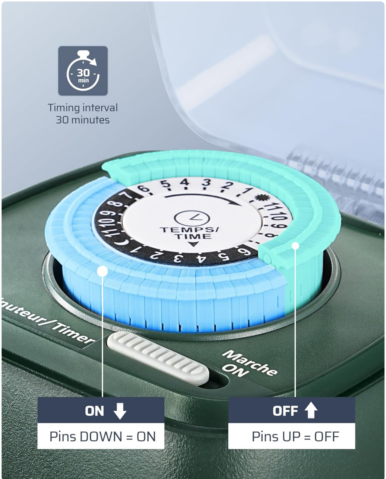
Image: A detailed view of the mechanical timer dial, showing the individual pins for setting 30-minute ON/OFF intervals.