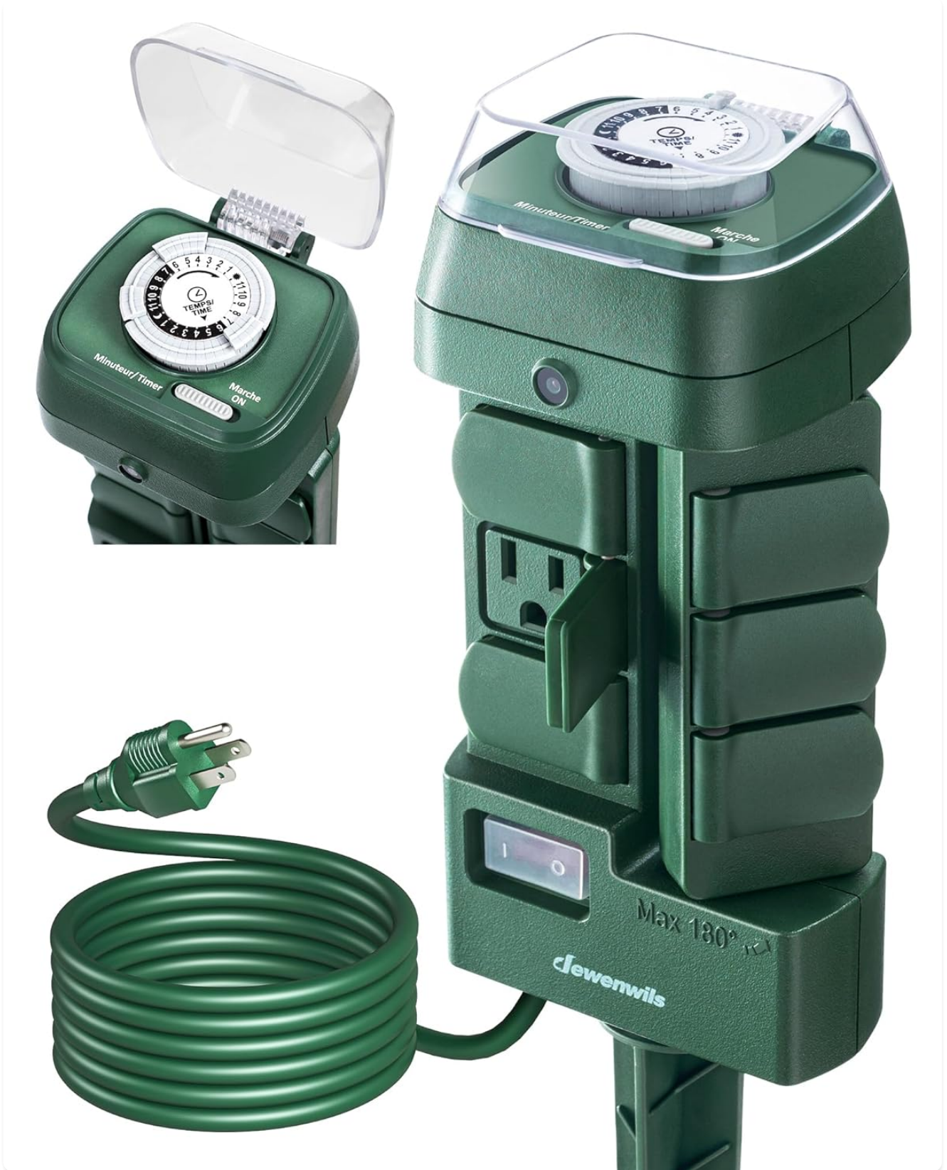
Image: The DEWENWILS power stake timer with its two-section ground stake fully assembled, ready for outdoor placement.