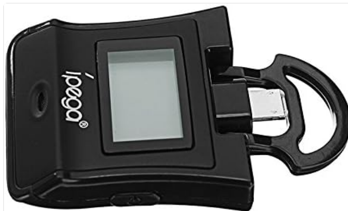
Figure 2: Angled view of the ipega PG-9070 tester showing the extended connector, ready to be plugged into a smartphone. The device is compact and designed for portability.