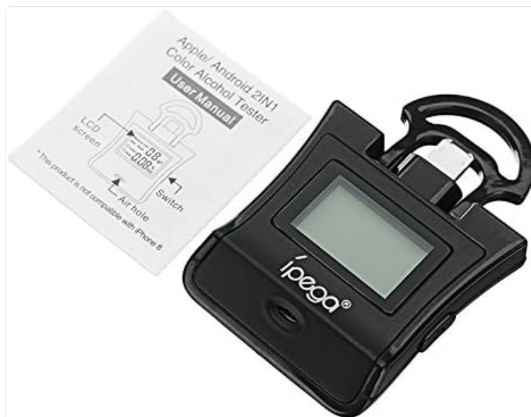
Figure 3: The ipega PG-9070 tester alongside its user manual, highlighting the air hole where breath samples are provided and the LCD screen for displaying results.