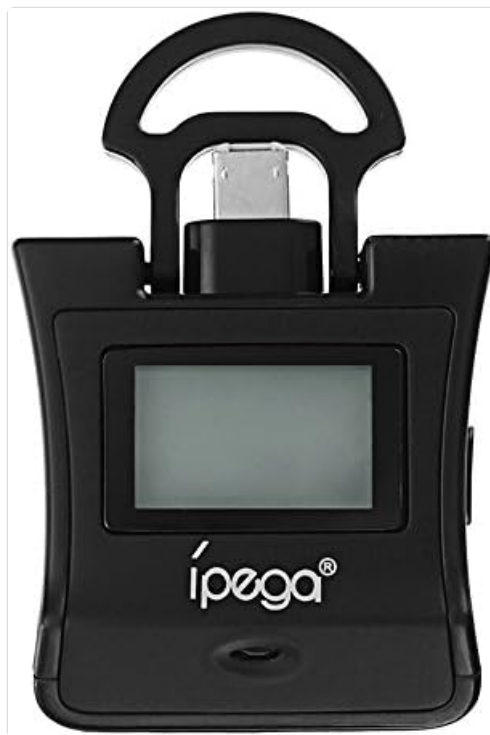
Figure 1: Front view of the ipega PG-9070 Key Ring Breath Alcohol Tester. The device is black with a small LCD screen and the 'ipega' logo. A key ring attachment is visible at the top, which also houses the device connector.

Thank you for choosing the ipega PG-9070 Key Ring Breath Alcohol Tester. This compact and portable device is designed to accurately measure breath alcohol content (BAC) using advanced gas detection technology. It is compatible with both Apple iOS and Android devices (Android devices require OTG function support). This manual provides detailed instructions for safe and effective use of your new alcohol tester.