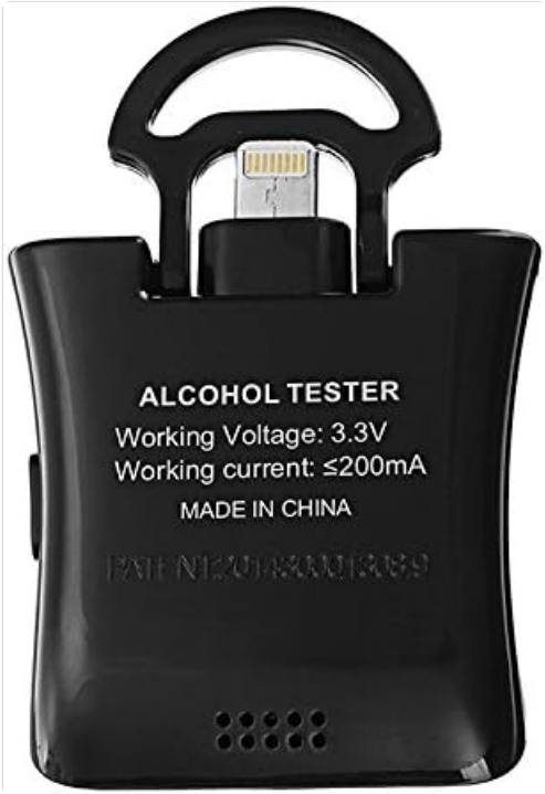
Figure 4: Back view of the ipega PG-9070 tester, displaying its working voltage and current specifications.