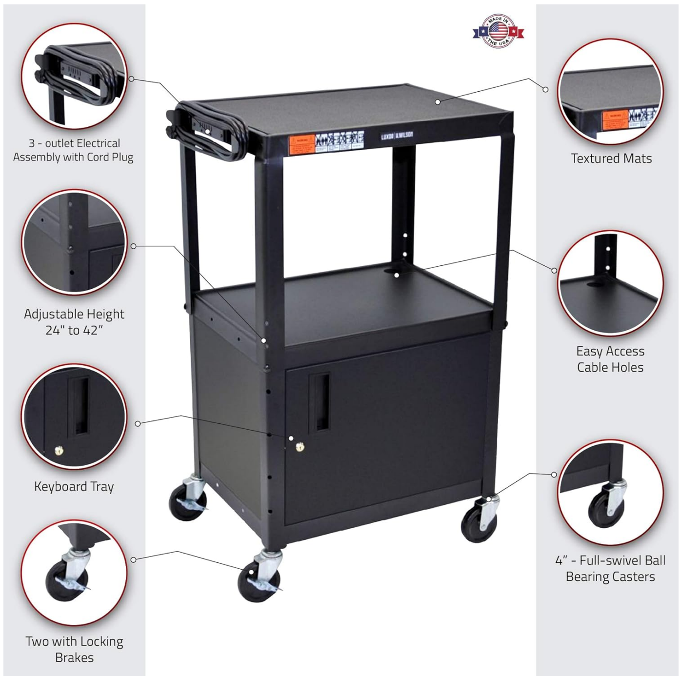
Figure 3: Detailed view of the cart's features, including adjustable height, casters, and electrical assembly.