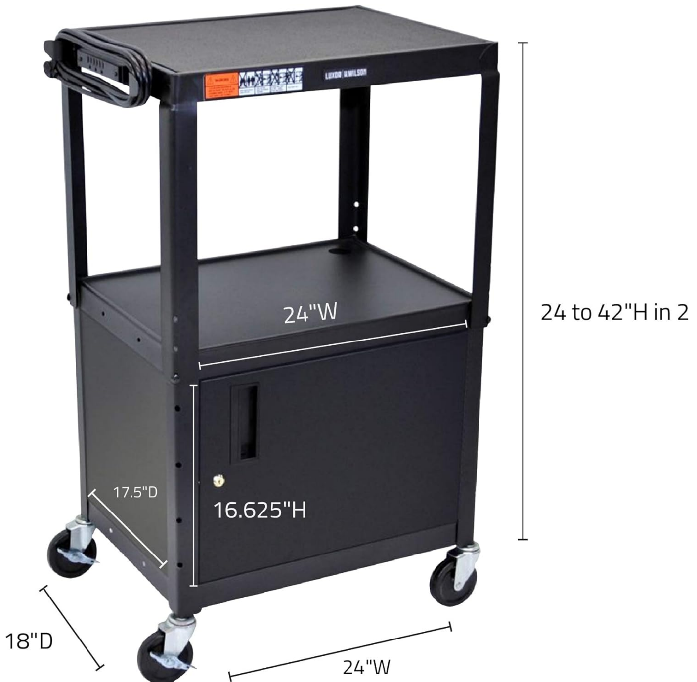
Figure 4: Key dimensions of the Luxor A/V Utility Cart.