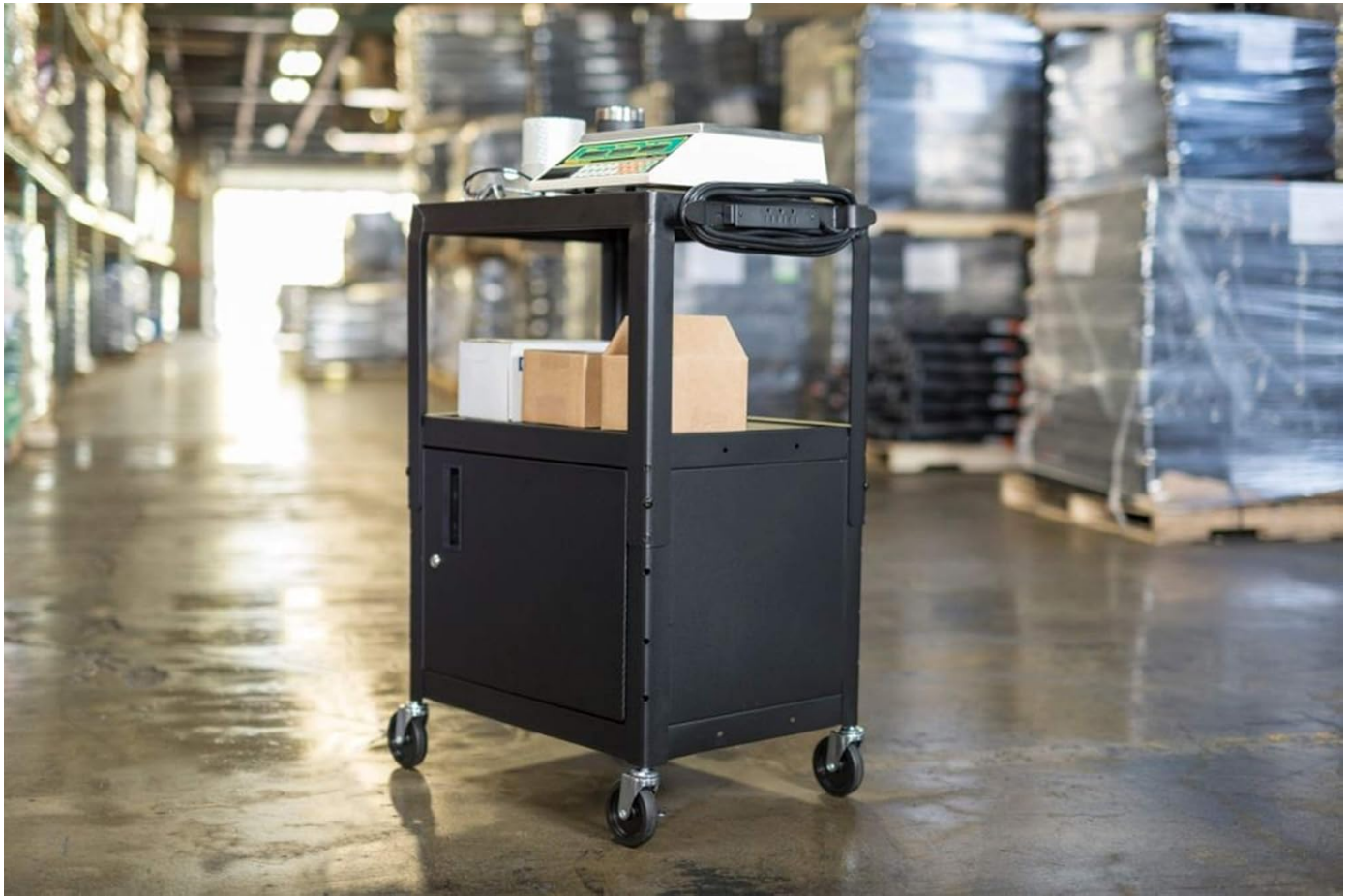
Figure 2: The utility cart in a typical operational environment.