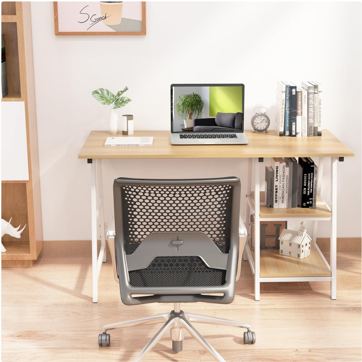
Image 5.1: soges 47 Inch Computer Desk in a typical home office setup.