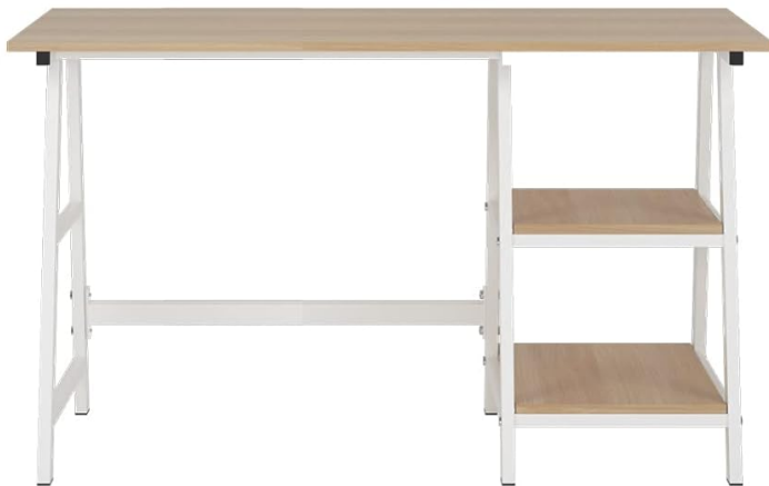
Image 4.1: Illustration demonstrating reversible shelf installation options.