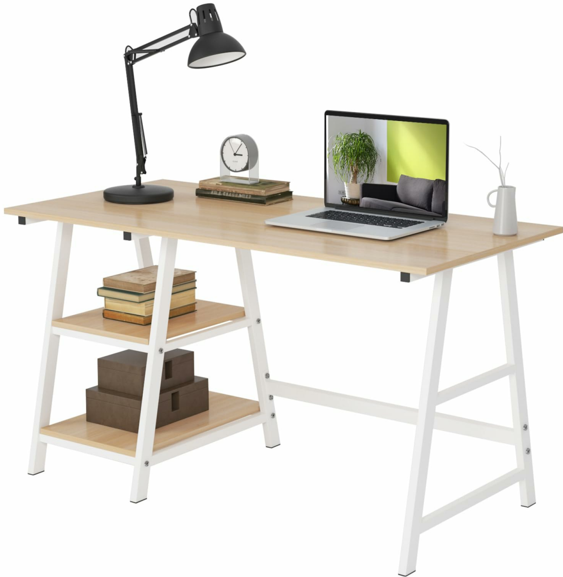
Image 1.1: soges 47 Inch Computer Desk in White Oak with Trestle Base and Side Shelves.