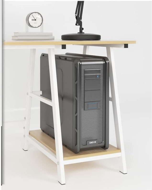
Image 4.2: Detail of the two-tier open shelves, including space for a computer tower.

2-tier open shelves provide enough storage. And the removable shelf for a computer tower.