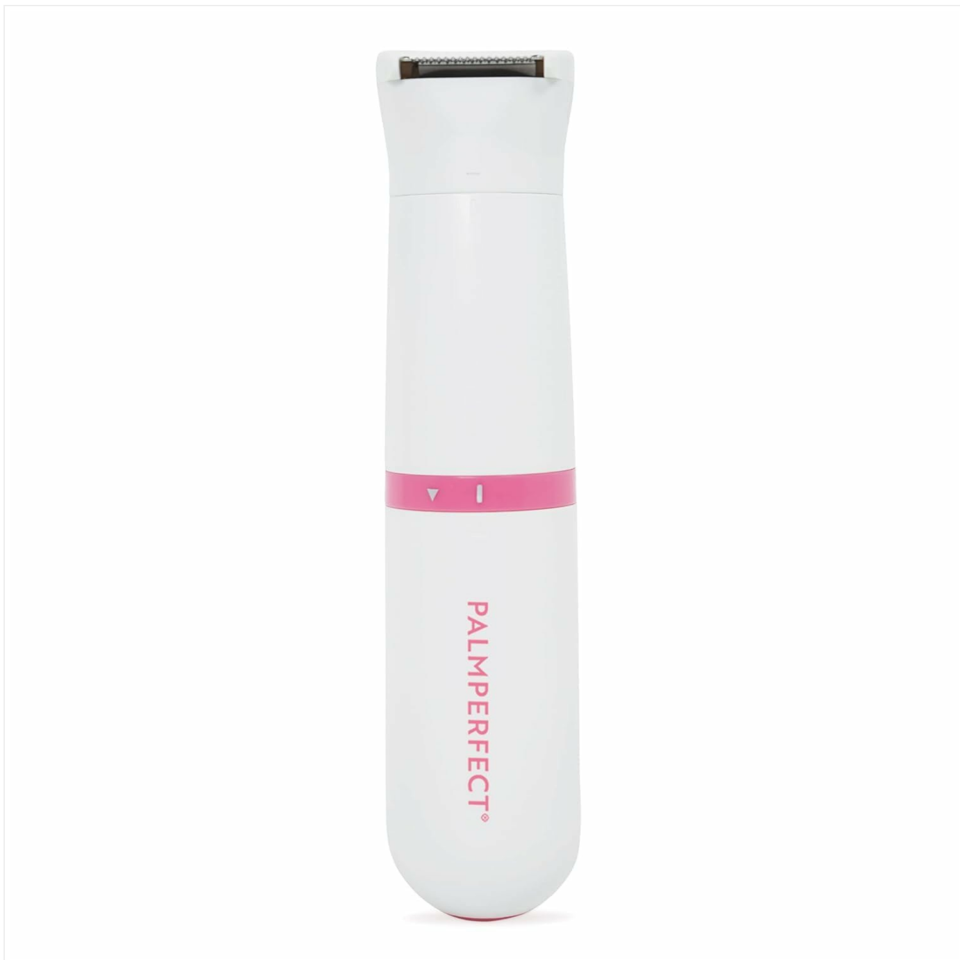
Figure 1: PALMPERFECT Electric Bikini Trimmer