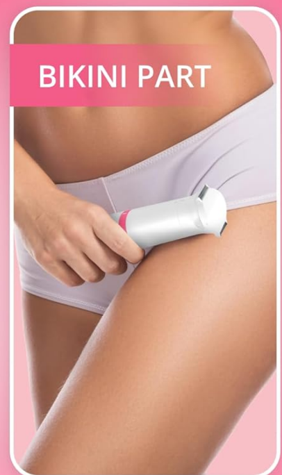
Figure 4: The ergonomic design facilitates use on various body parts including legs, armpits, and the bikini area.