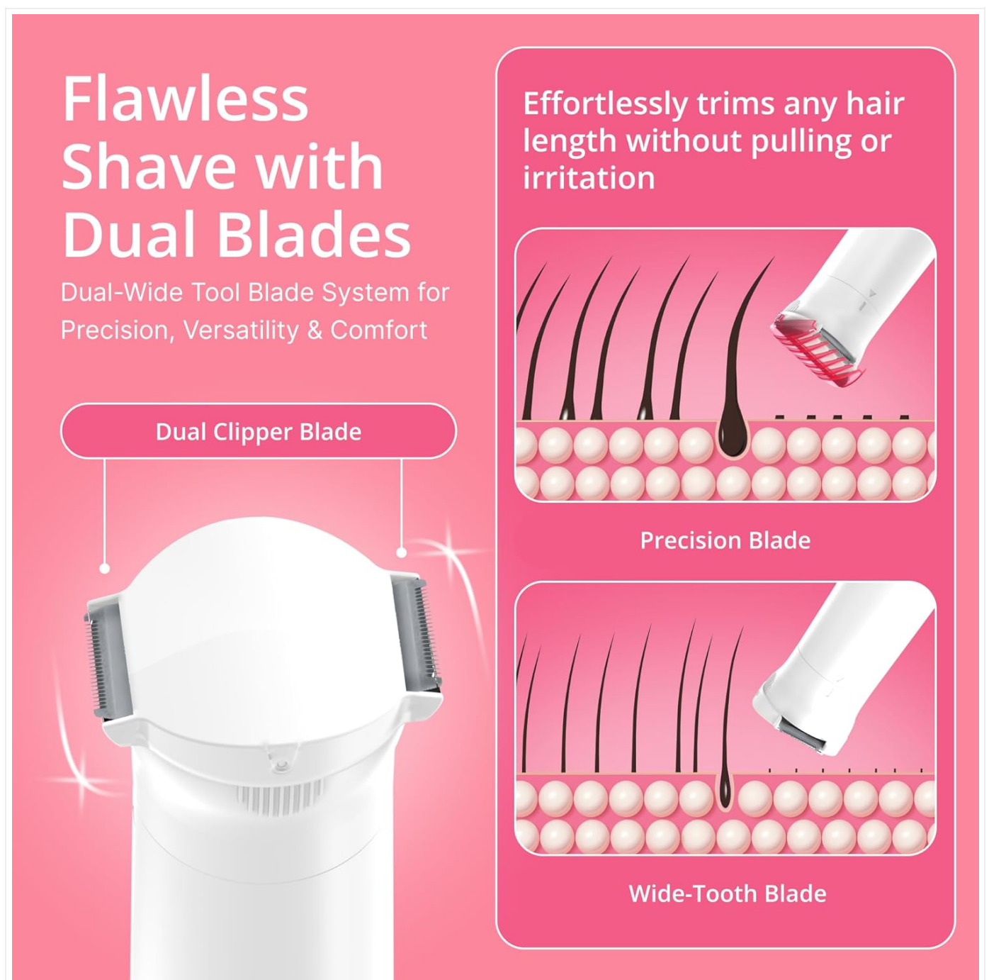
Figure 2: Illustration of the dual clipper blade and precision blade.

The trimming guide can be attached to adjust the hair length. Align the guide with the trimmer head and gently push until it clicks into place. To remove, gently pull the guide away from the trimmer head.