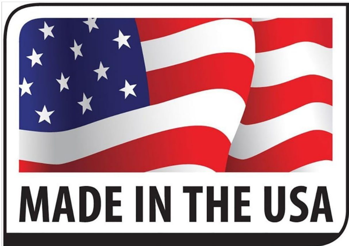
Figure 2: Indication of product origin, highlighting manufacturing in the USA.