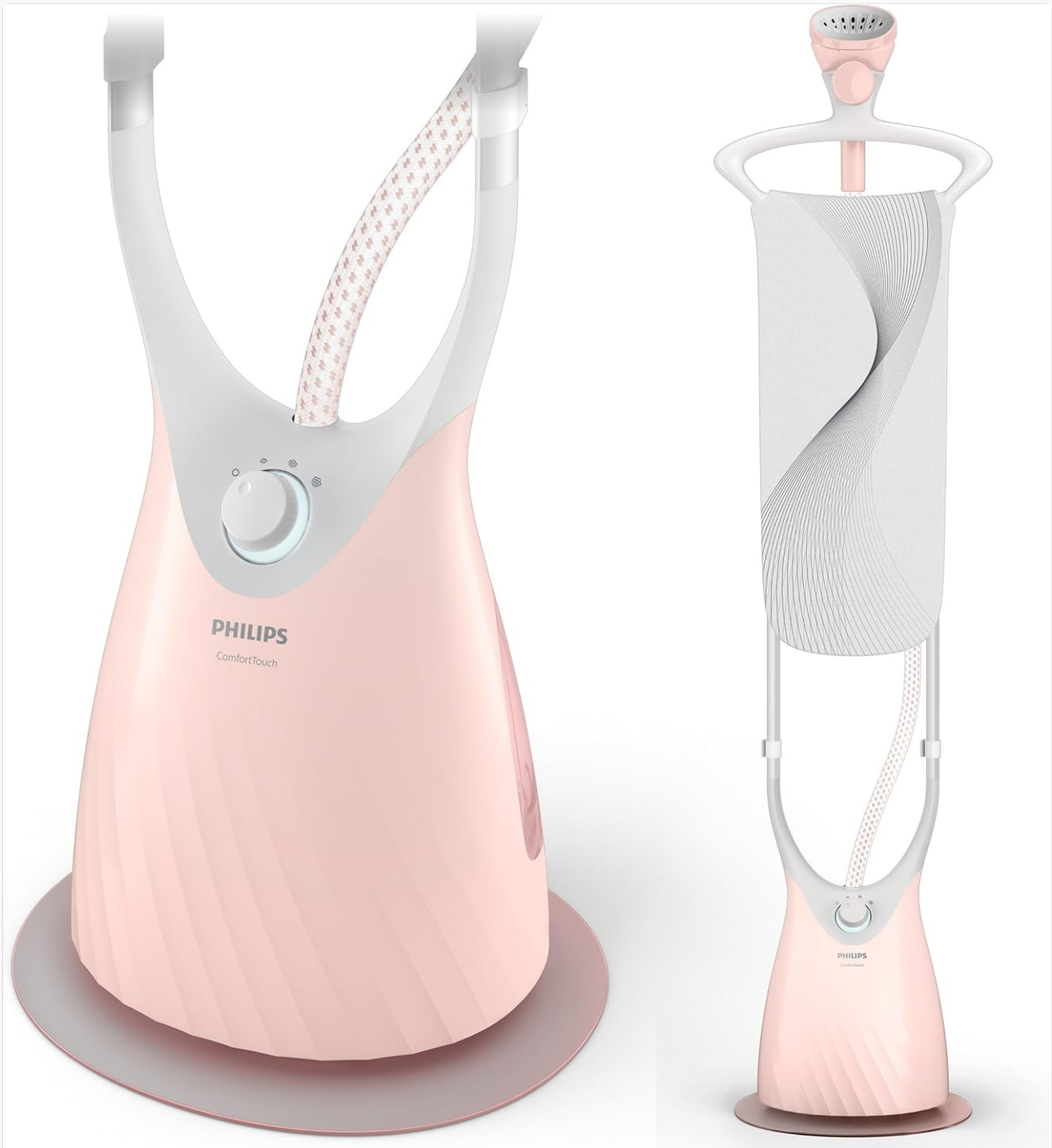
Image: A view of the Philips Garment Steamer GC552/46, showing its main components including the base, poles, Style Board, and steam head.