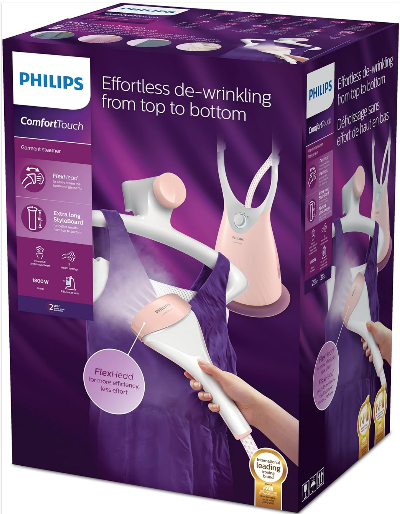
Image: The Philips Garment Steamer GC552/46 packaging, illustrating the various components and accessories included in the box.