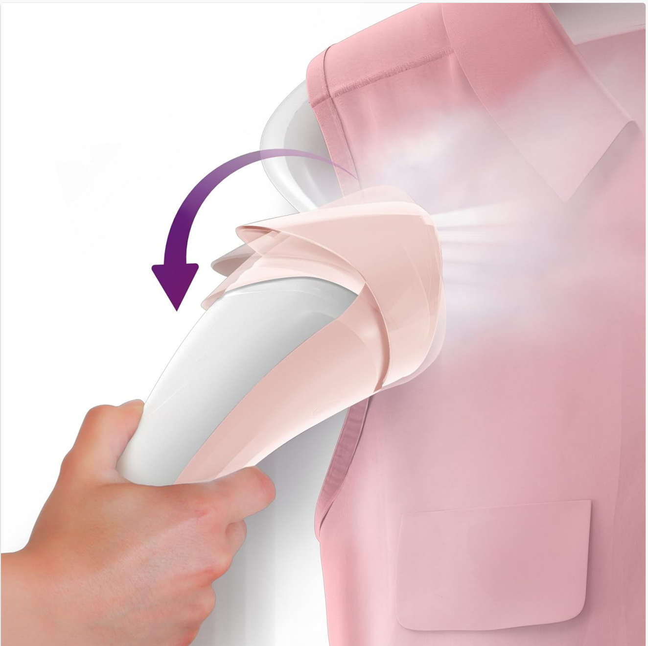
Image: A close-up view of the Flex Head technology, illustrating its flexible design for improved contact with fabric.

Image: A user demonstrating the steaming process on a garment, highlighting the downward motion and use of the Flex Head.