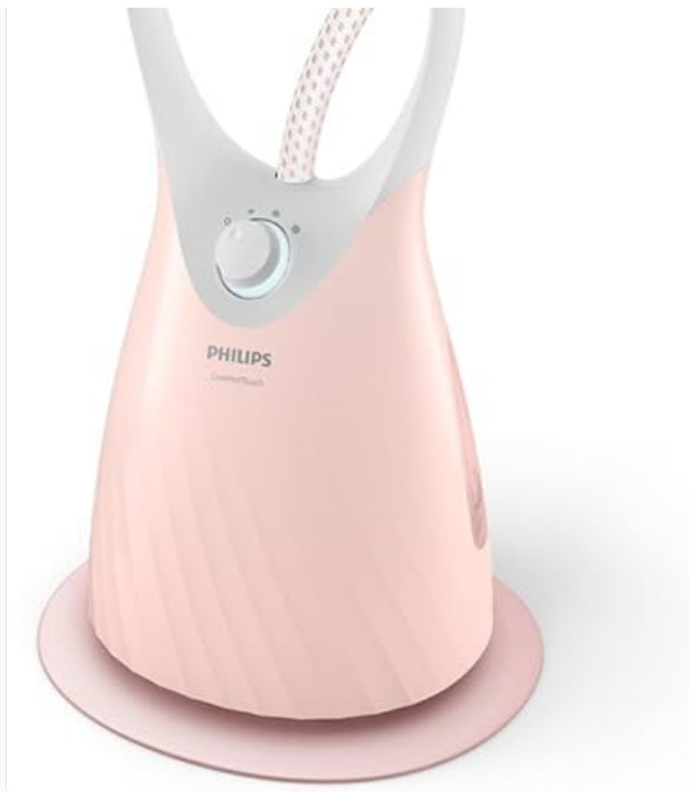
Image: The fully assembled Philips Garment Steamer GC552/46, ready for use.