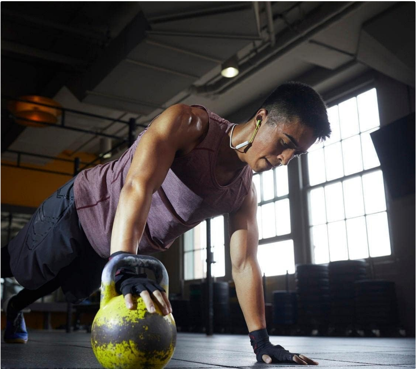
Image: A person performing push-ups with a kettlebell, wearing the Plantronics BackBeat FIT 300 earbuds, demonstrating their use during exercise.