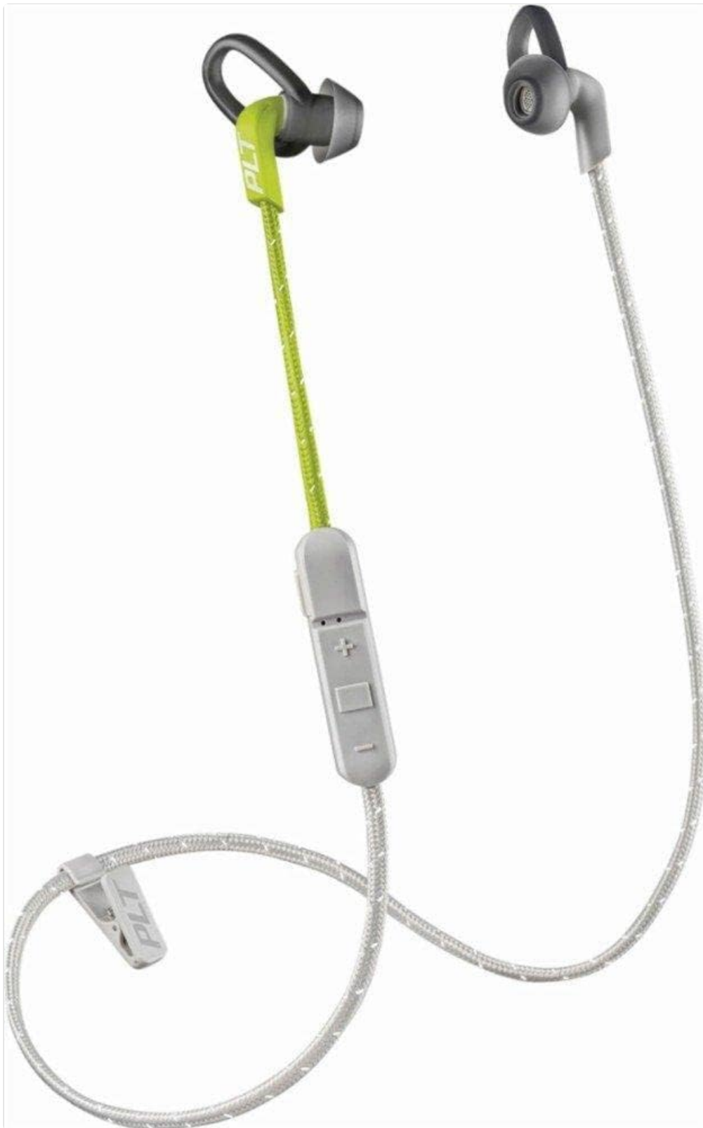
Image: Plantronics BackBeat FIT 300 earbuds in Grey/Lime color, showing the full product with the inline remote and cable.