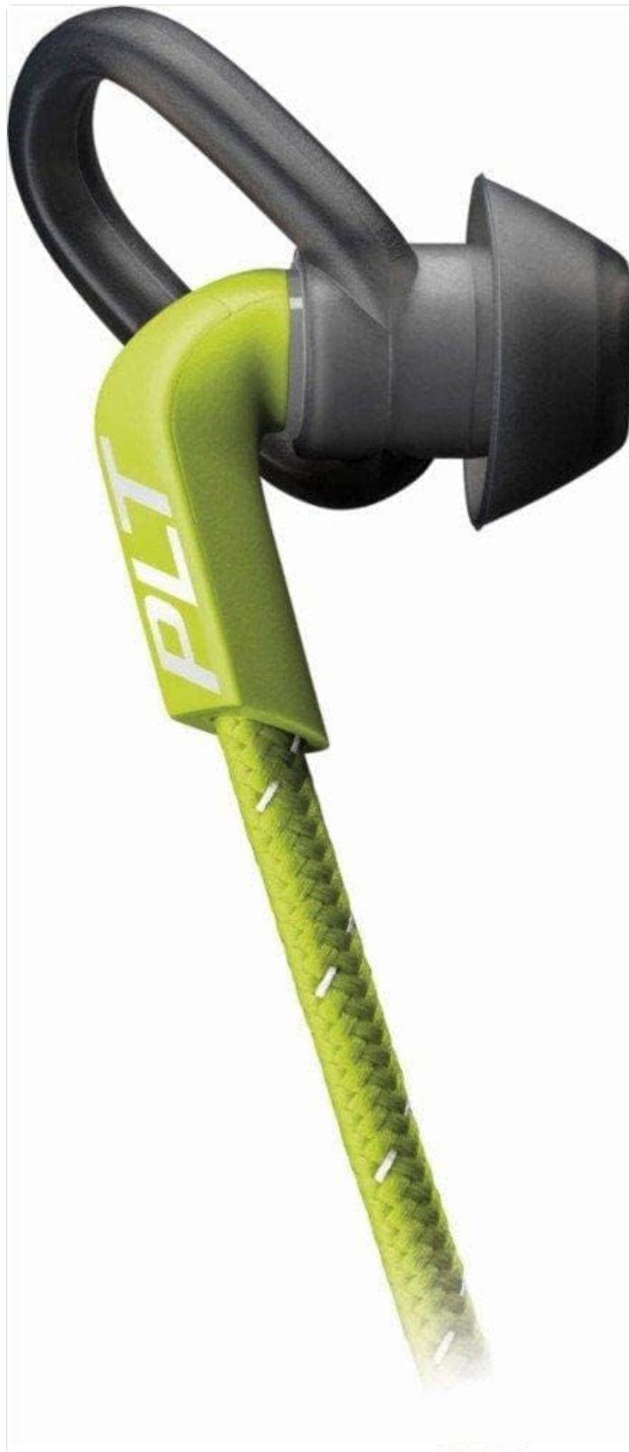
Image: Close-up view of a single Plantronics BackBeat FIT 300 earbud, highlighting its design and ear tip.