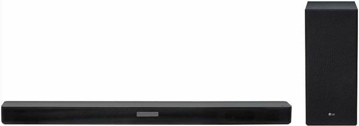
Image: The LG SK5Y Wireless Subwoofer, a black rectangular unit with a fabric grille on the front and the LG logo at the bottom.