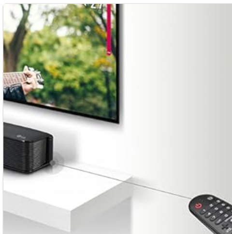
Image: The LG SK5Y remote control, a black rectangular device with various buttons for power, volume, input selection, and sound modes.