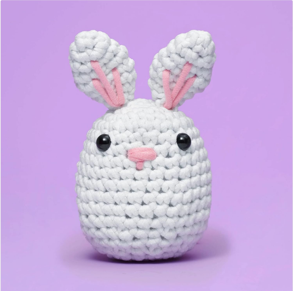
Image: A completed JoJo The Bunny crochet toy, showcasing its white body, pink inner ears, pink nose, and black safety eyes, against a purple background.