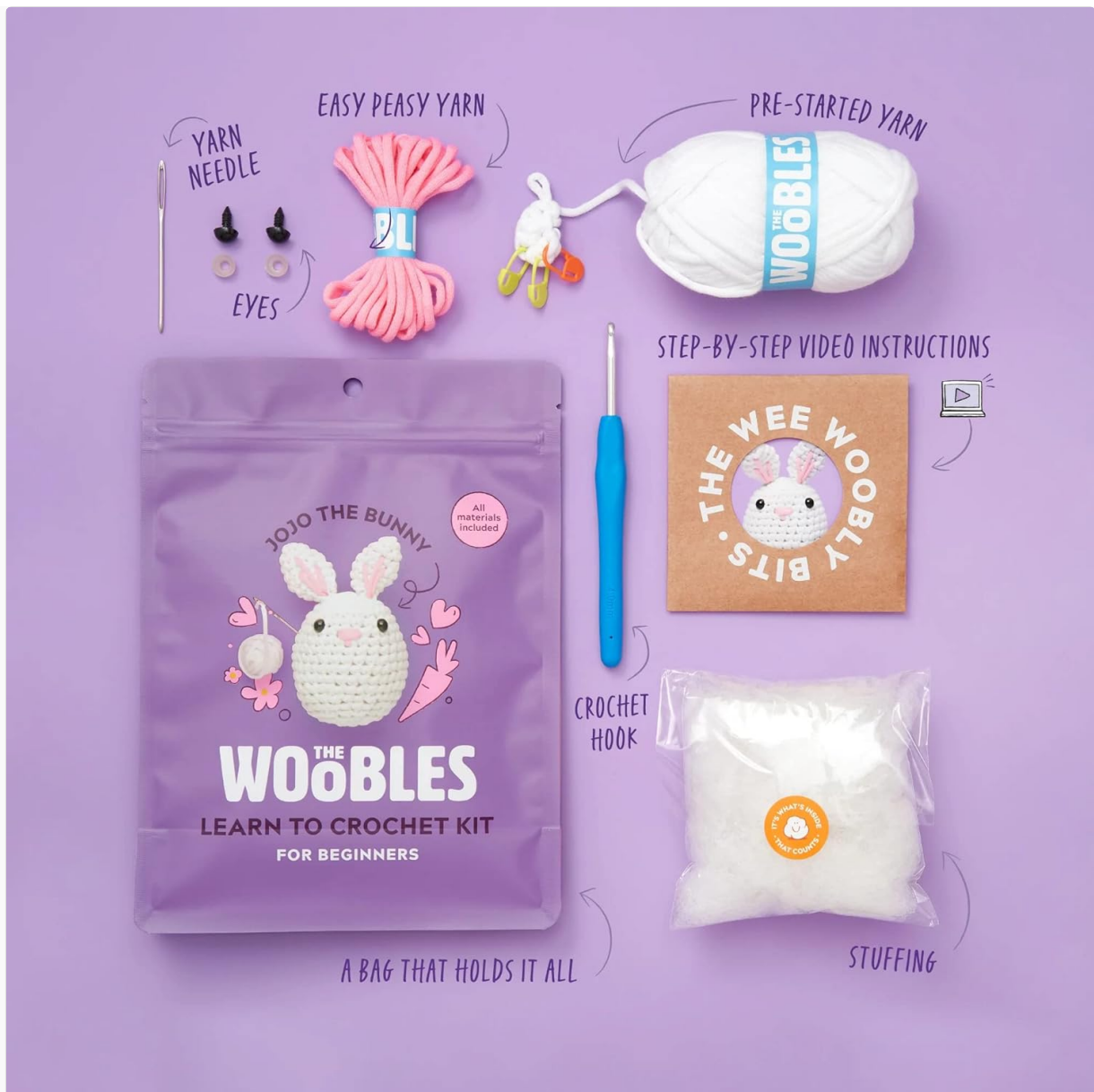
Image: All components of The Woobles JoJo The Bunny Crochet Kit, including pre-started yarn, Easy Peasy yarn, crochet hook, yarn needle, safety eyes, stuffing, and instruction card, laid out on a purple background.