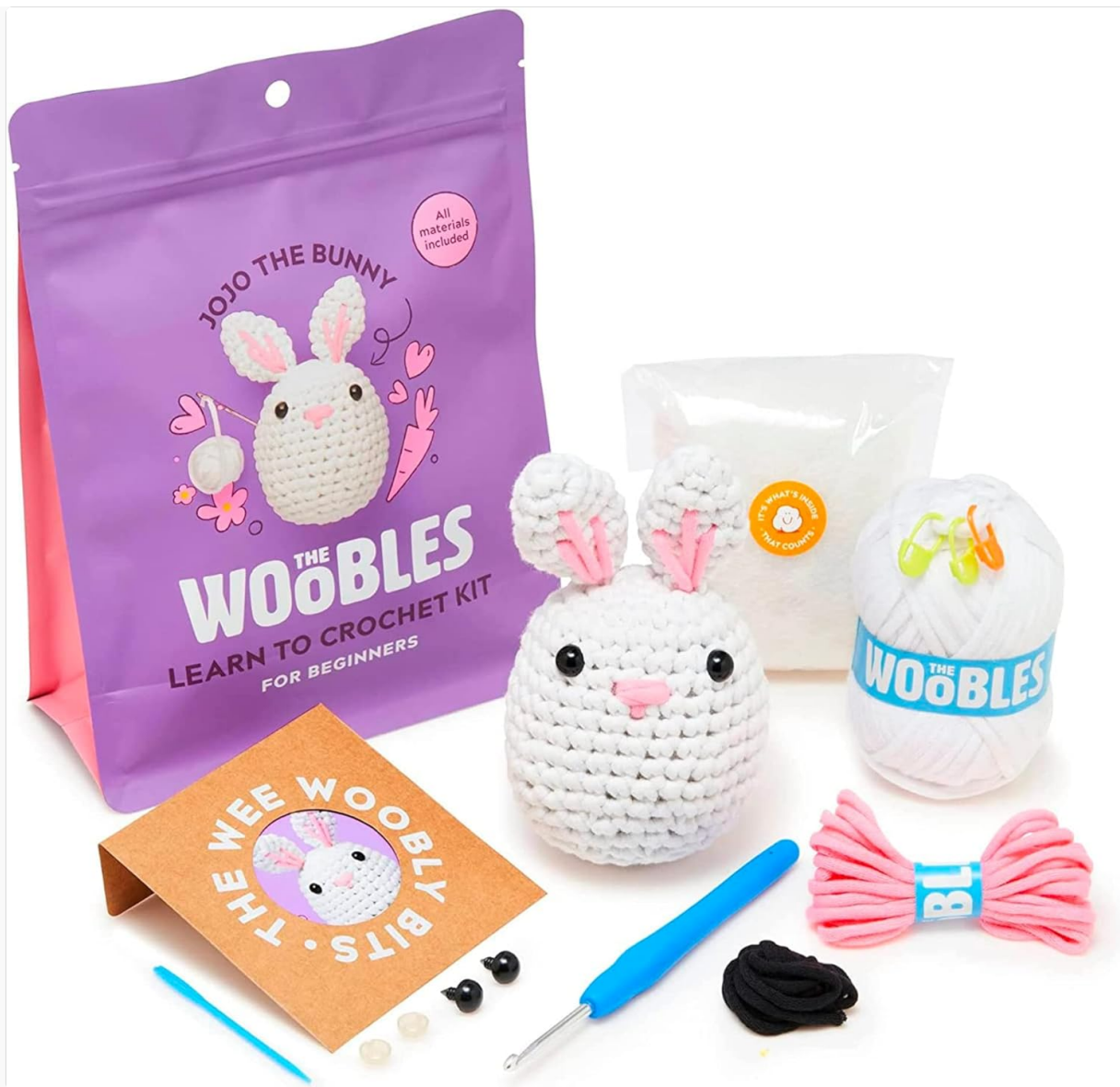
Image: The Woobles JoJo The Bunny Crochet Kit, showing the kit packaging, a finished JoJo The Bunny, and various components.