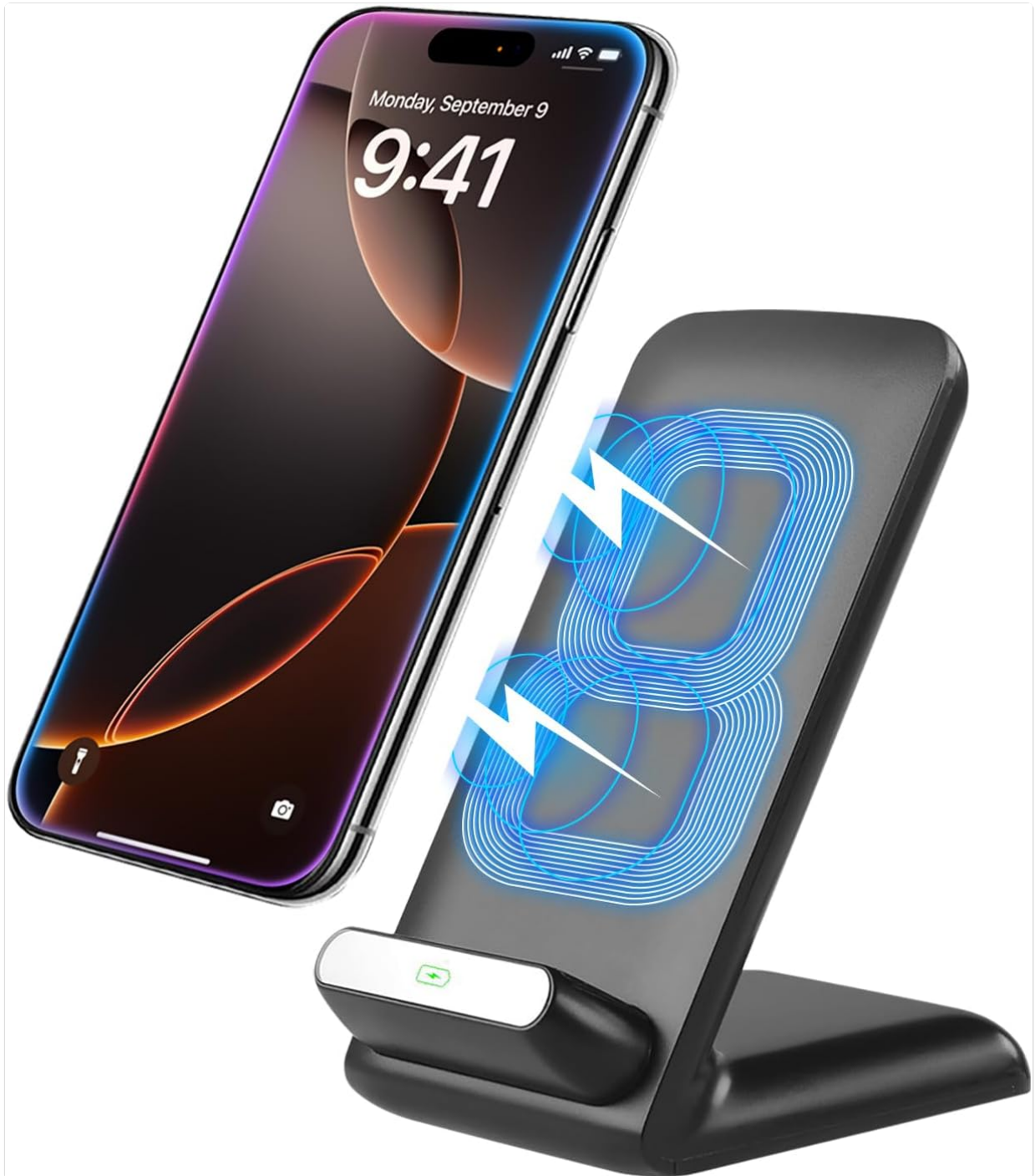
The Cellet Universal Wireless Charger and Phone Stand, designed for convenient wireless charging of compatible smartphones. The phone is shown in an upright, portrait orientation on the stand.