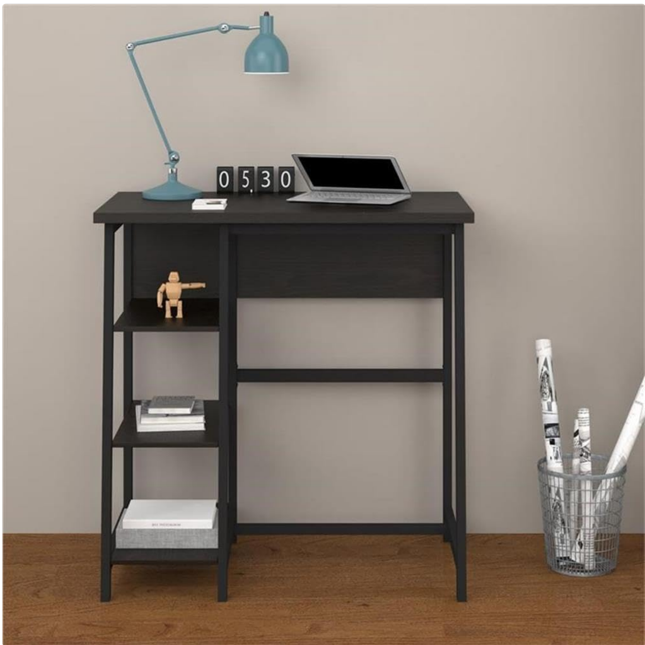
Image 2: The Coleton Standing Desk in use, demonstrating its ample work surface and convenient shelving for organization.