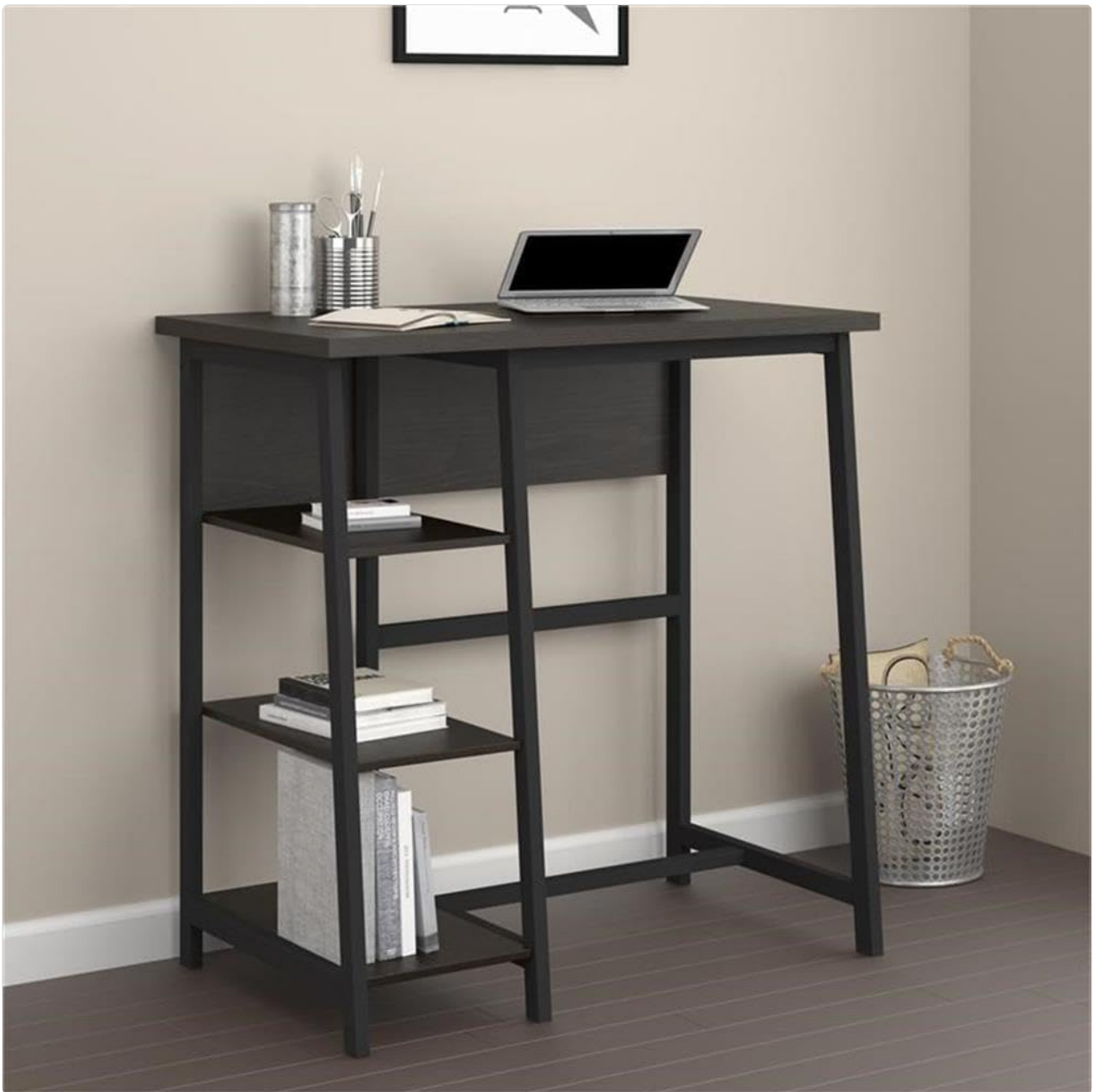
Image 1: The Ameriwood Home Coleton Standing Desk, showcasing its design and functionality in a home office environment.