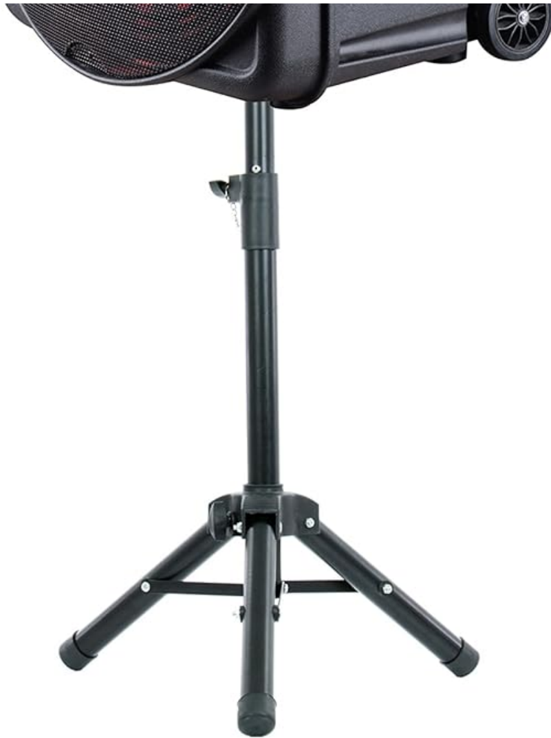
Figure 6.1: QFX PBX-118 speaker on its stand. This image demonstrates the speaker securely mounted on the included tripod stand, elevating it for optimal sound projection.