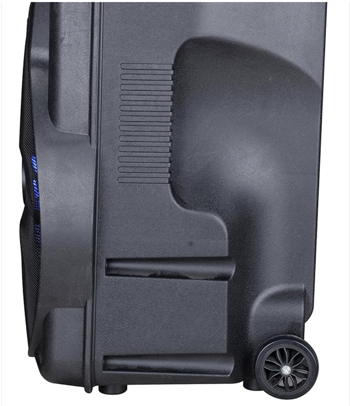
Figure 5.2: Side view of the QFX PBX-118 speaker. This image highlights the side profile, including the retractable handle and the integrated wheels for easy mobility.