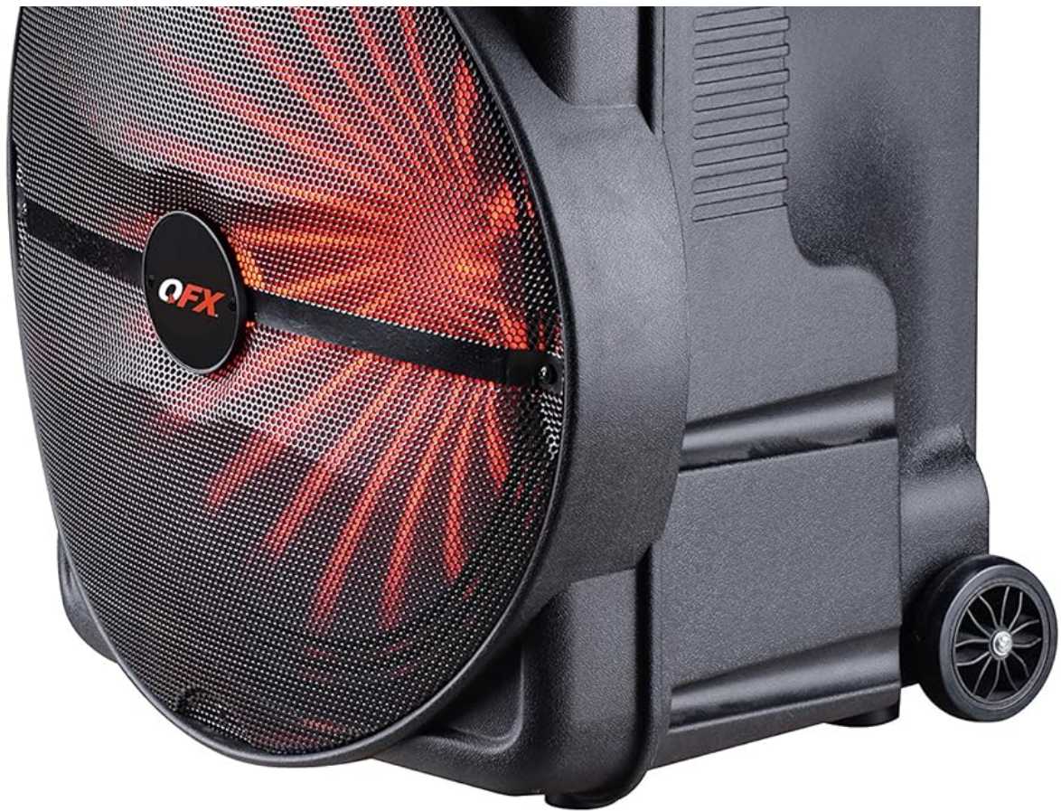
Figure 5.1: Front view of the QFX PBX-118 speaker. This image shows the speaker's front grille with an illuminated woofer, the extended handle, and wheels for transport.