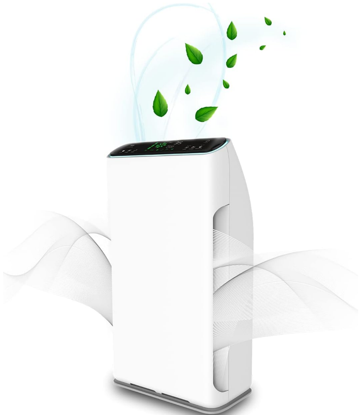
Image: Front view of the Kalorik TKG AP 2000 Air Purifier, illustrating air circulation and its sleek white design.