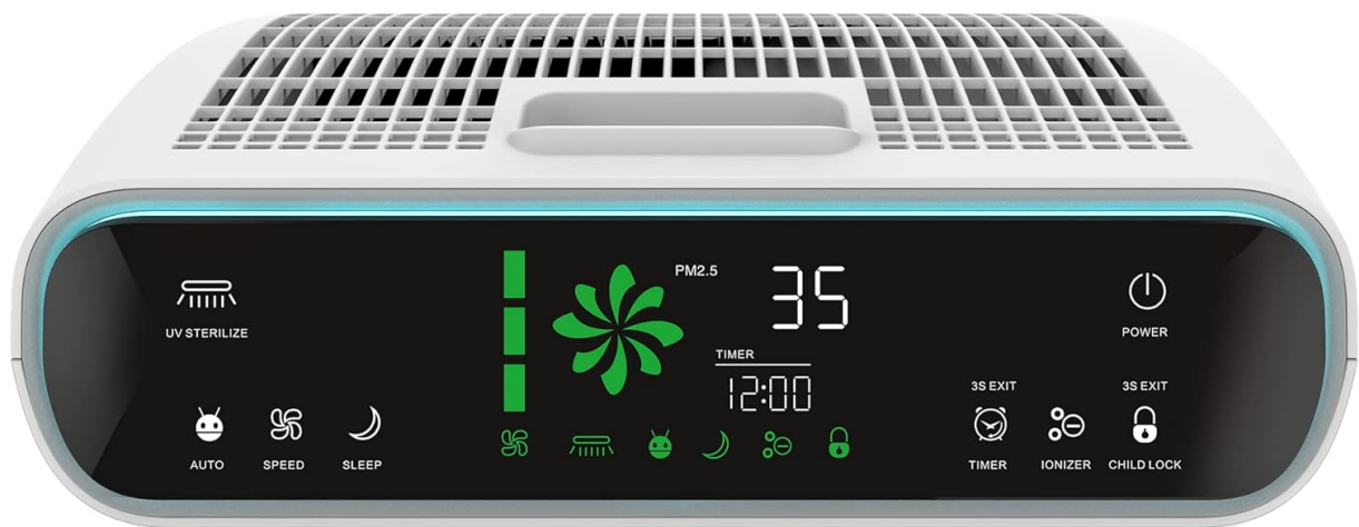
Image: Detailed view of the air purifier's top control panel, showing the LED display and various touch-sensitive buttons for operation.