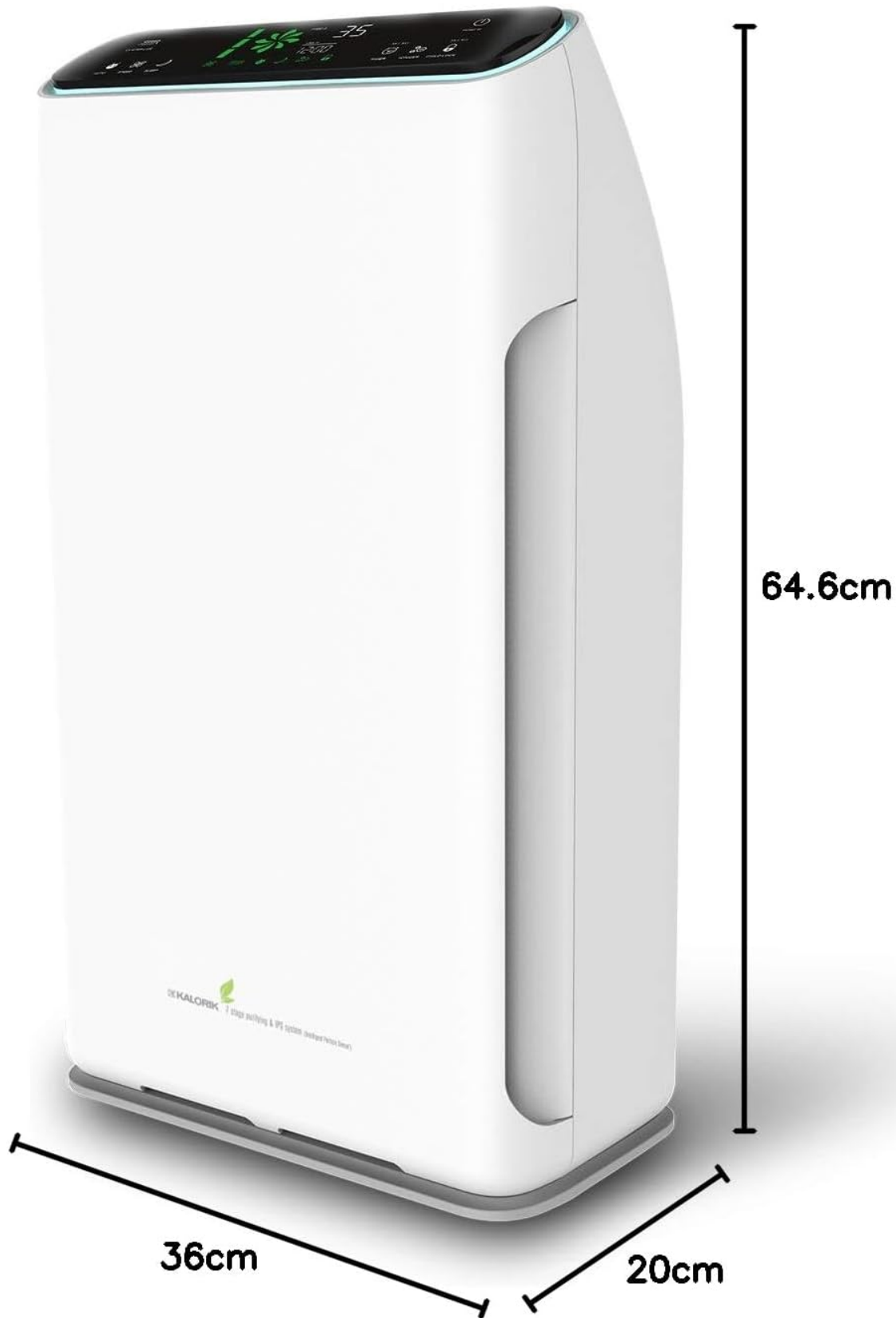
Image: Side profile of the air purifier, indicating its height (64.6cm), width (36cm), and depth (20cm).