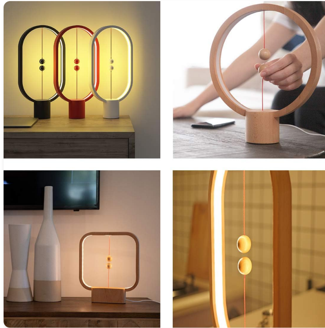
Image 4: Examples of the Heng Balance Lamp being used as a night light, reading light, desk lamp, and bedside lamp.

The lamp emits a warm white LED glow with a color temperature of 2700 Kelvin and a brightness of 600 lumens. It is designed to provide soft, ambient lighting suitable for various uses such as a night light, reading light, desk lamp, or bedside lamp.