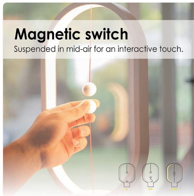
Image 3: A hand demonstrating the magnetic switch, showing the two spheres connecting to activate the light.

To turn on the Heng Balance Lamp, gently lift the lower magnetic sphere towards the upper magnetic sphere. The magnets will attract, holding the two spheres in mid-air. This action completes the circuit, illuminating the LED light strip within the lamp frame.