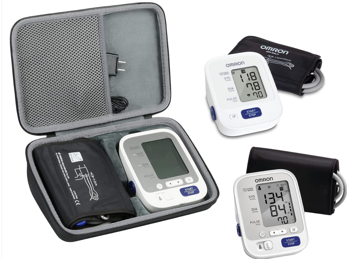
Image 2.1: This image illustrates the compatibility of the co2CREA hard case with both the OMRON Bronze Blood Pressure Monitor BP5100 and the OMRON 5 Series Upper Arm Blood Pressure Monitor BP742N. The case is shown alongside the monitors it is designed to protect.

OMRON Bronze Blood Pressure Monitor BP5100 Omron 5 Series Upper Arm Blood Pressure Monitor BP742N