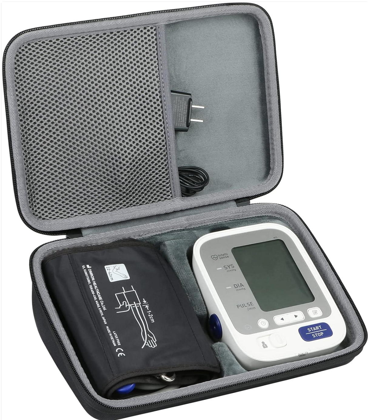
Image 1.1: The co2CREA hard case, open and ready to store an OMRON blood pressure monitor and its cuff. The case features a dedicated compartment for the monitor and a mesh pocket for the cuff and other small accessories.