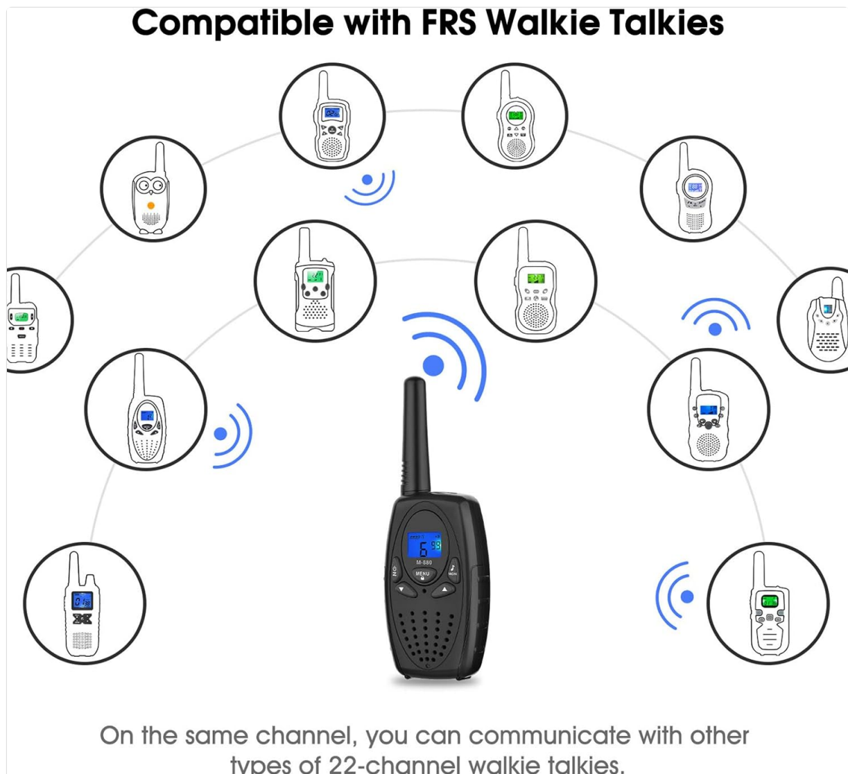
Figure 3: Compatibility with other FRS walkie talkies on the same channel.

Note: For successful communication, both radios must be set to the same main channel and privacy code.