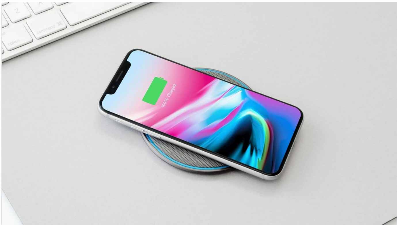
Image: A smartphone being charged wirelessly on the pad.