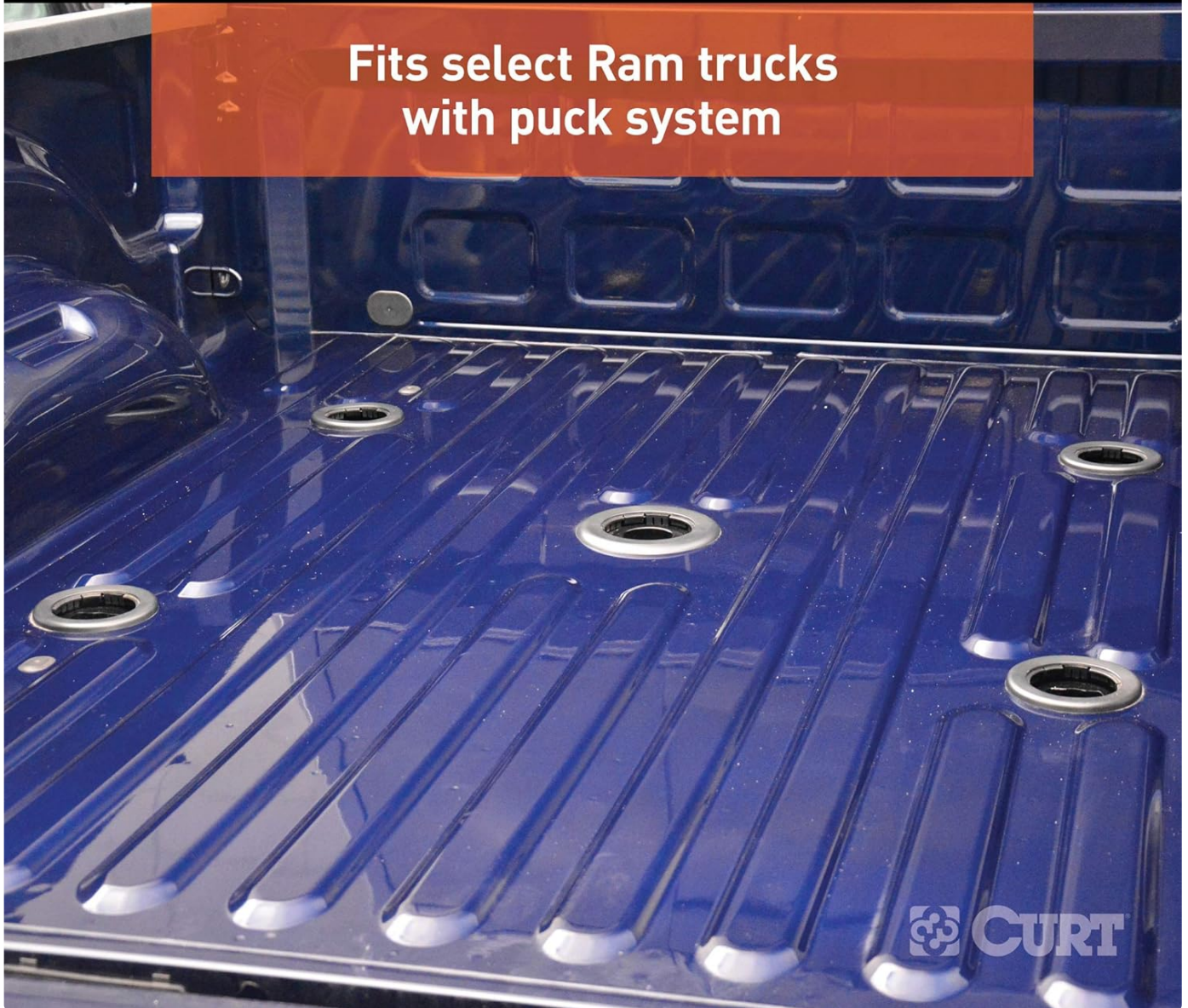
Image: A close-up view of a Ram truck bed showing the integrated OEM puck system receptacles.