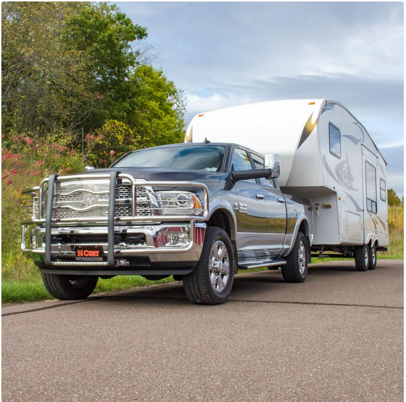
Image: A Ram truck towing a large 5th wheel trailer, demonstrating the hitch in use.