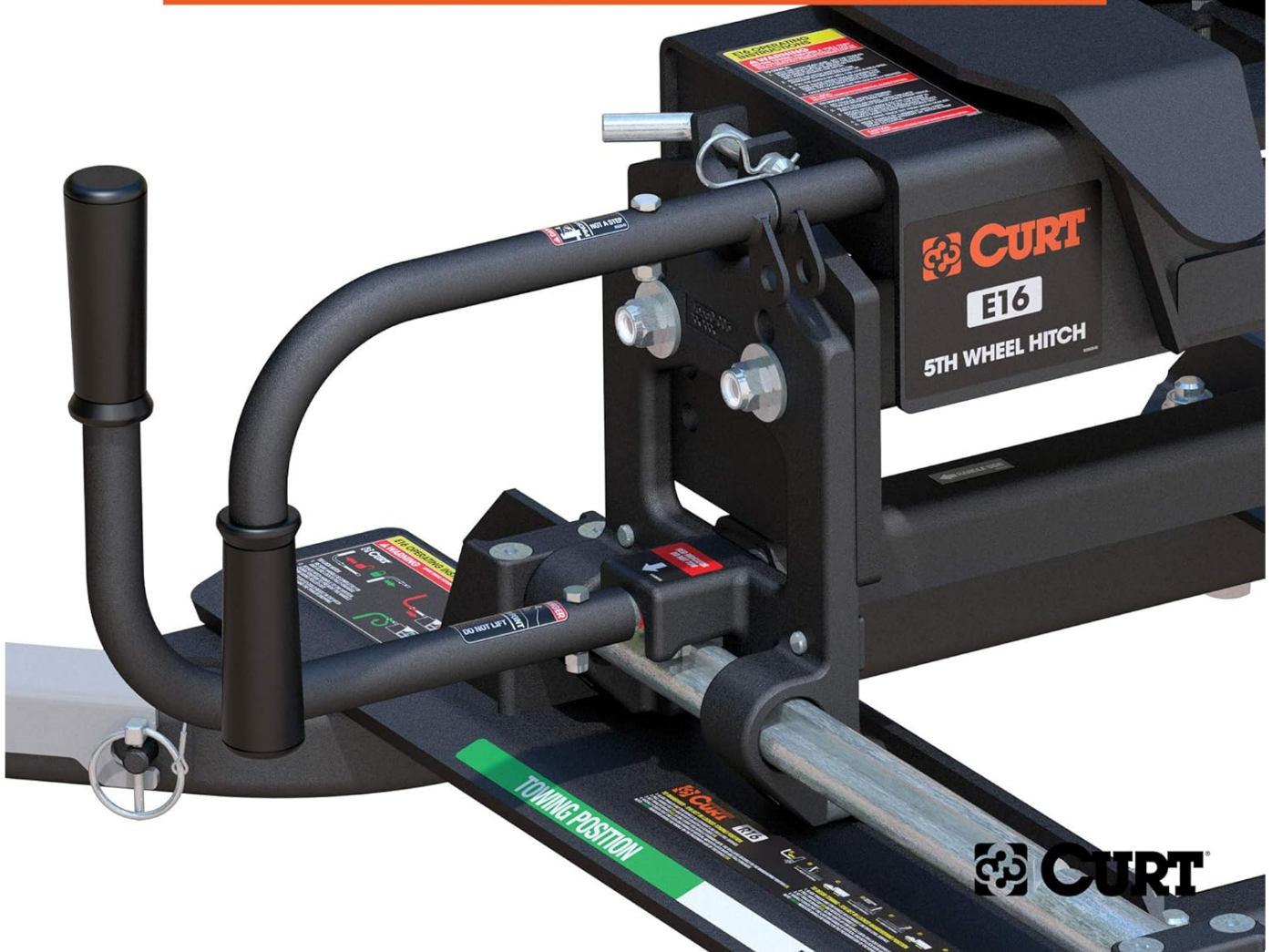
Image: A side view of the CURT E16 hitch highlighting the versatile height adjustment points.