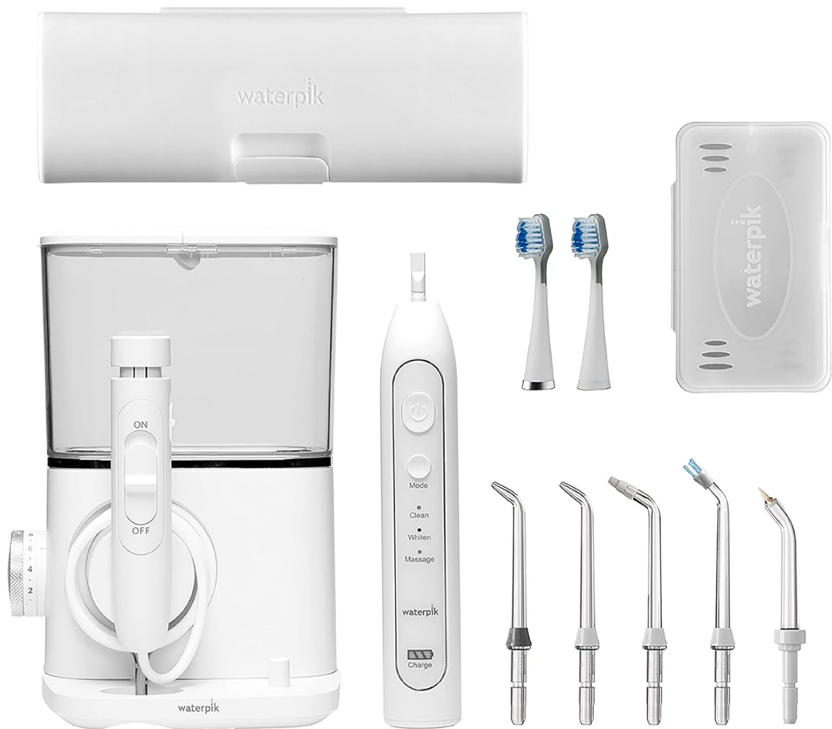
Image: A top-down view of all components included in the Waterpik Complete Care 9.0 package, neatly arranged. This includes the main unit, electric toothbrush, water flosser handle, various tips, brush heads, and storage cases.