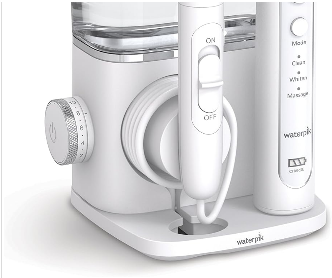
Image: The Waterpik Complete Care 9.0 unit, featuring a white base with a clear water reservoir, an electric toothbrush on the left, and a water flosser handle on the right.