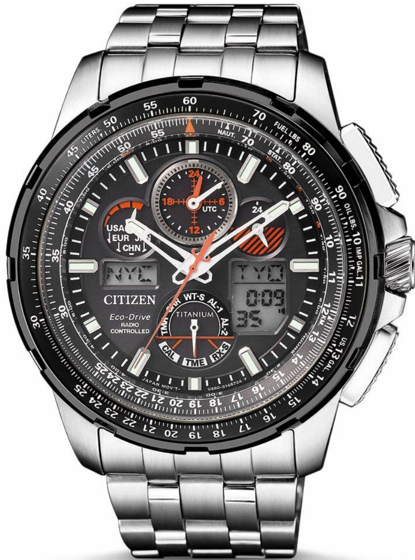
Image: Front view of the Citizen Promaster Eco-Drive Radio Controlled Watch JY8069-88E, showcasing its black dial and titanium bracelet.