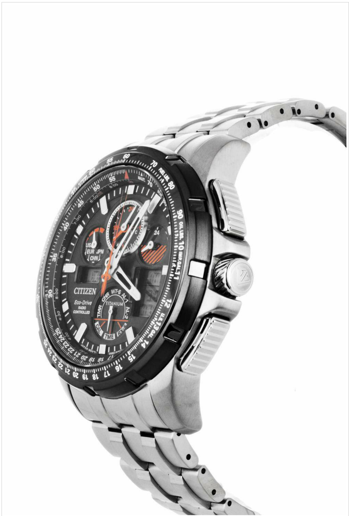
Image: Side view of the watch, highlighting the crown and pushers, which should be kept clean and free of debris.