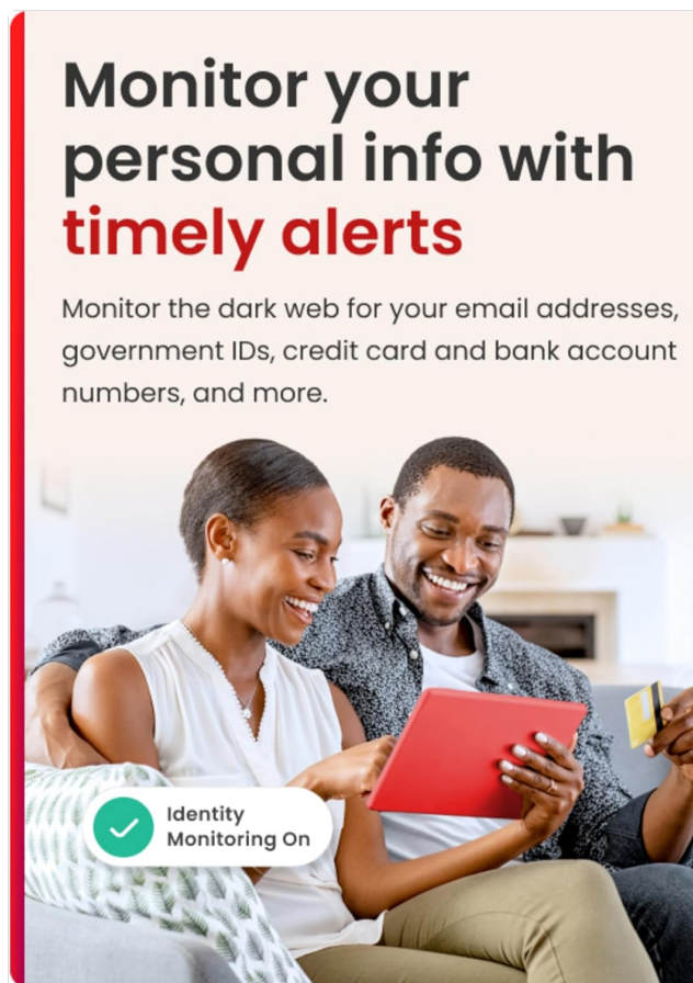
Figure 5: Timely Identity Alerts. This image emphasizes the identity monitoring feature, showing how McAfee monitors the dark web for your email addresses, government IDs, credit card, and bank account numbers, providing timely alerts if found in a data breach.

Your browser does not support the video tag.