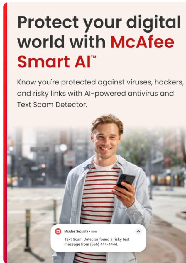
Figure 3: Digital World Protection. This image visually outlines how McAfee's Smart AI-powered antivirus and Text Scam Detector work together to protect your digital world from viruses, hackers, and risky links.