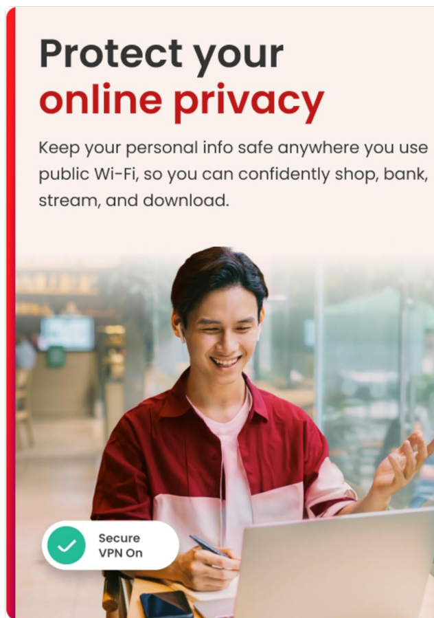
Figure 4: Online Privacy Protection. This image highlights the Secure VPN feature, emphasizing its role in keeping your personal information safe when using public Wi-Fi, allowing for confident shopping, banking, streaming, and downloading.

Your browser does not support the video tag.