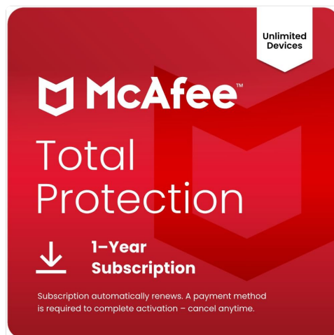
Figure 1: McAfee Total Protection Unlimited Devices 2025 Product Box. This image displays the software's packaging, highlighting its key features like unlimited devices and 1-year subscription.

This manual will guide you through the installation process, explain how to utilize the various protection features, and provide information on maintenance and support.