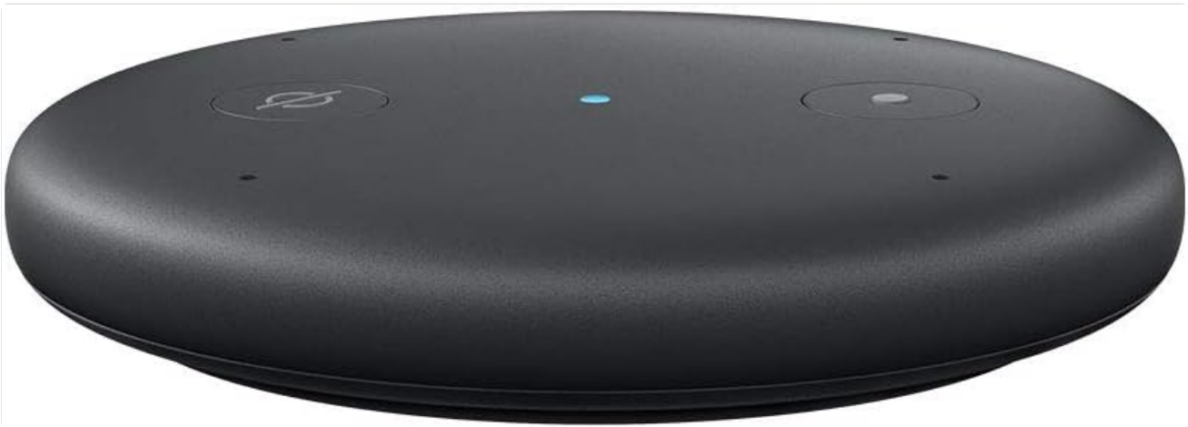
Image: A detailed view of the Echo Input, showcasing its compact and minimalist design, which allows it to fit almost anywhere.