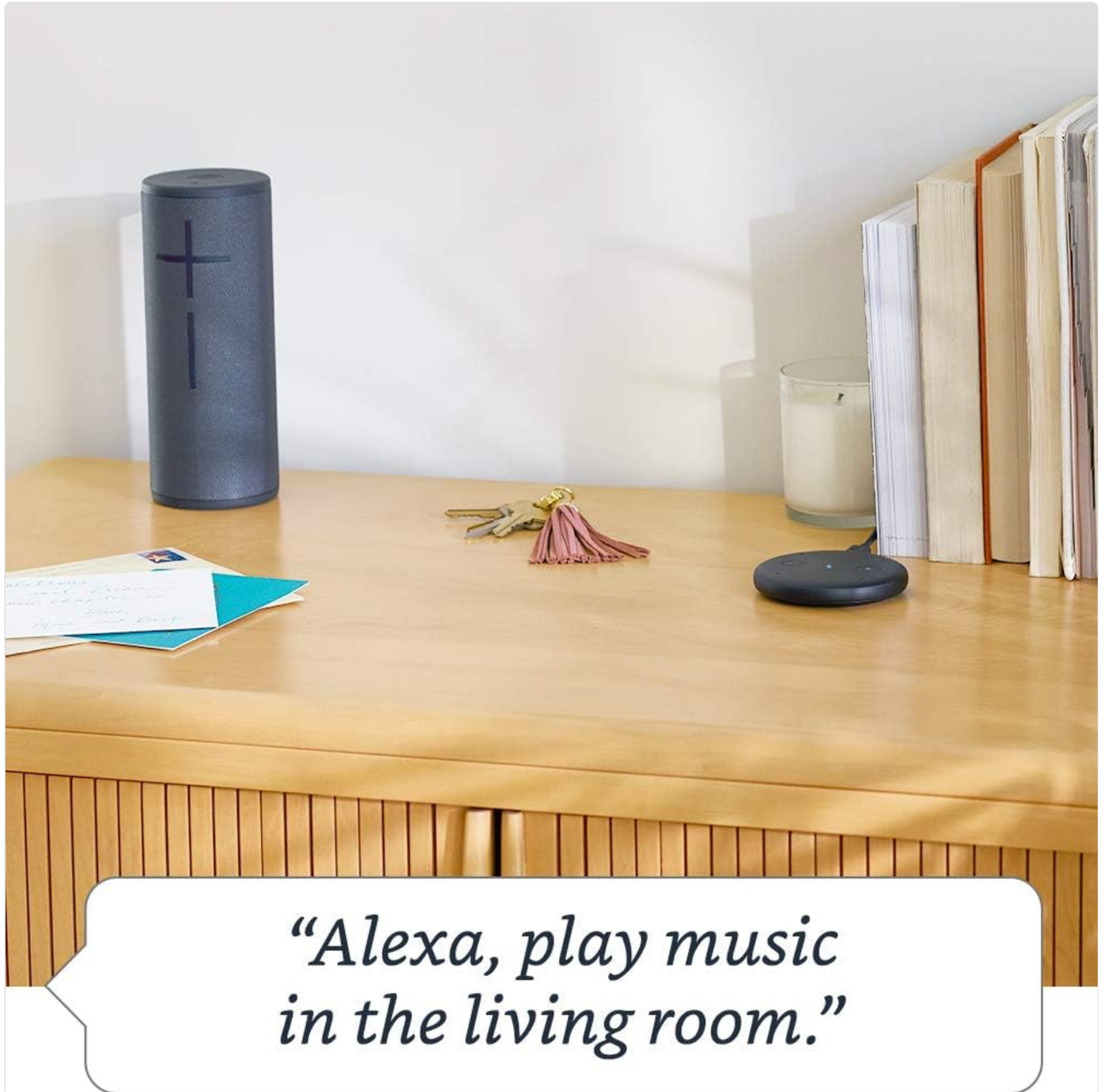
Image: A user interacting with the Echo Input, demonstrating a common voice command for music playback. The device is shown discreetly placed on a wooden surface.