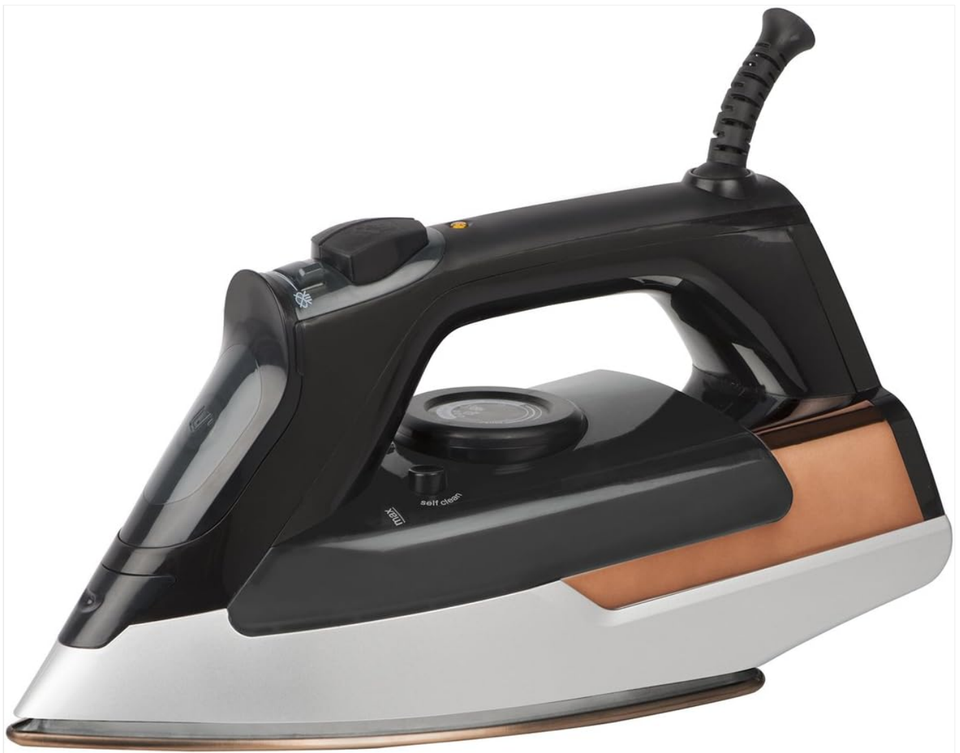
Image: Front-side view of the Conair Extreme Steam Pro Steam Iron, showcasing its black, silver, and copper design.