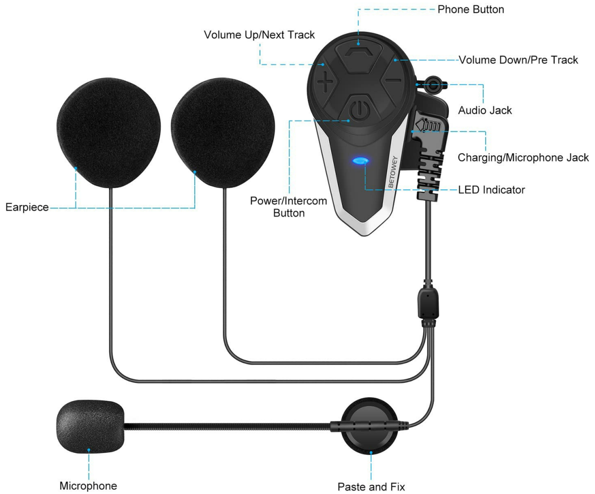
Image: A detailed diagram of the BT-S3 unit, clearly labeling all buttons, ports, and connected components like earpieces and microphone.