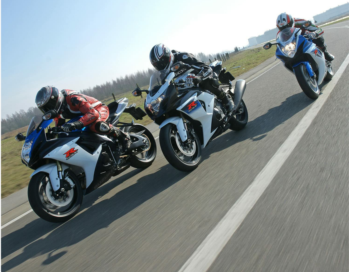
Image: Three motorcyclists on the road, visually representing the BT-S3's multi-rider intercom capability.

Bluetooth 5.0 ensures faster and more stable connection