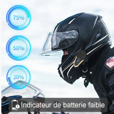
Image: A visual representation of the battery level indicator on the BT-S3, showing different charge levels.