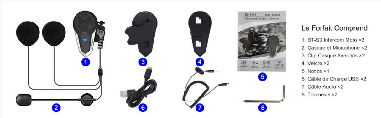
Image: A comprehensive diagram illustrating all items included in the BT-S3 product package.