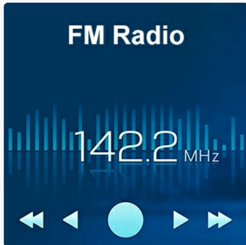
Image: A visual representation of the FM radio function, displaying a sample frequency.