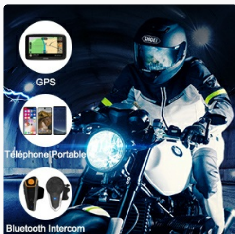
Image: A motorcyclist on the road, illustrating the BT-S3's ability to connect with GPS devices, mobile phones, and other Bluetooth intercoms.