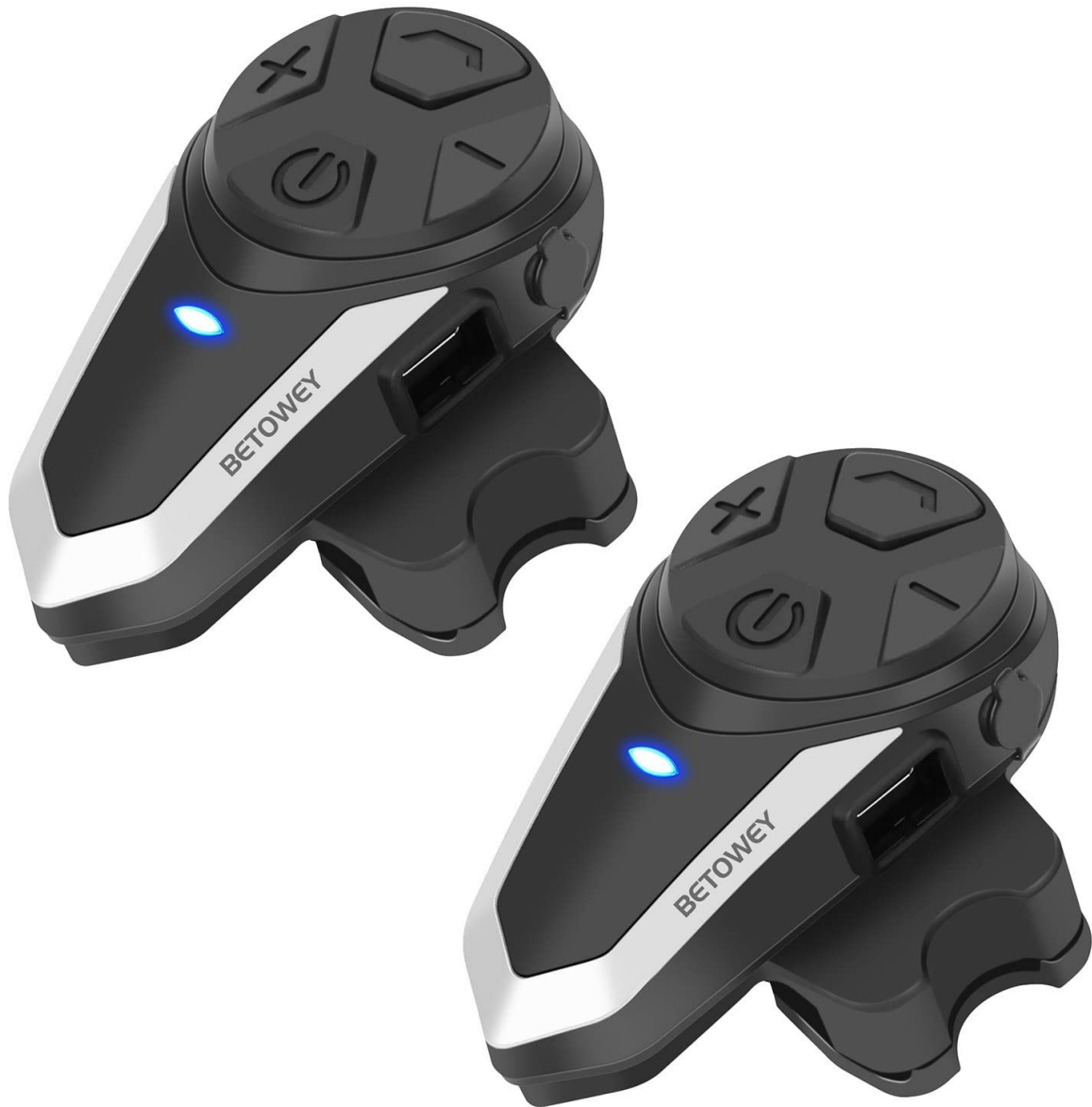
Image: Two BETOWEY BT-S3 intercom units, showcasing their compact design and integrated controls.