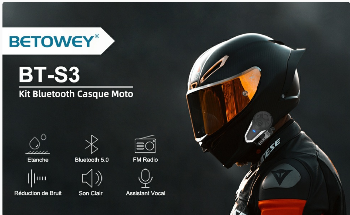
Image: BETOWEY BT-S3 Bluetooth Motorcycle Intercom System mounted on a helmet, highlighting its features.