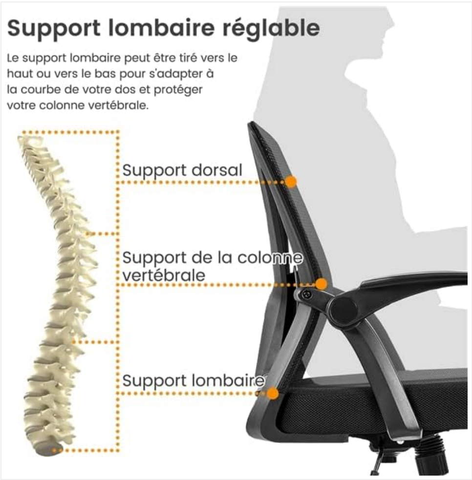
Image: A diagram highlighting the adjustable lumbar support feature on the chair's backrest, showing its position relative to the spine.