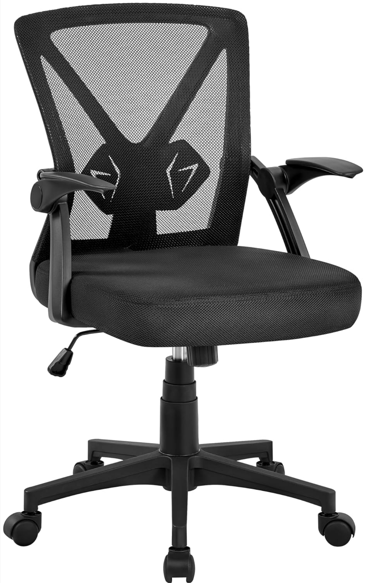
Image: Front view of the Yaheetech Office Chair, Model YA592506, in black with mesh back and foldable armrests.