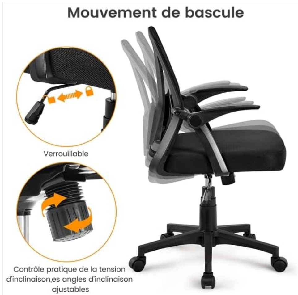
Image: Illustration demonstrating the backrest tilt movement and the tilt tension adjustment knob located beneath the seat.