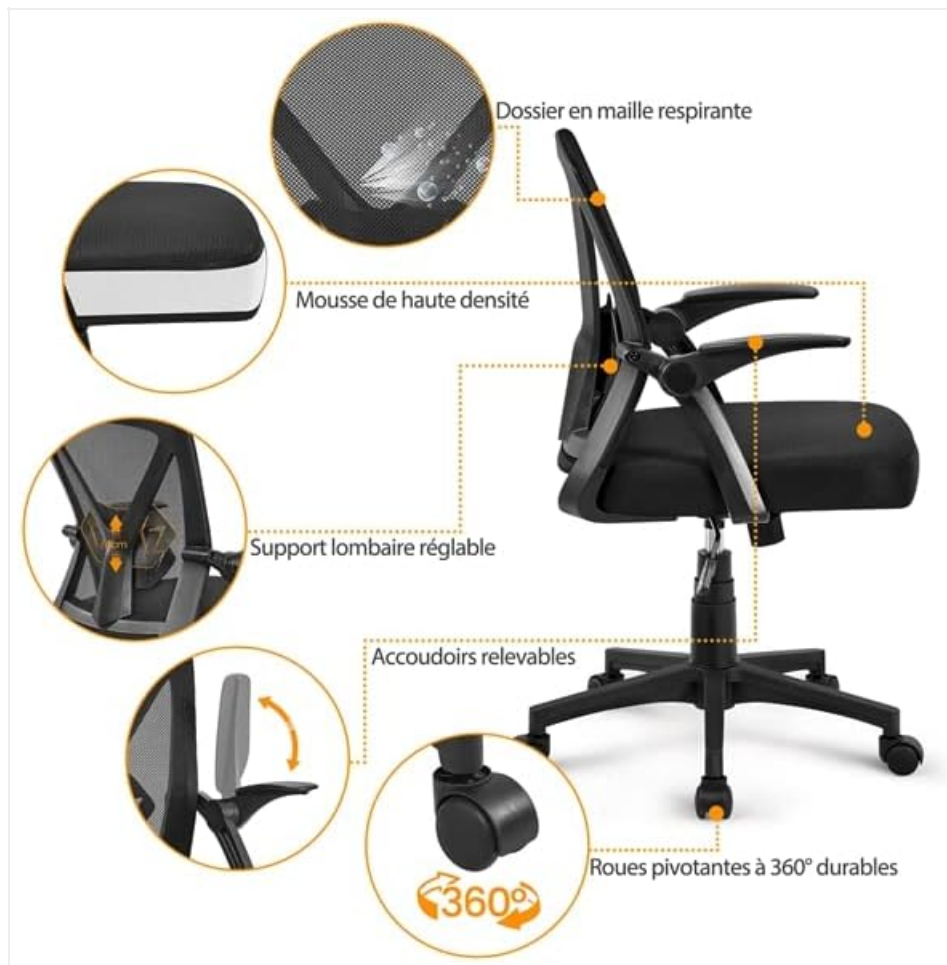
Image: Diagram showing various components of the office chair, including the mesh backrest, seat, armrests, gas lift, and star base with wheels.