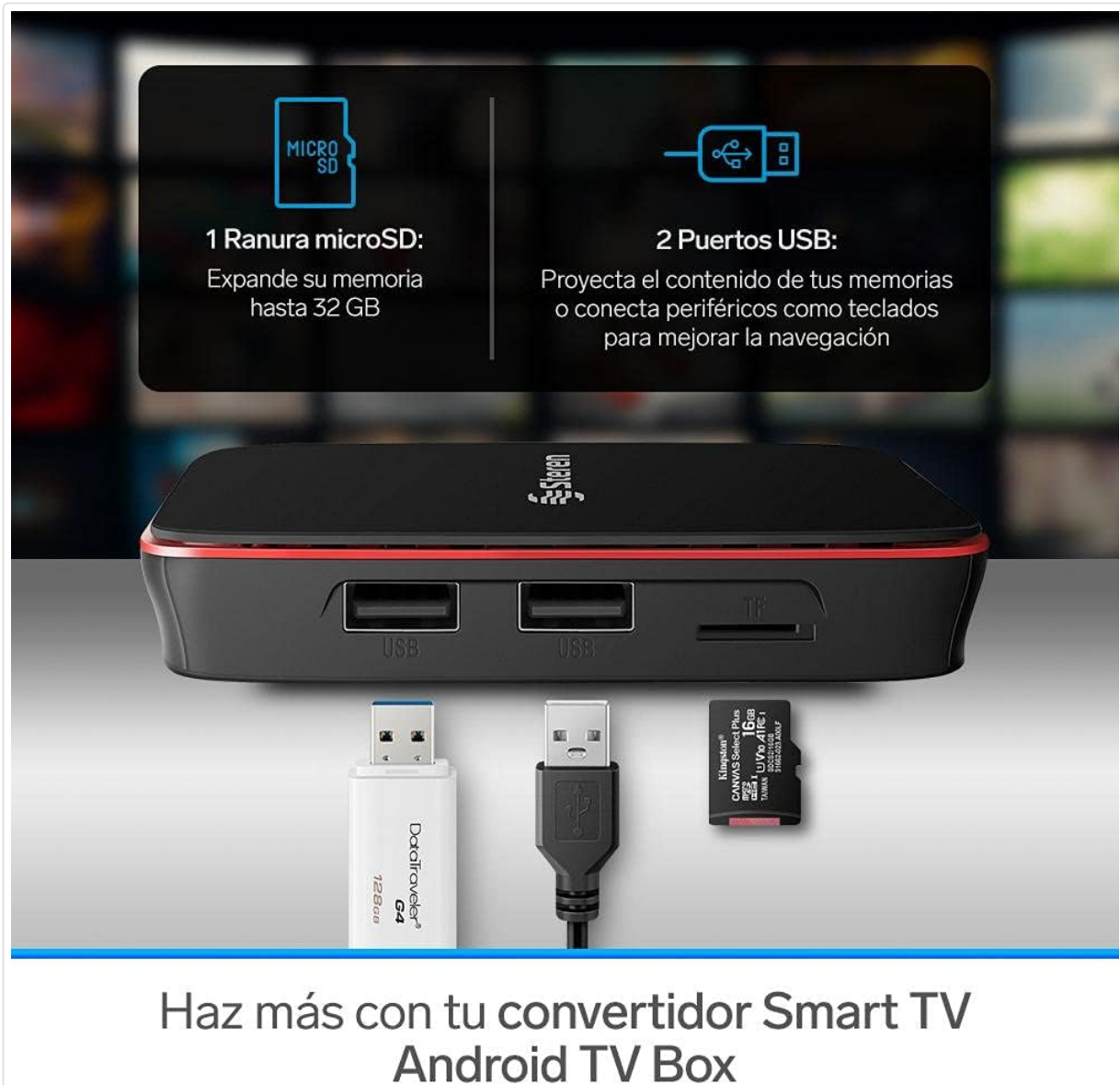
Image 2.1: The Steren INTV-110 device highlighting its USB ports and MicroSD card slot, demonstrating connectivity options for external storage and peripherals.