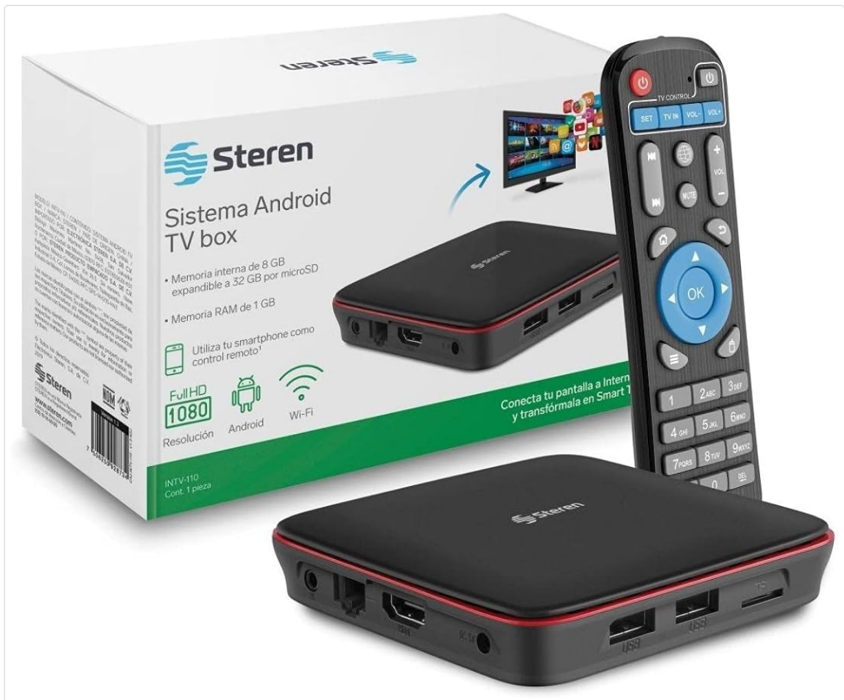
Image 1.1: The Steren INTV-110 Android TV Box, its remote control, and product packaging.