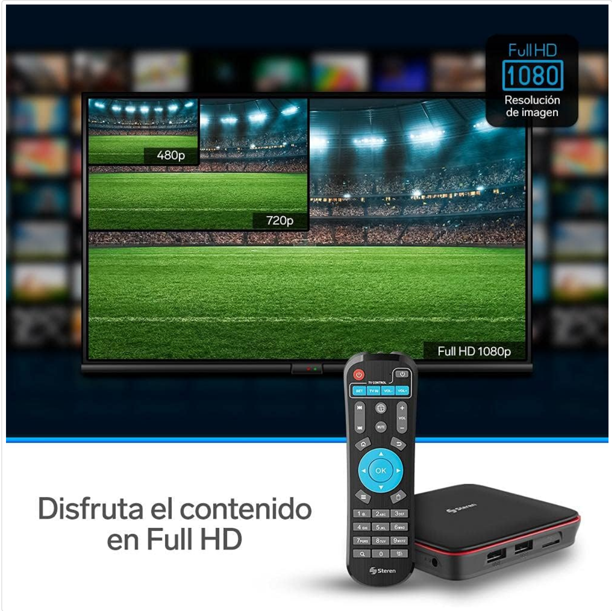
Image 6.2: Visual representation of Full HD 1080p resolution supported by the INTV-110, compared to lower resolutions.