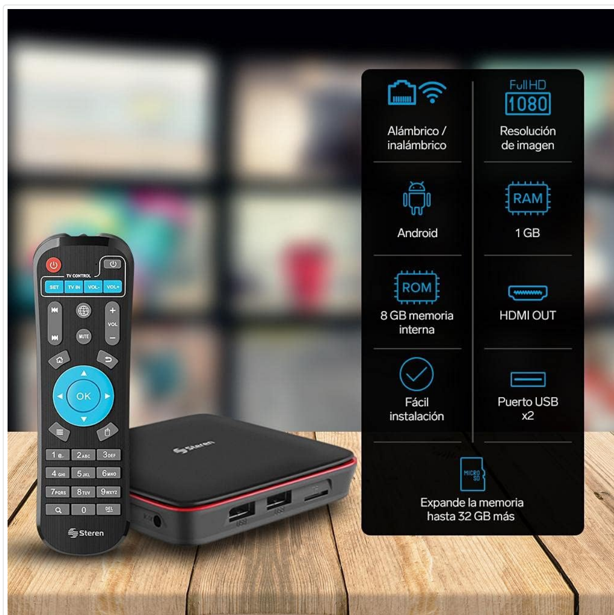
Image 6.1: Key features and specifications of the Steren INTV-110, including resolution, memory, and connectivity.