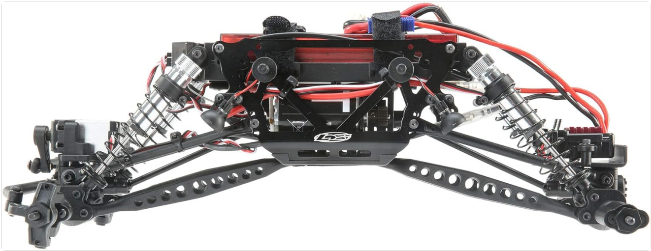
Image: Underside view of the chassis, illustrating the robust suspension and drivetrain components.