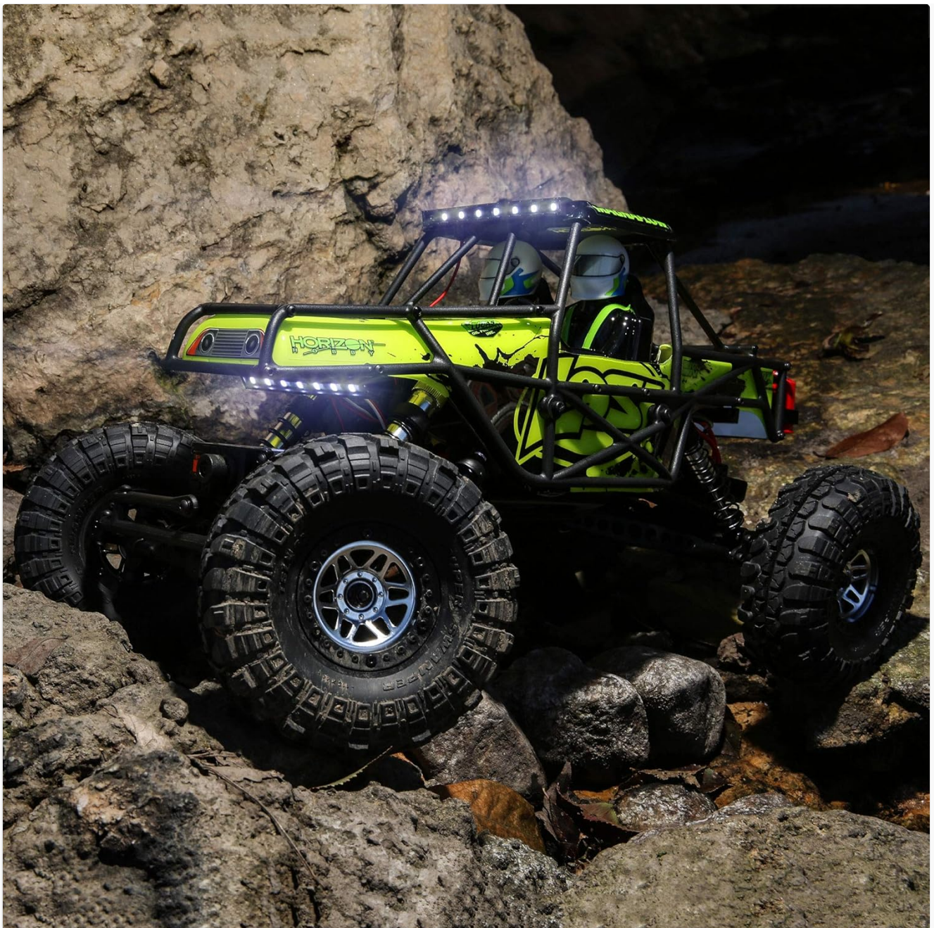
Image: Another view of the Night Crawler SE traversing uneven rocky terrain, highlighting its robust design.