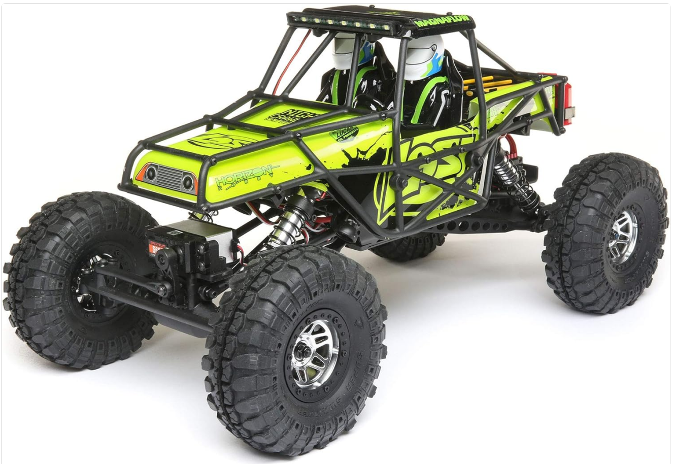
Image: The Losi 1/10 Night Crawler SE Rock Crawler, showcasing its exoskeleton cage and green body.

This manual provides essential information for the safe and efficient operation, setup, and maintenance of your Losi 1/10 Night Crawler SE. Please read this entire manual before operating the vehicle to ensure proper function and to prevent damage or injury. This product is a sophisticated hobby item and requires careful handling.