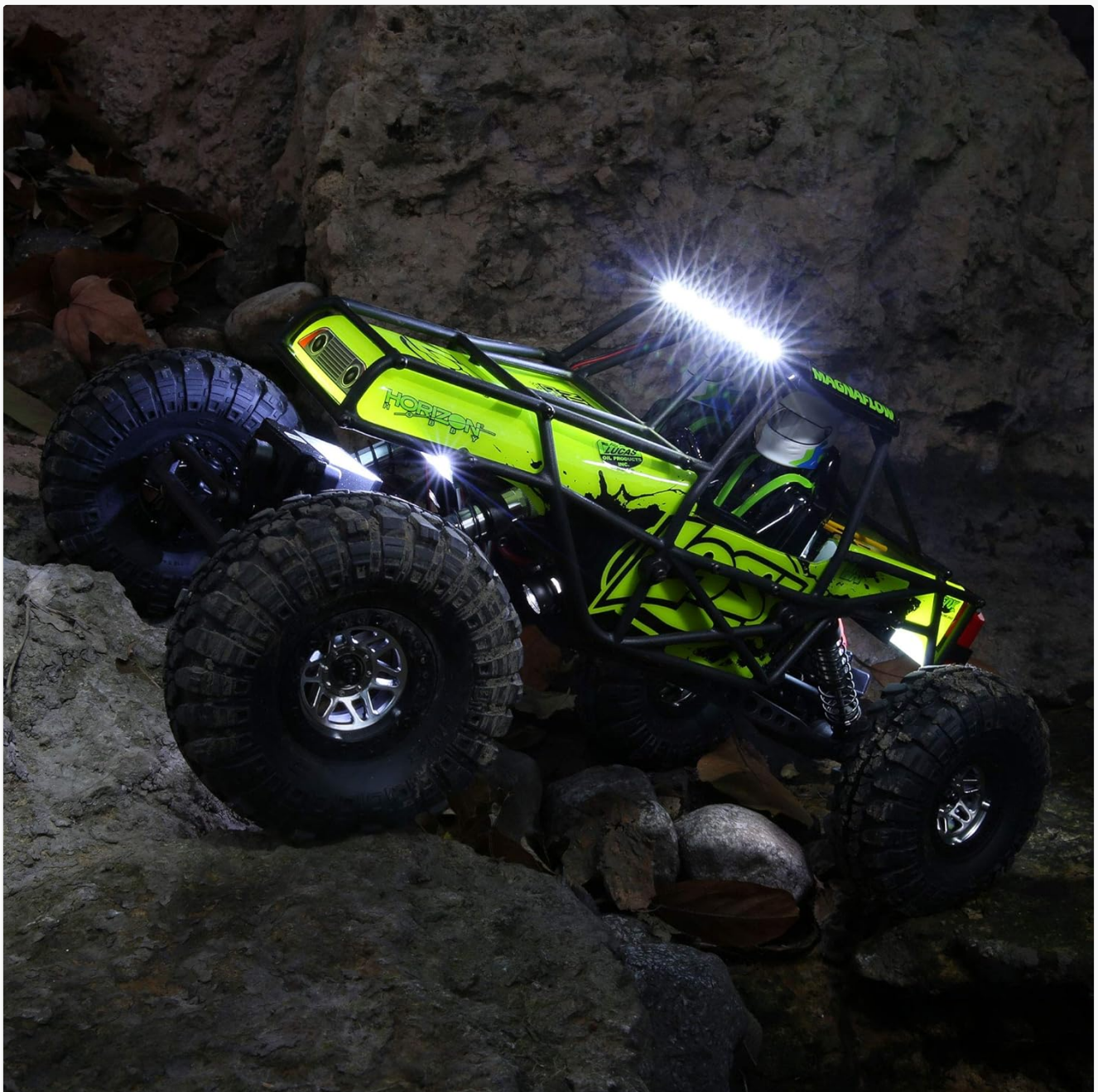
Image: The Night Crawler SE demonstrating its capabilities on a rocky path, with its integrated rock lights active.