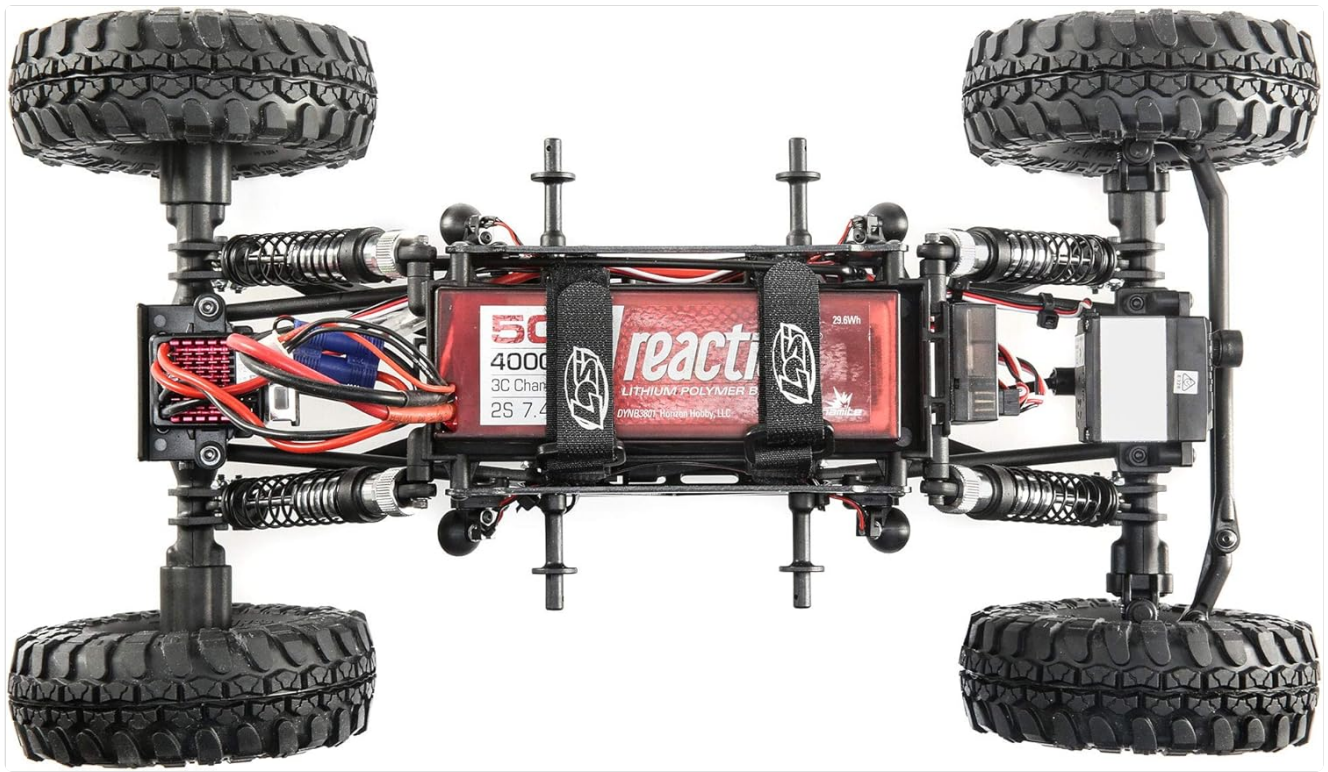
Image: Top view of the chassis showing the battery secured in its compartment.