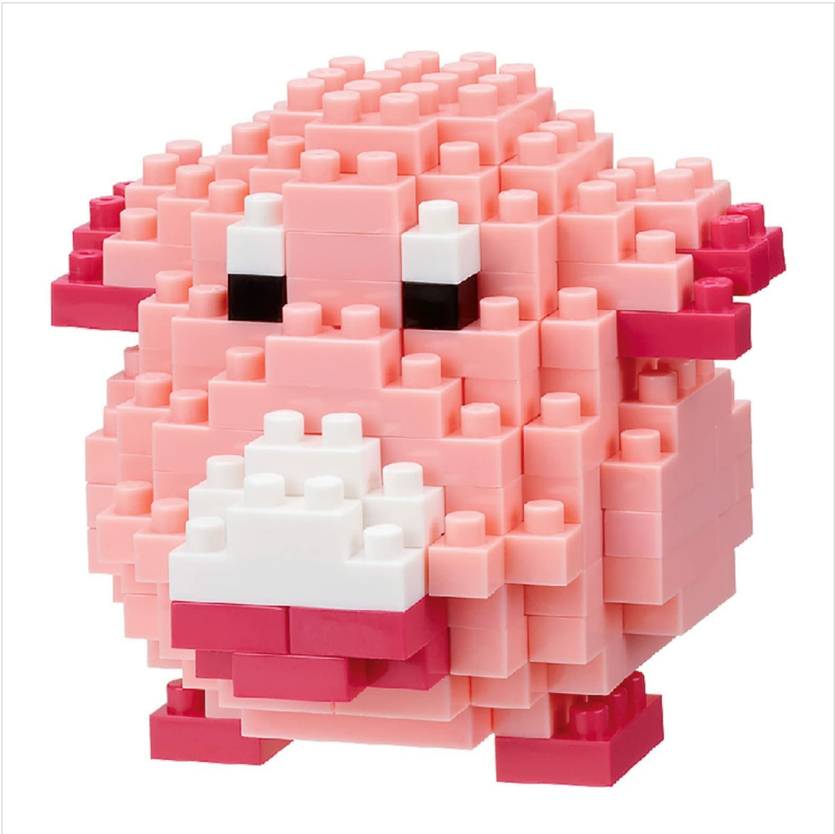
Image 1.1: Packaging for the nanoblock Pokémon Chansey Building Kit. The package shows the completed Chansey model and indicates 140 pieces.