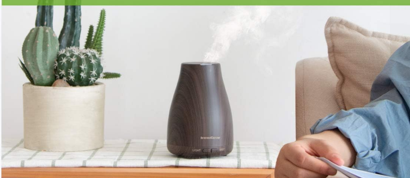
Image: Two scenarios demonstrating independent operation: one showing light only (mist off) and another showing mist only (light off).