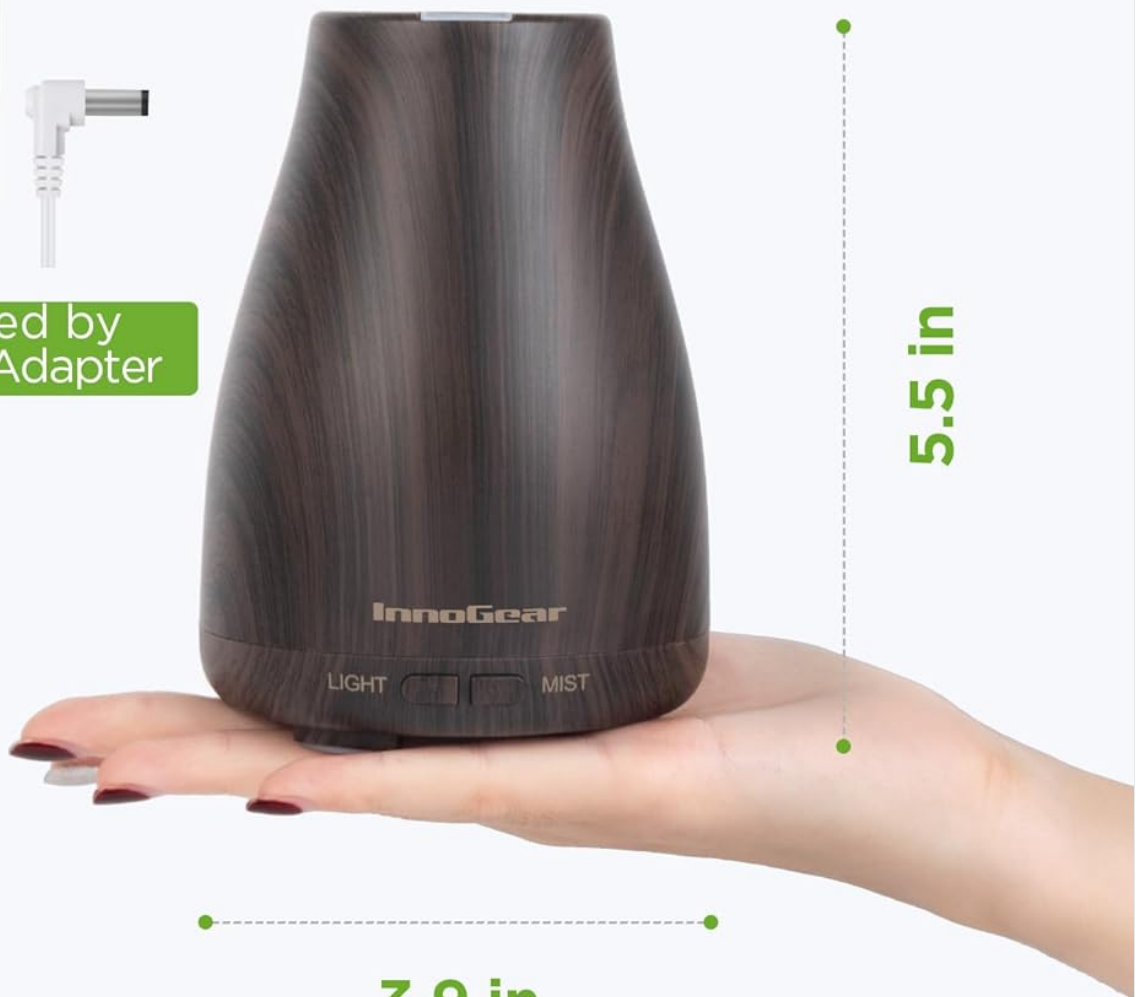
Image: The diffuser held in a hand, illustrating its compact size (5.5 inches tall, 3.9 inches wide), with the AC/DC adapter shown separately.