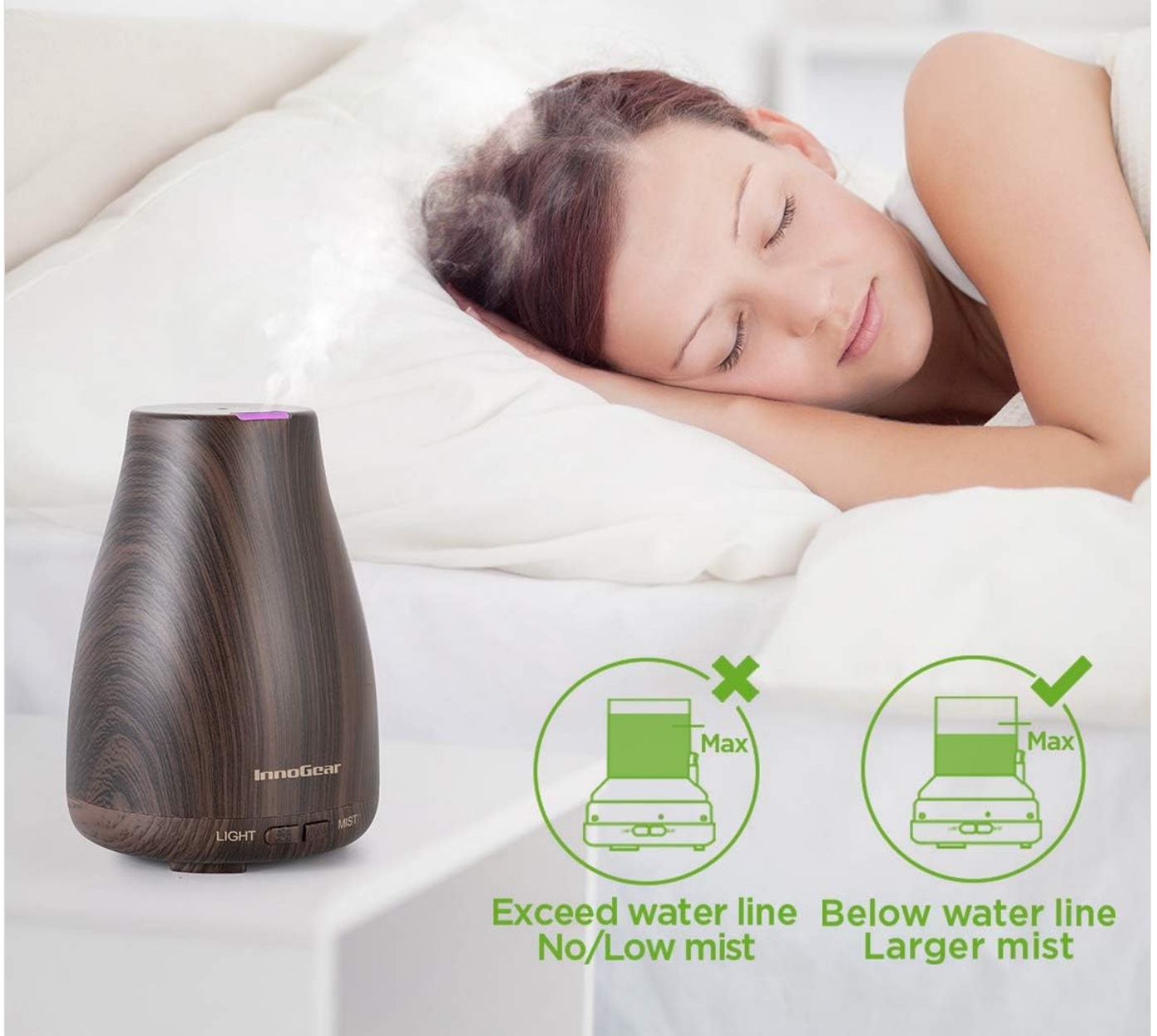
Image: The diffuser next to a sleeping person, with diagrams showing correct water level (below MAX line for larger mist) and incorrect water level (exceeding MAX line for no/low mist), highlighting the automatic shut-off feature.

Prevents overheating when water runs out