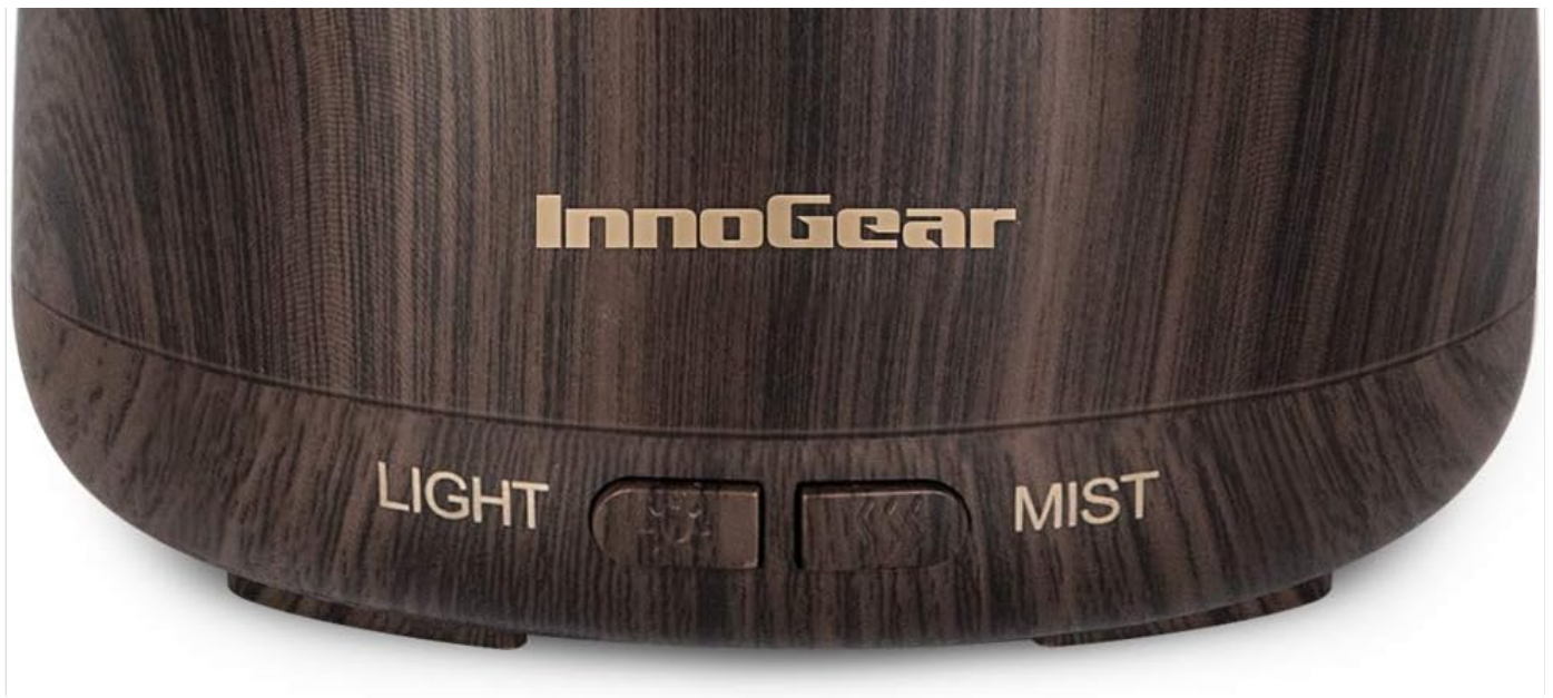
Image: Front view of the InnoGear Essential Oil Diffuser, showing its brown wood grain finish and control buttons.