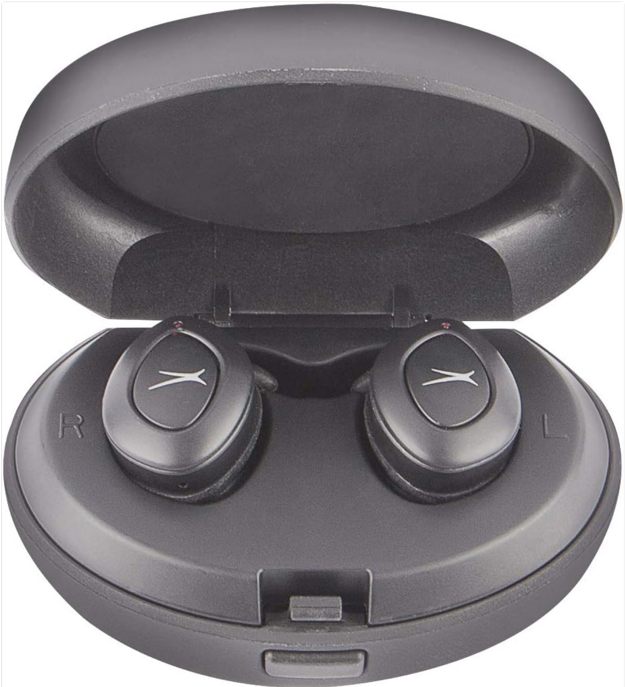
Image: The Altec Lansing Evo charging case shown open, with both earbuds securely seated inside their respective charging cradles. The 'R' and 'L' indicators for right and left earbuds are visible.