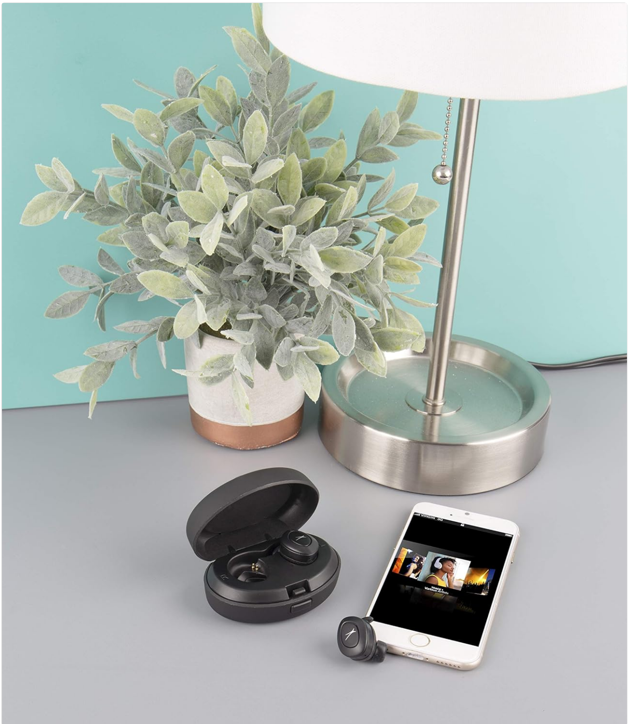
Image: The Altec Lansing Evo charging case with earbuds inside, placed next to a smartphone on a desk, illustrating a typical charging and usage scenario.