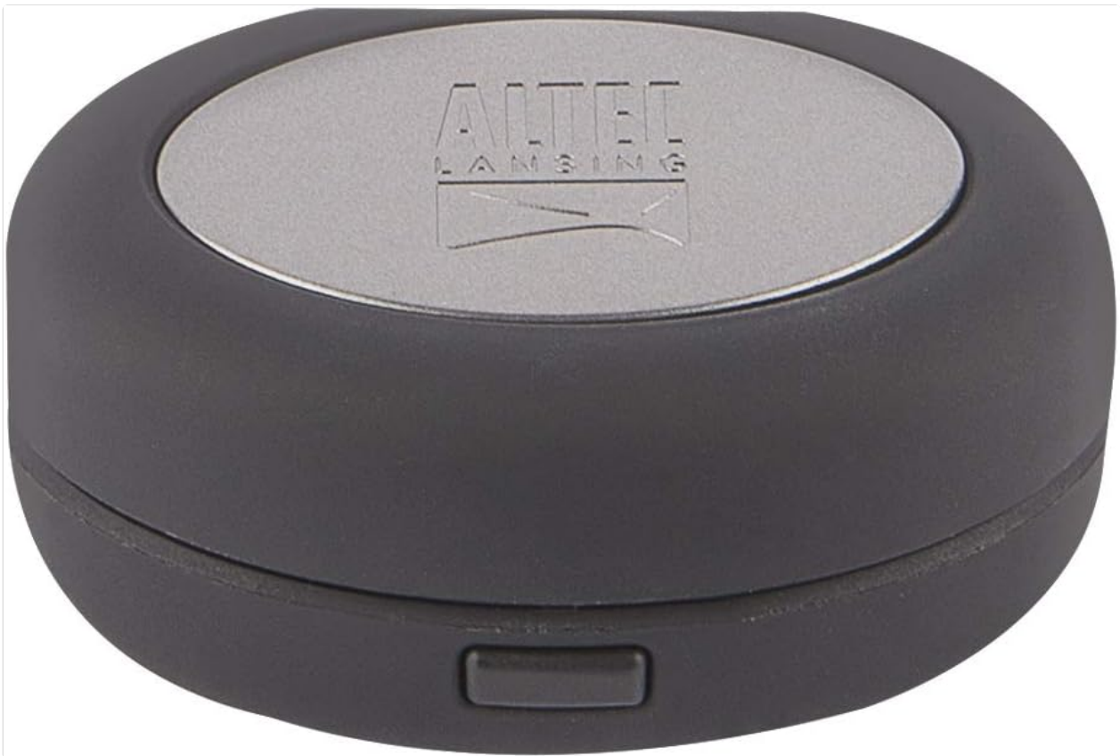
Image: The Altec Lansing Evo charging case in its closed position, displaying the Altec Lansing brand logo on the top surface.