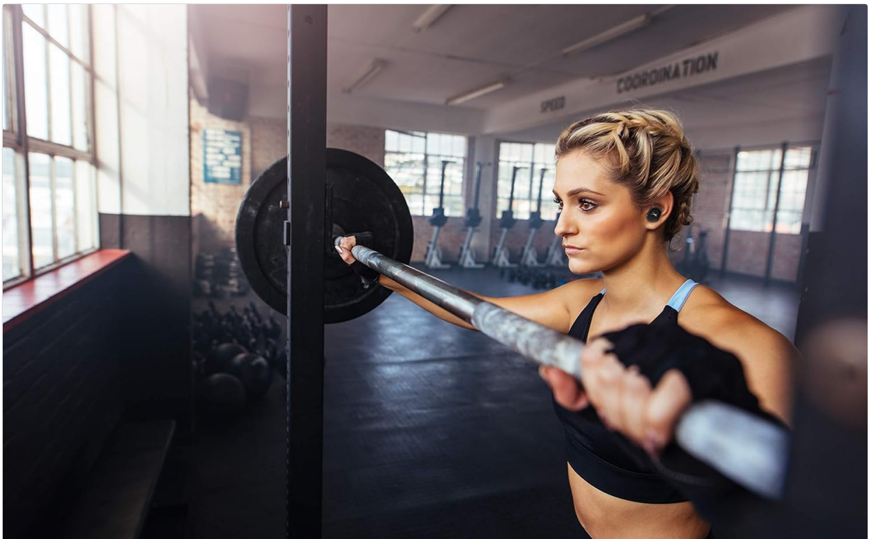
Image: A woman wearing Altec Lansing Evo earbuds while lifting weights in a gym, demonstrating their suitability for active use.