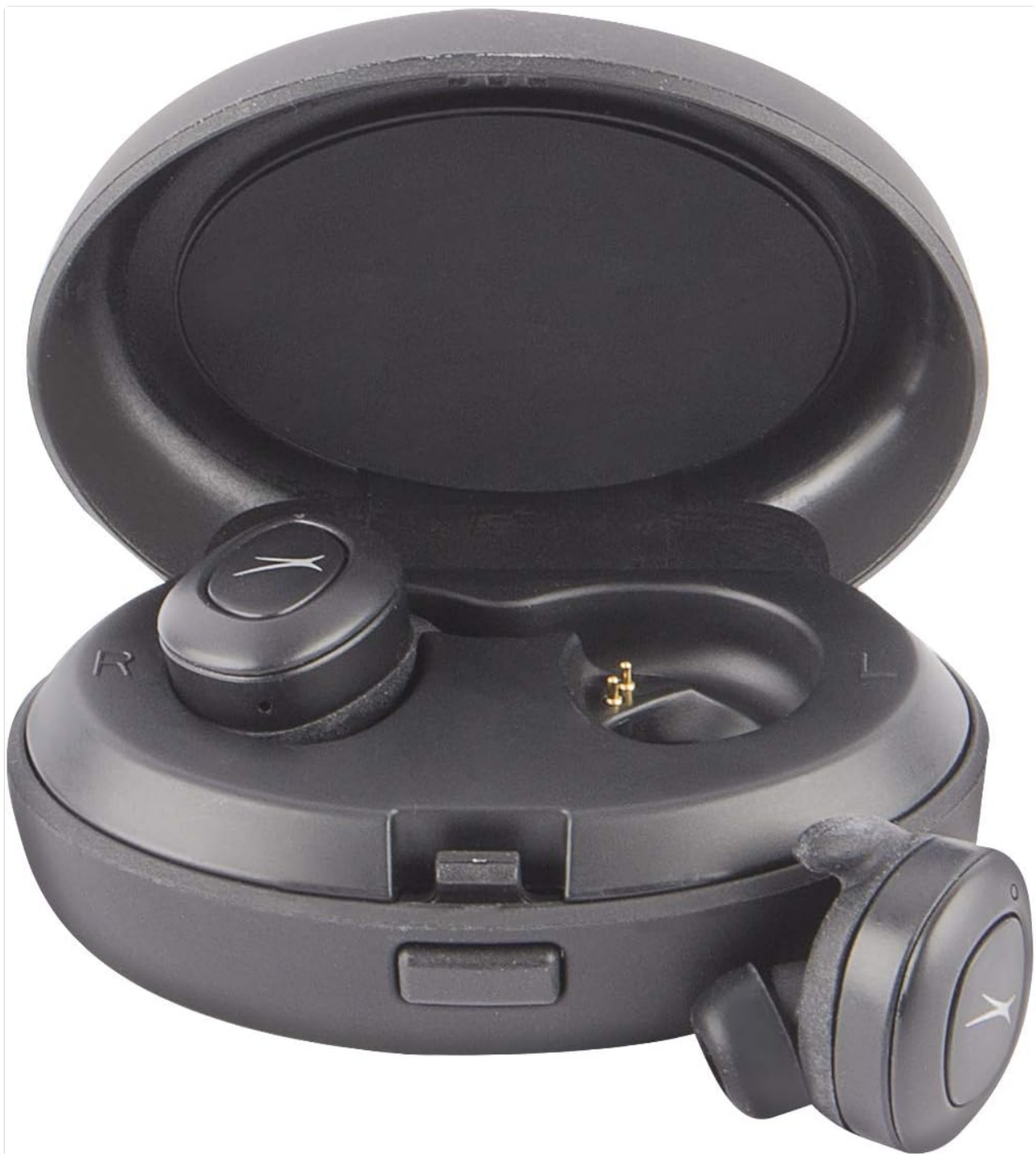
Image: The Altec Lansing Evo charging case with the lid open, showing one earbud removed from its charging slot, highlighting the charging contacts within the case.