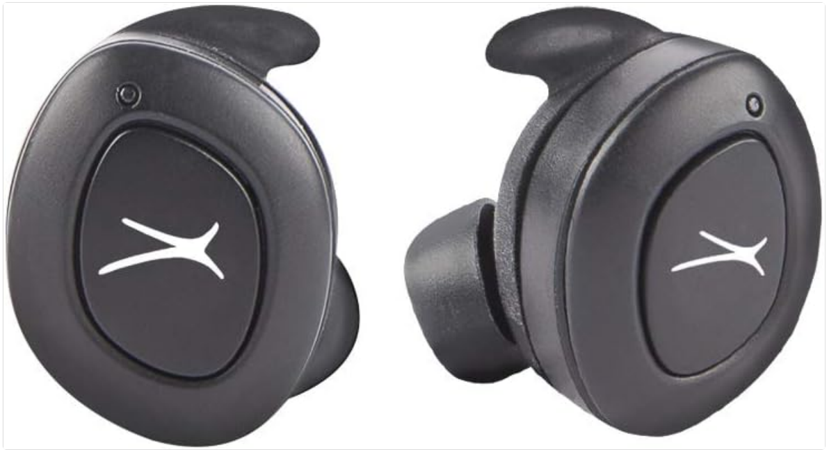
Image: Close-up view of the Altec Lansing Evo True Wireless Earbuds, showcasing their compact design and the Altec Lansing logo on each earbud.