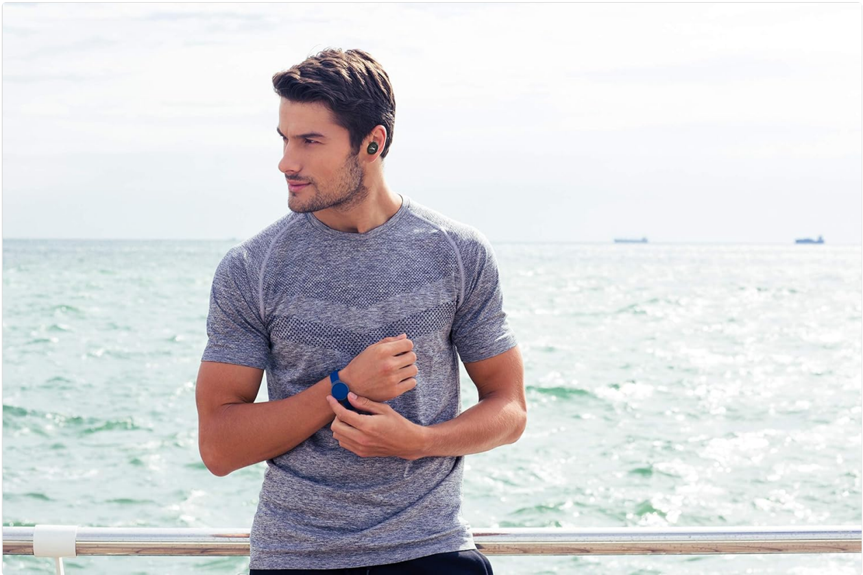
Image: A man wearing Altec Lansing Evo earbuds outdoors by the sea, illustrating their versatility for various environments.